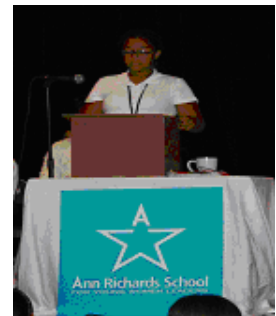
Leadership in Full Swing 6th grader Campaigning for Vice President