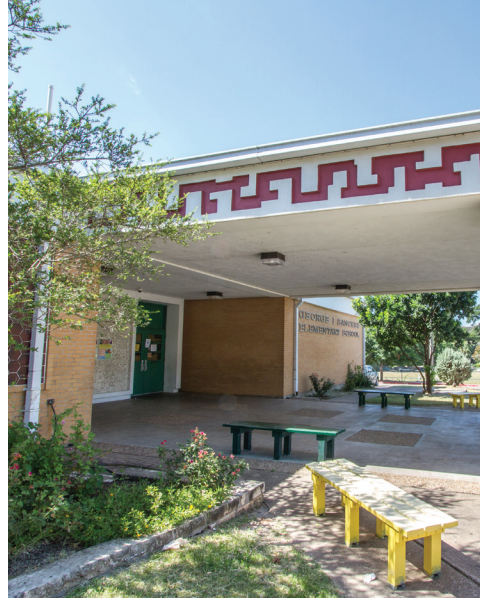
Sanchez Elementary School