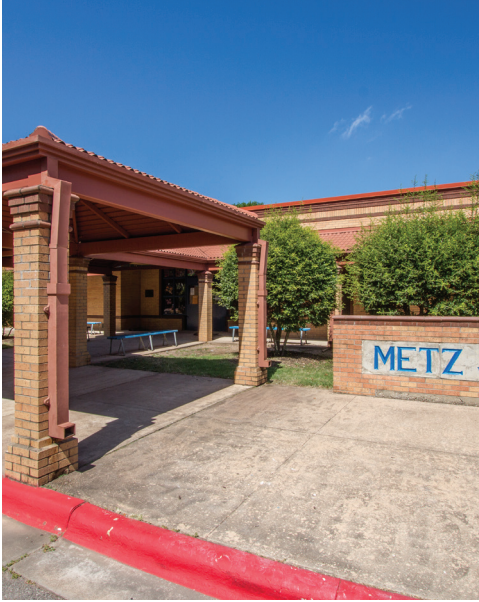
Metz Elementary School