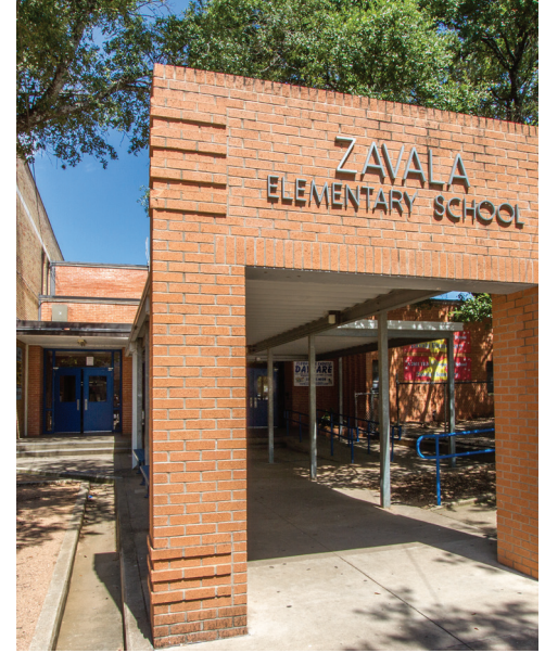
Zavala Elementary School