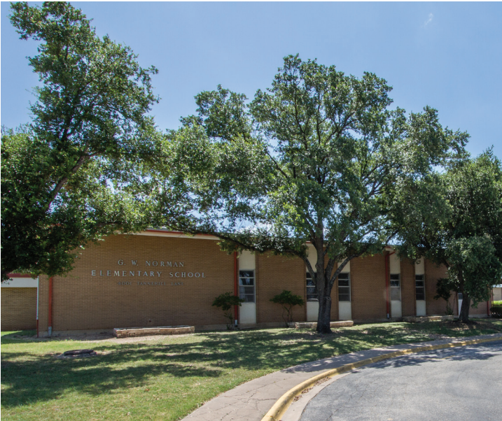
Norman Elementary School