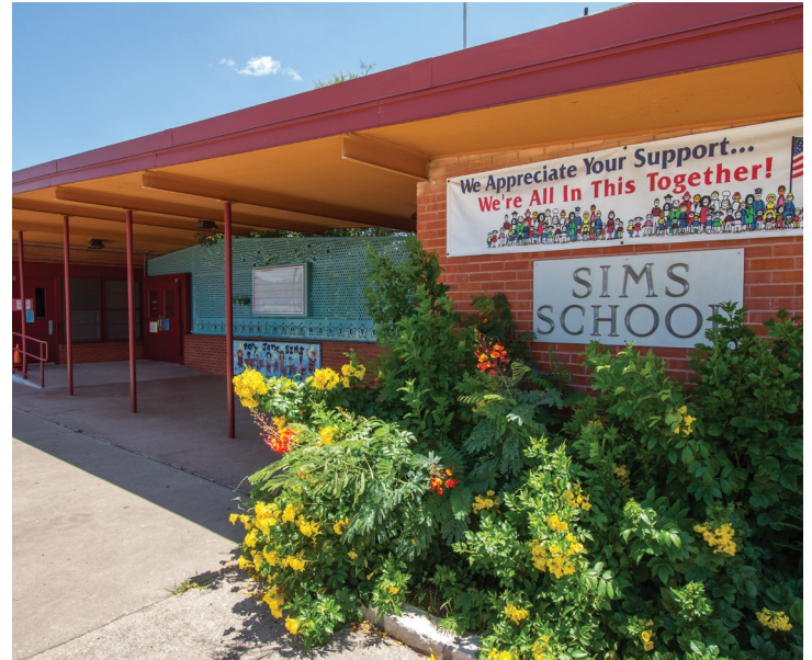
Sims Elementary School