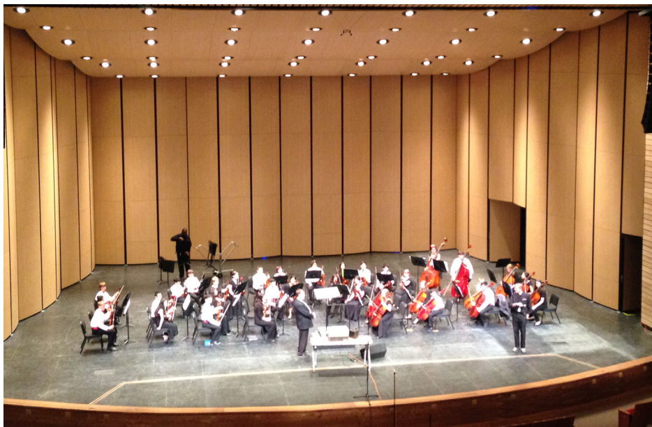
Rehearsal at the Performing Arts Center

The PAC is a district-wide facility that is available for use to all AISD schools. The PAC will host band, orchestra, dance and theatre performances and visual art exhibits and will also be used as a teaching tool for theatre sound and lighting technology and provide paid internship programs for AISD students.