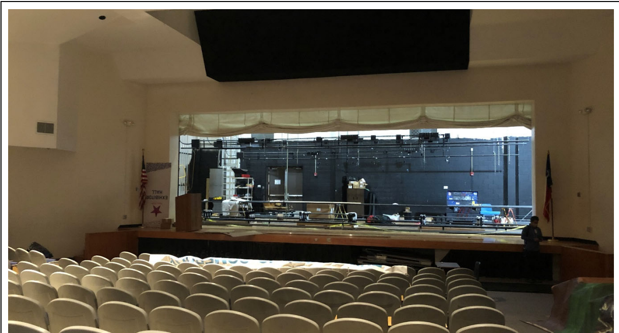
Auditorium is in satisfactory condition. Stage area does not have storage or a scene shop. There is no sink in the vicinity.