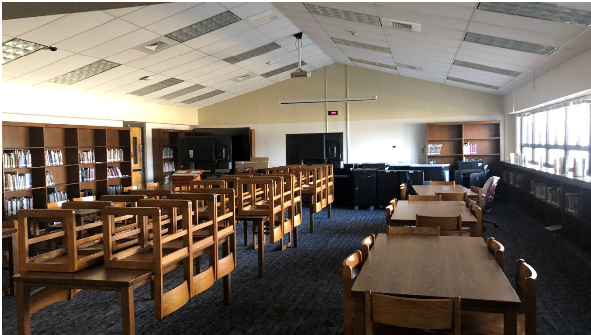
Media Center: Library is on second floor at main entry and has areas for different groups to meet. Furniture is bulky and not conducive to reconfiguration. A few pieces of furniture (not pictured) have been upgraded and are new.