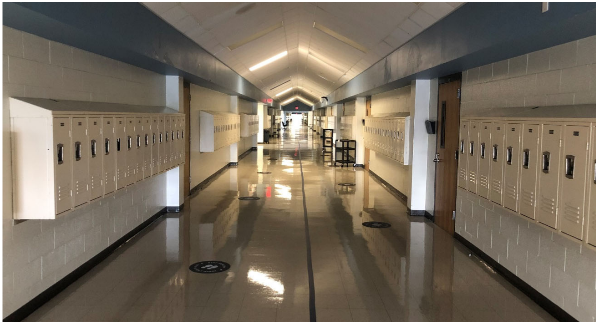
Corridors are generous in width but are long with limited daylight. Lockers are not used and run throughout the main corridors.