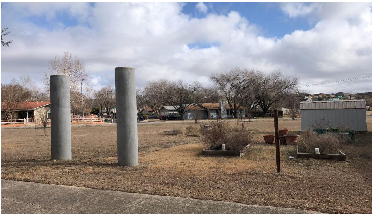
Pillars and garden are beloved by the school but require updates to function well.