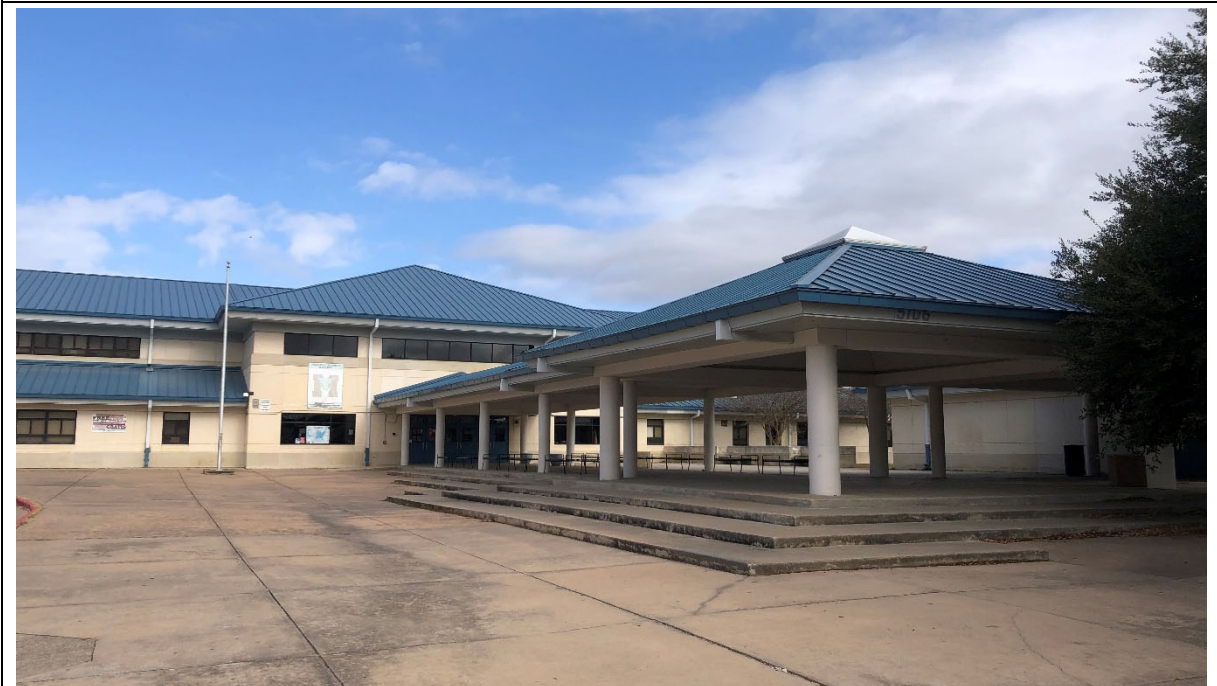
Main entry has covered canopy leading to fine arts building on the right. Glazing at main entry is limited to entry doors. There is hardscape all around the entry, which makes the entry feel unwelcoming.