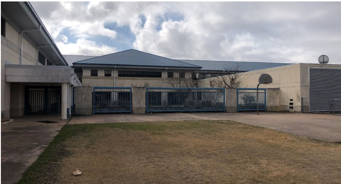
Secured courtyard in back of school is adequately sized but needs shade and updated furniture to function well.