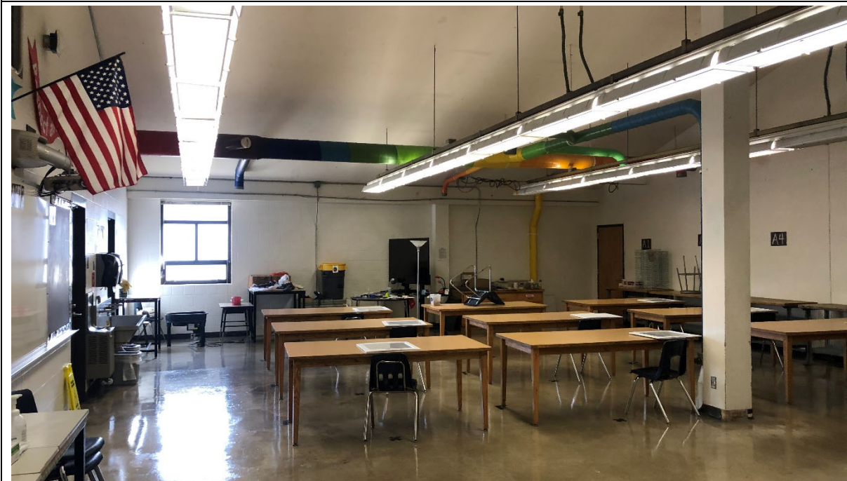
Visual art studio in CTE building is in adequate condition with needed support space.