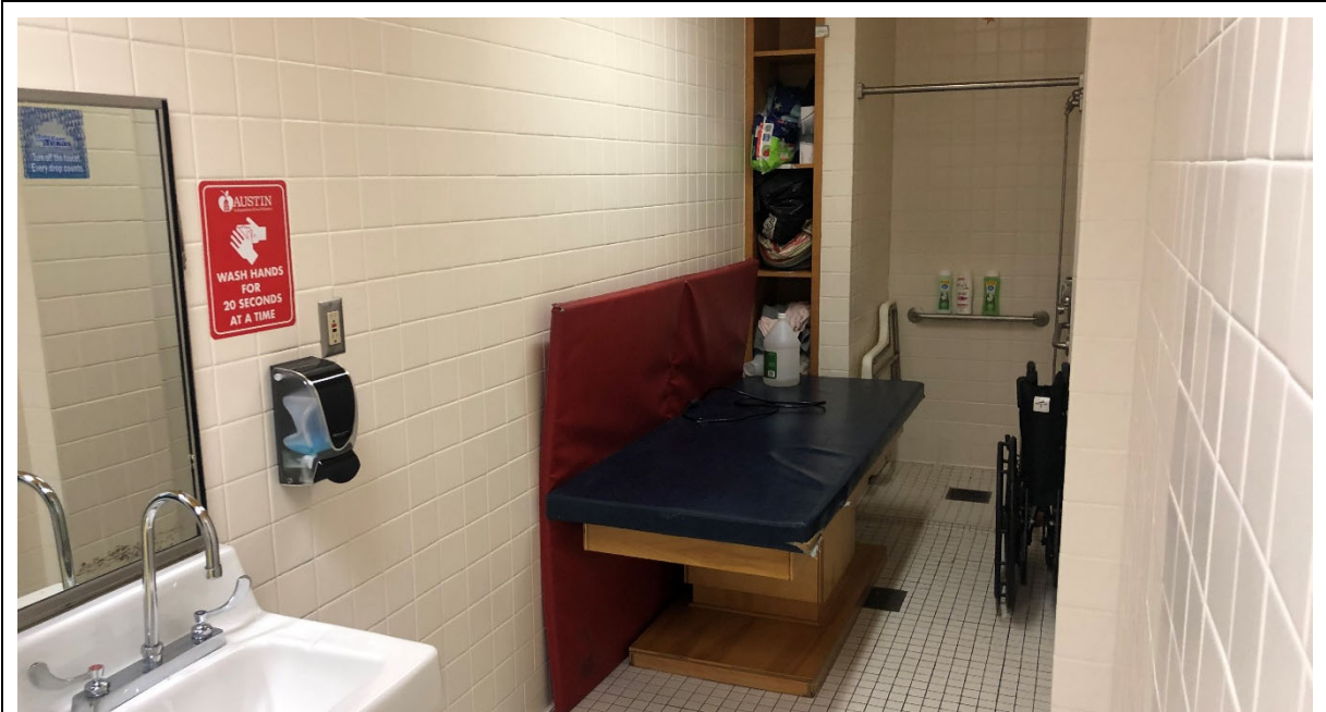
Life Skills Restroom: Shower does not function, and room is inaccessible due to changing table in the center.