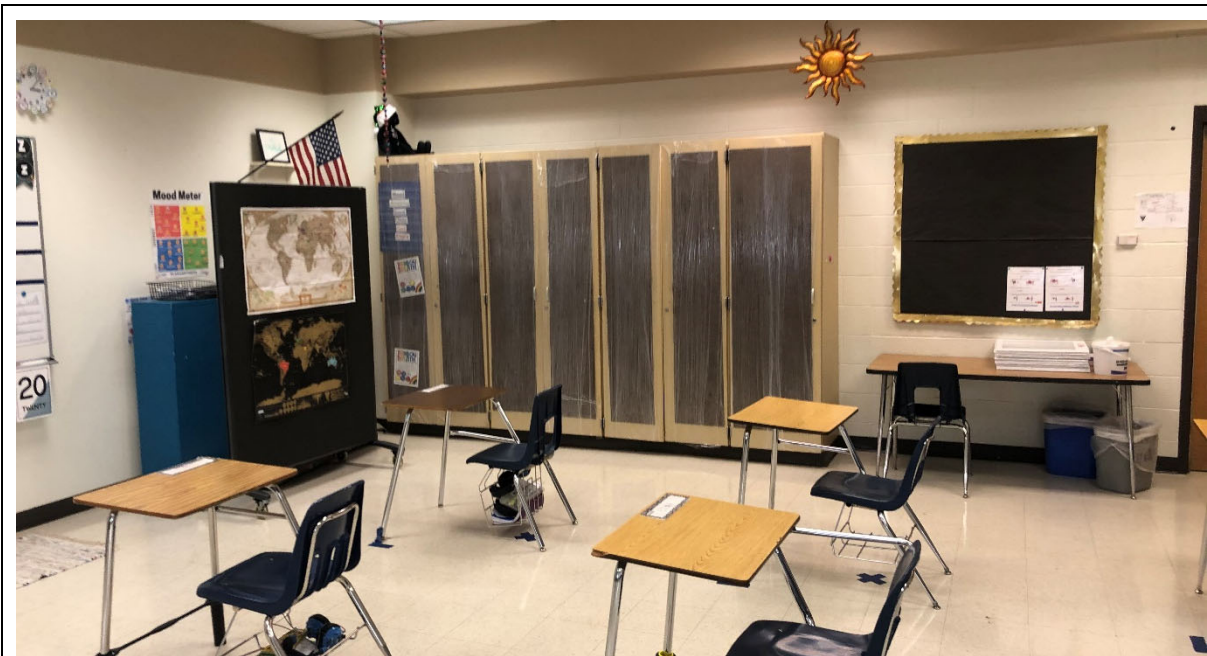
Studios are undersized and are on both sides of the double-loaded main corridor. There are no breakout or collaboration spaces provided near the studios.