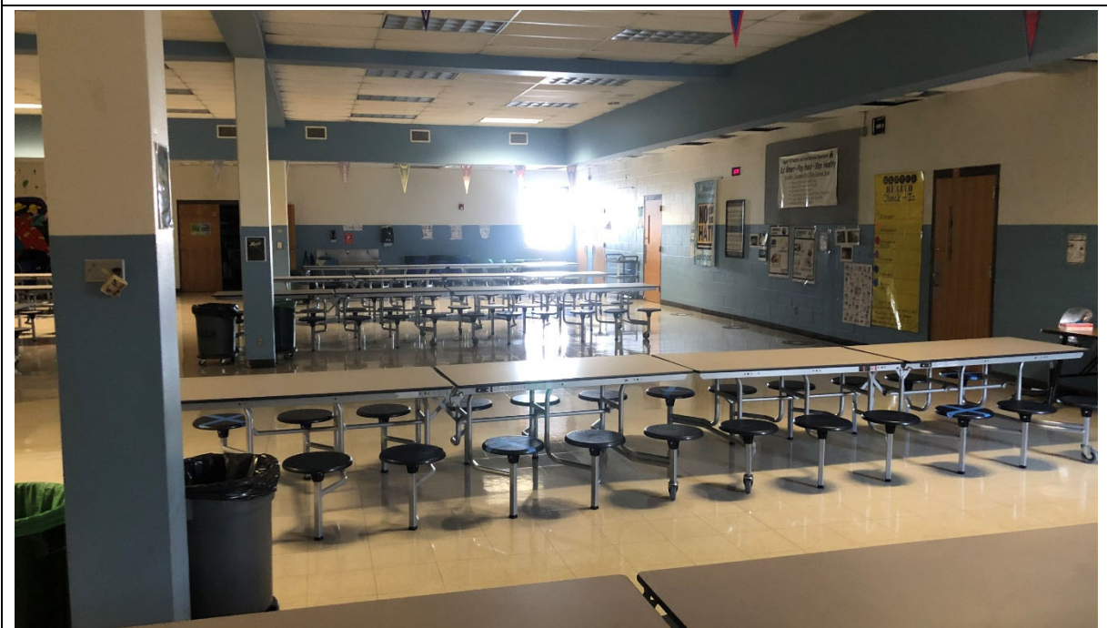
Cafeteria offers no flexibility in seating options and only a few windows allow for natural daylight. Cafeteria is undersized for campus capacity.