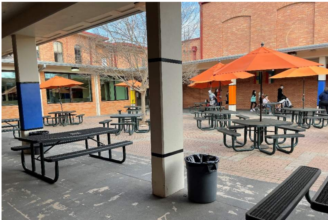
Outdoor dining area is large and has shade.