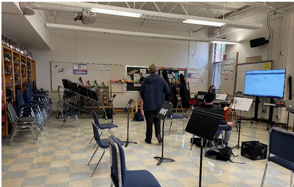
Performing arts areas are small and lack enhanced acoustical solutions.