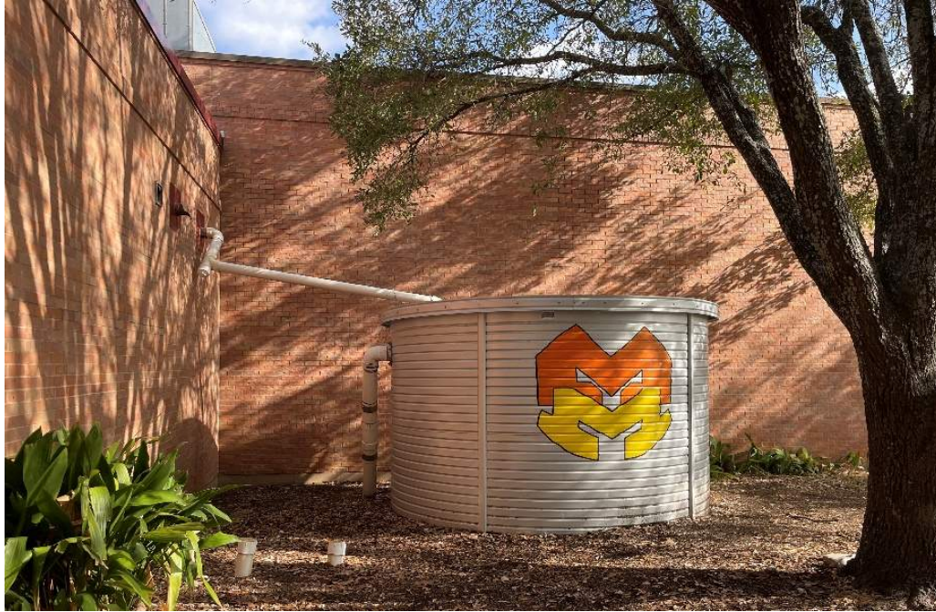
Water cistern on-site and working.