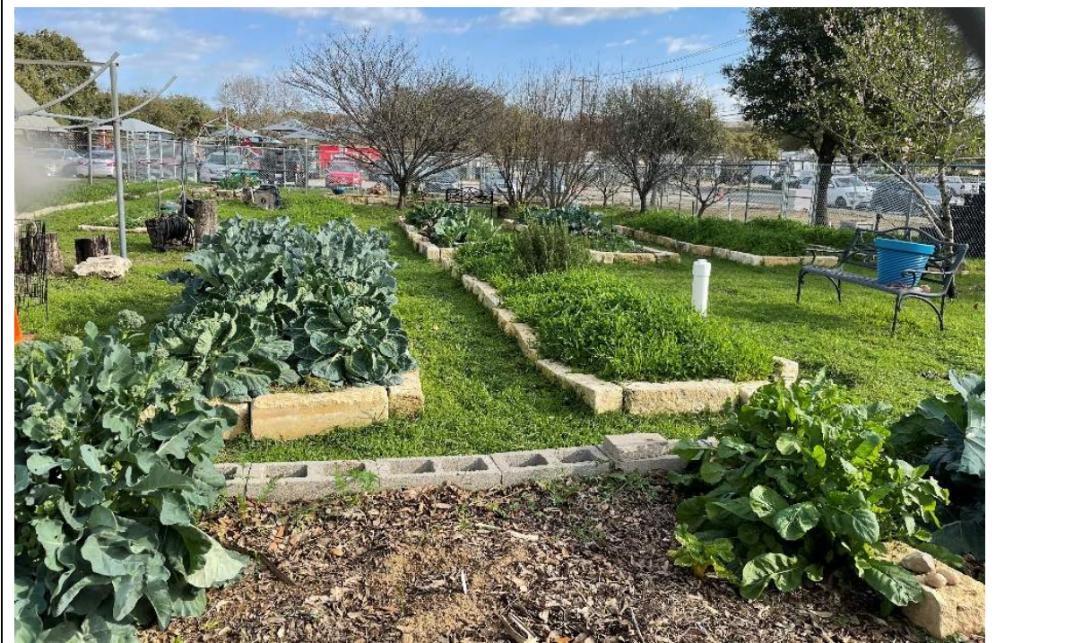
Outdoor gardening area is well maintained.