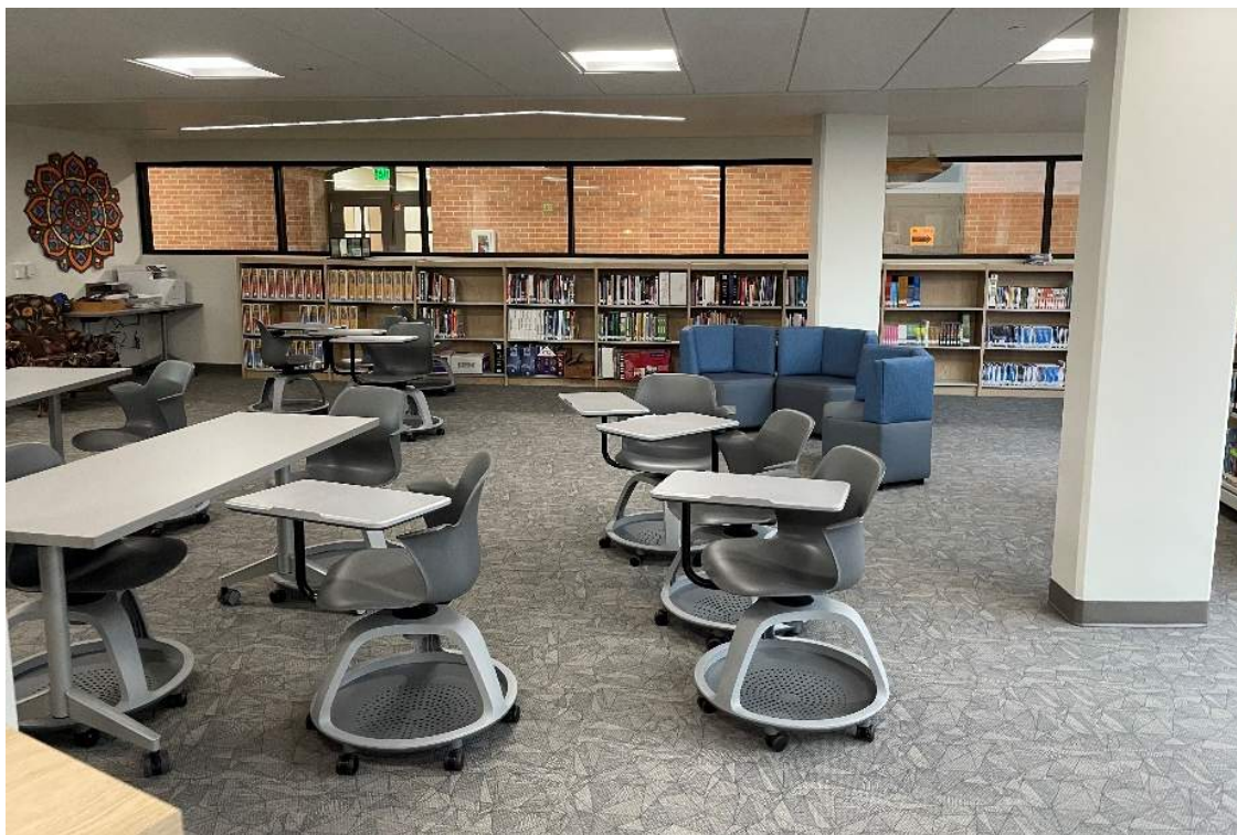
New Media Center with collaborative furniture, nice lighting, large space.