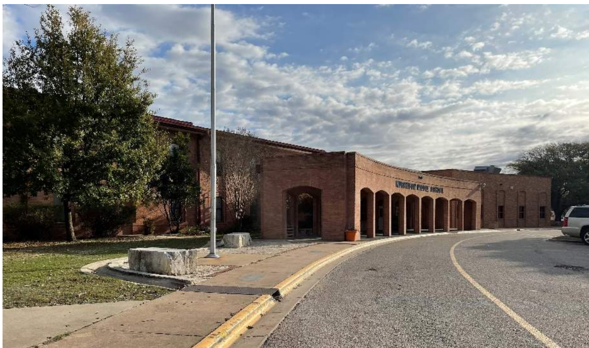
Original entry with arches. Can confuse visitors since this is no longer the main entry.