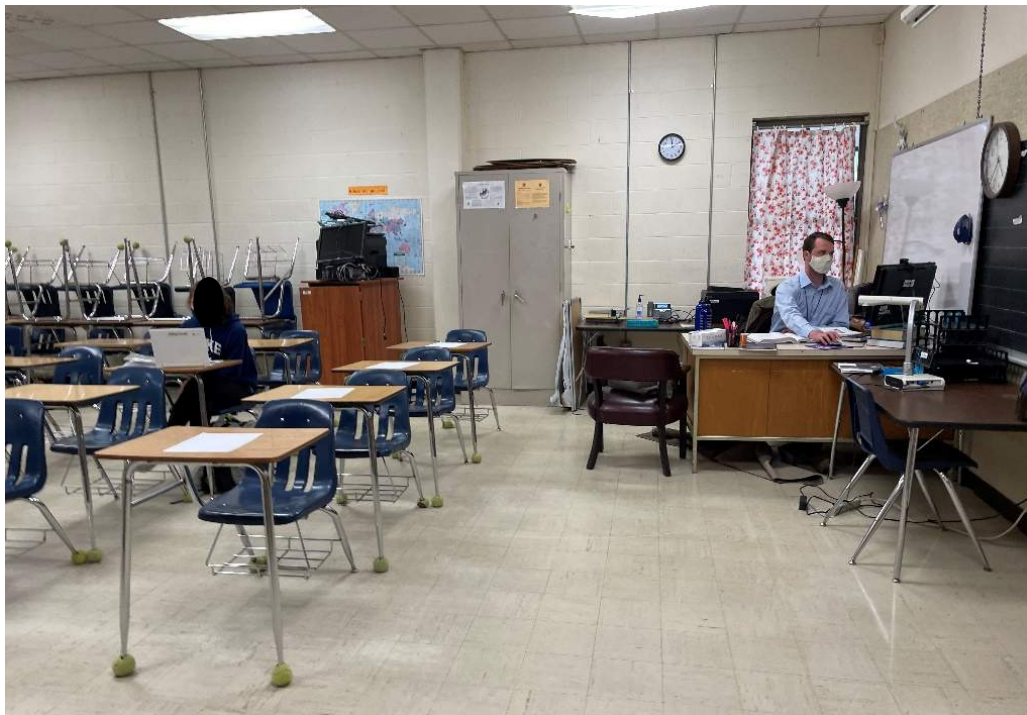
Furniture in existing building is outdated and offers only one type, which is not flexible.