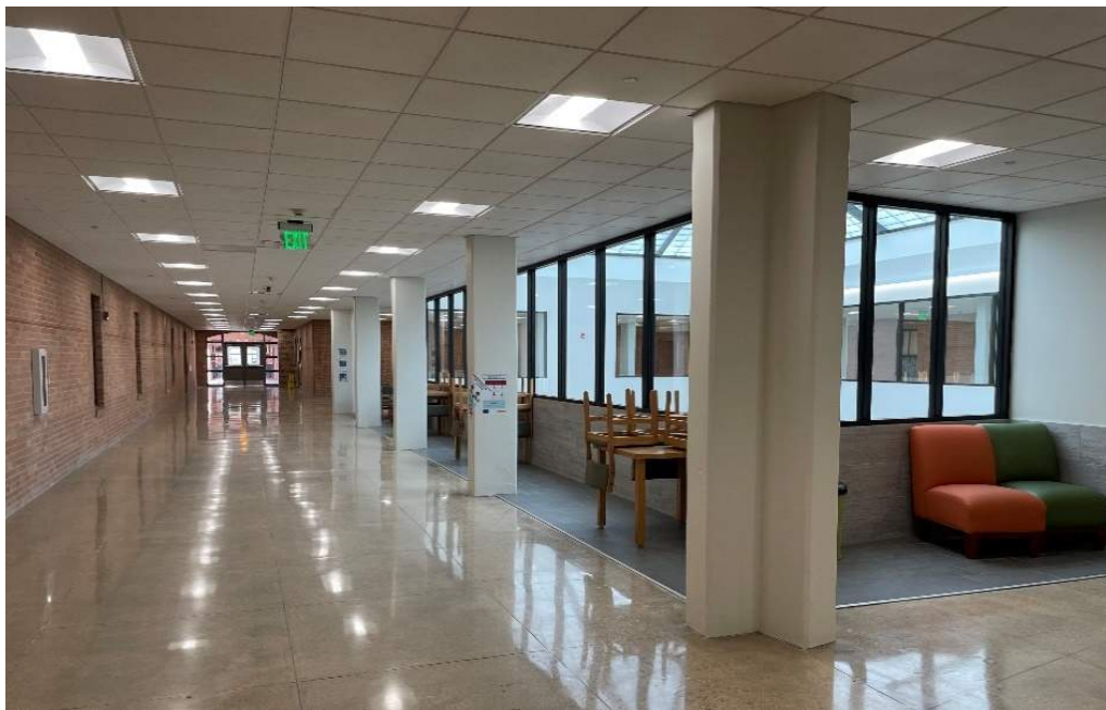
Existing building modernized to have open collaboration in corridors.