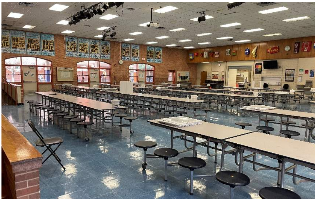
Cafeteria has only one type of furniture and needs acoustical enhancements.