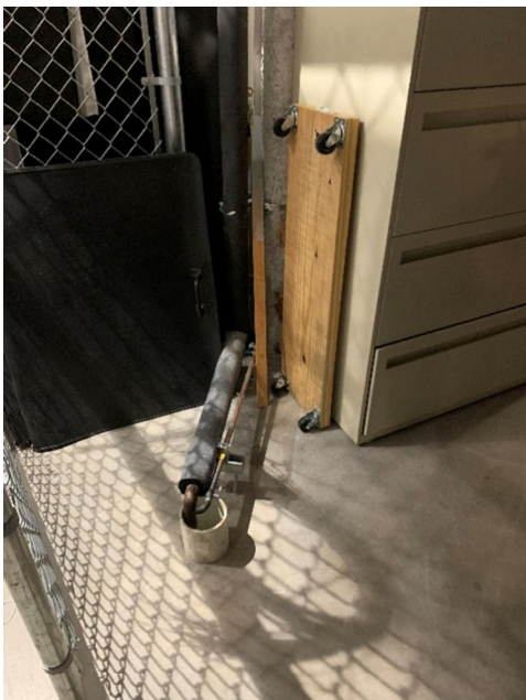
Piping that sometimes backs up and smells.