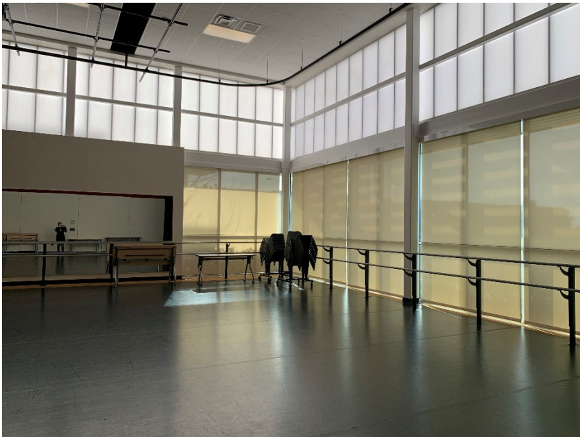
Dance Studio: Issues with daylighting so cannot use it as any other performance space. Upper panels pop during temperature changes.