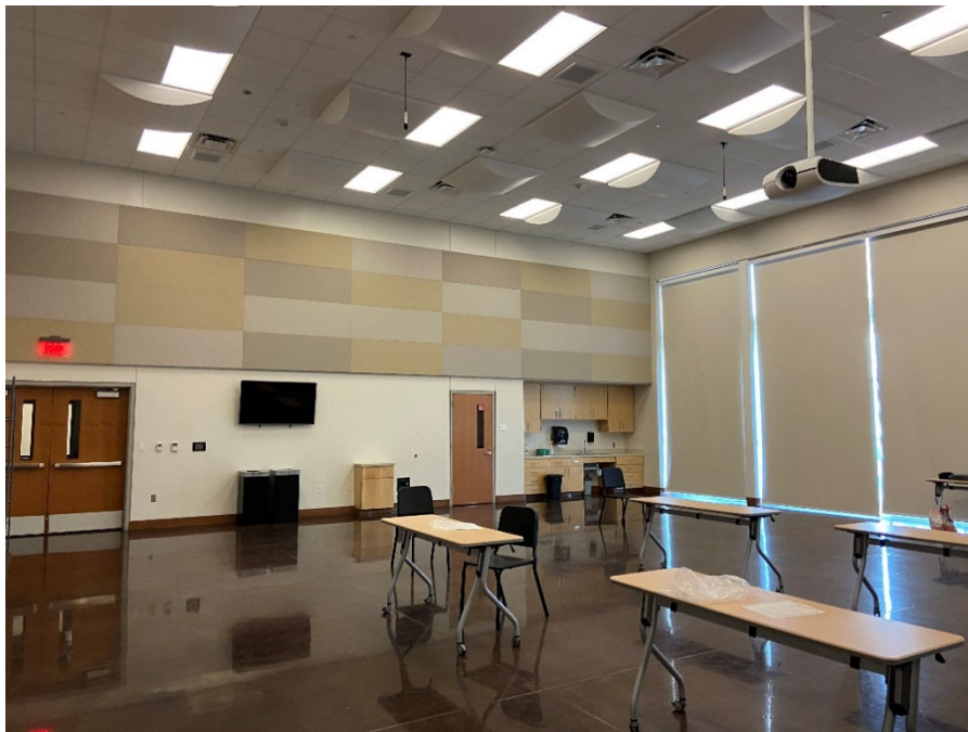
Multipurpose Room: Requested a folding partition so that it can be more flexible and host two events at once.