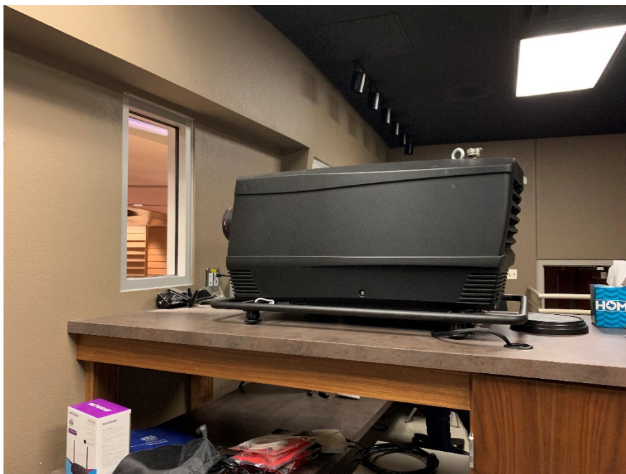
Projector is loud and gets hot. Would like to suspend it in the main hall if possible.