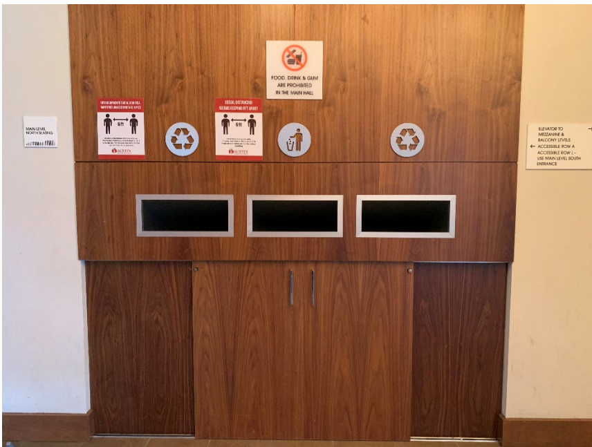
Recycling and landfill receptacles throughout but no compost.