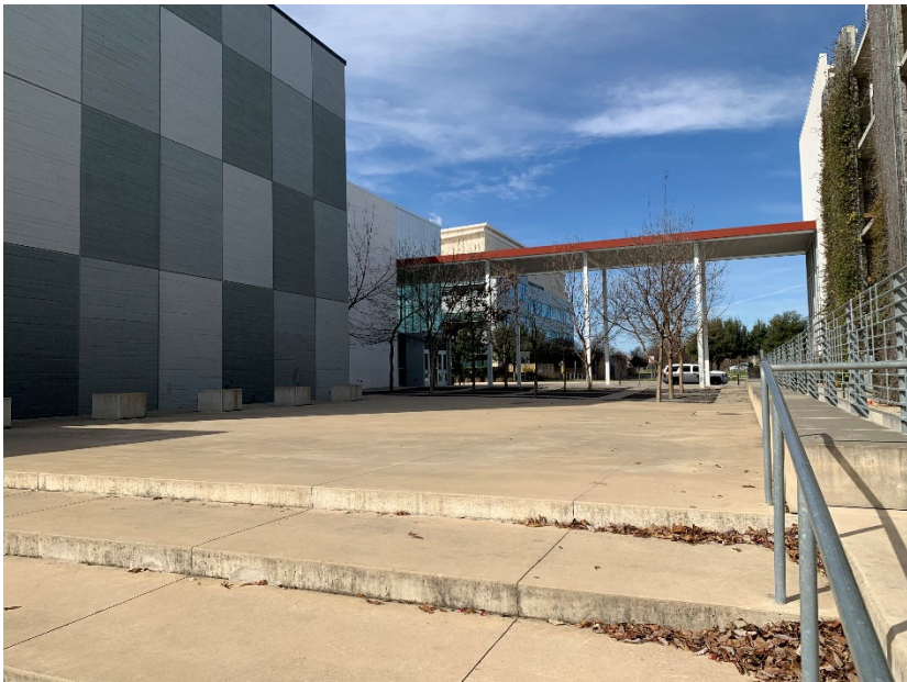
Outdoor area with lack of electricity for performances.