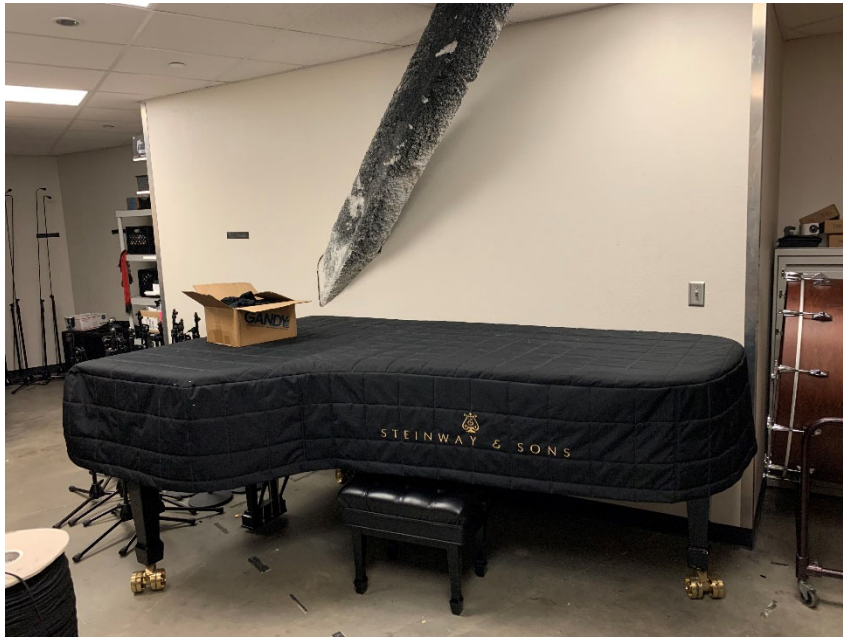
Grand piano not stored in proper climate- and humidity-controlled space.