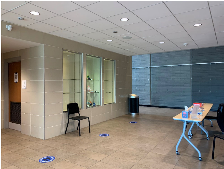
Lots of display options for student and local art.