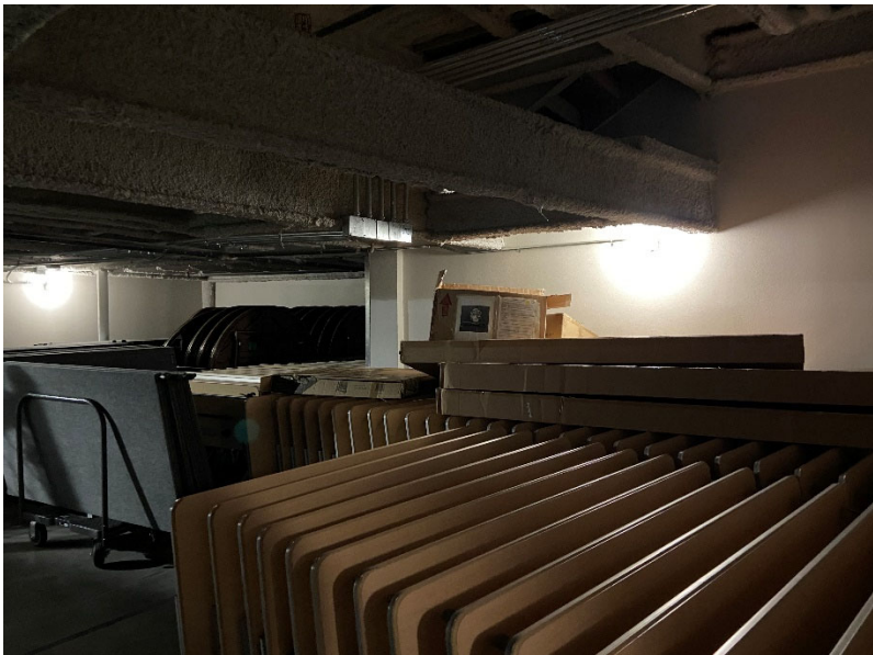
Storage under mezzanine seats.