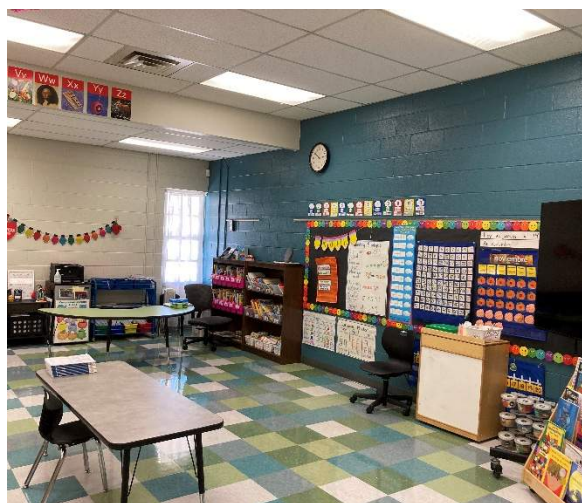
Transparency is limited in the studios. Furniture is outdated and difficult to reconfigure.