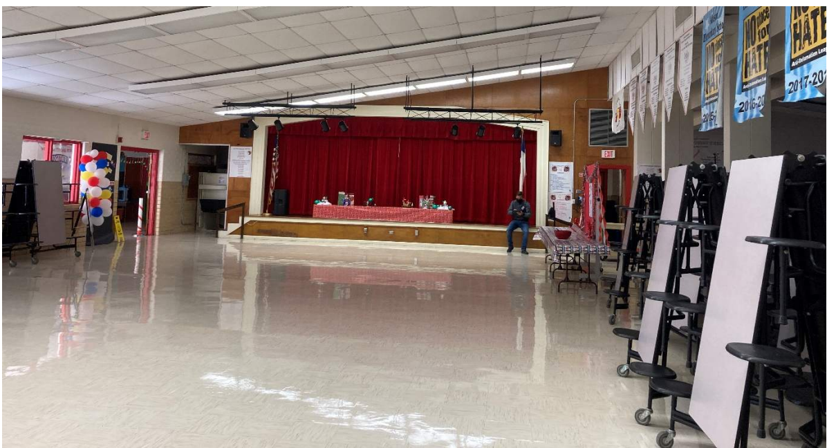
The cafeteria is undersized and has no outdoor dining available. No projector or screen is present. Only one seating type exists with fixed stools.