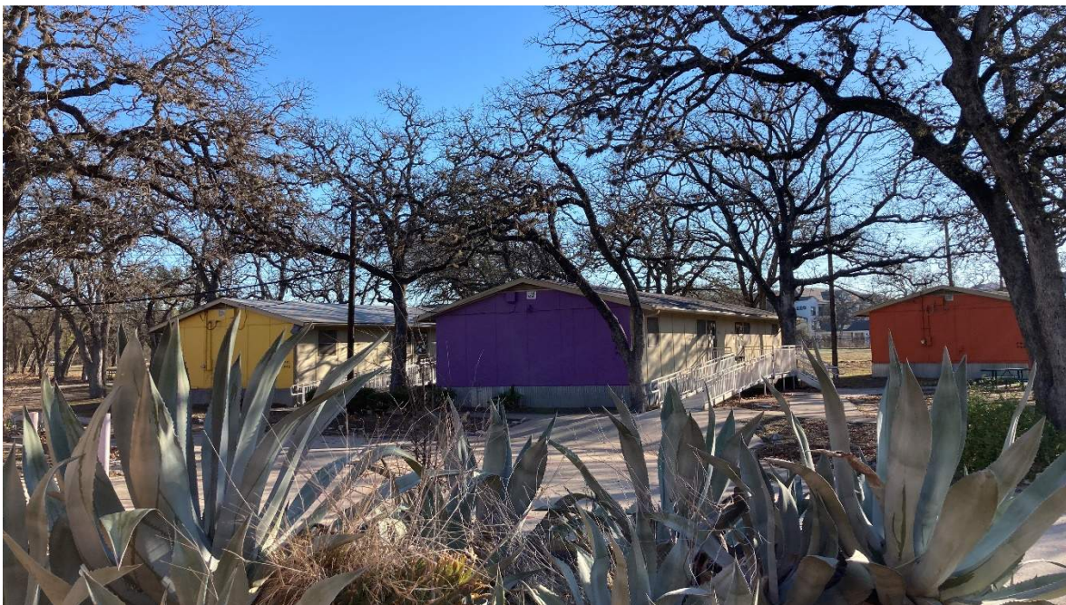
Many of the learning spaces, including the Life Skills studio, are in portables.