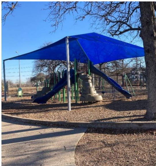
The outdoor studio is fully covered but is not adjacent to the interior learning spaces (left). The playground is fully covered and in good condition (right).