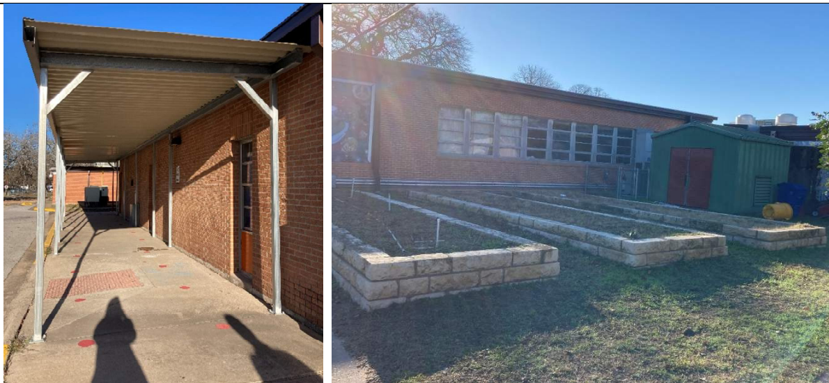
A single drop-off canopy for bus and vehicular traffic (left). The campus has large rows of planter beds with an adjacent dedicated storage shed, but no rainwater cistern (right).