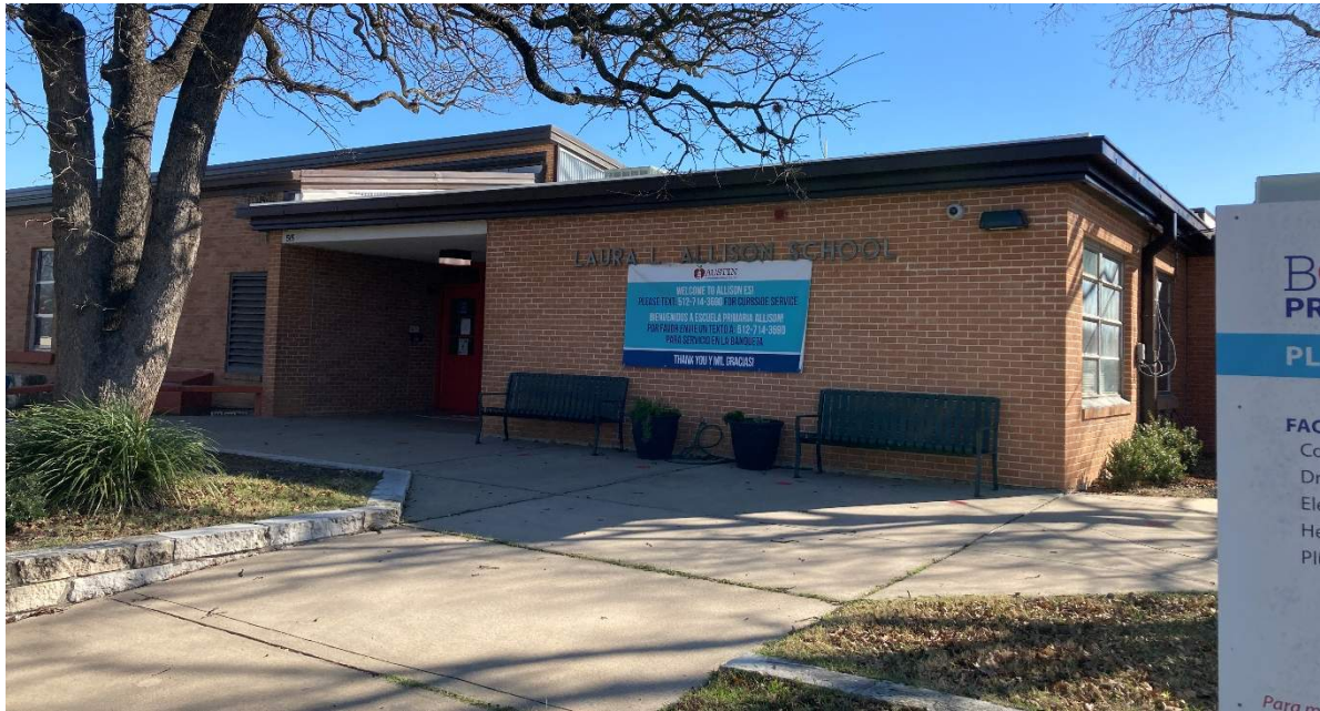
The main entry is small and difficult to access from the parking lot.