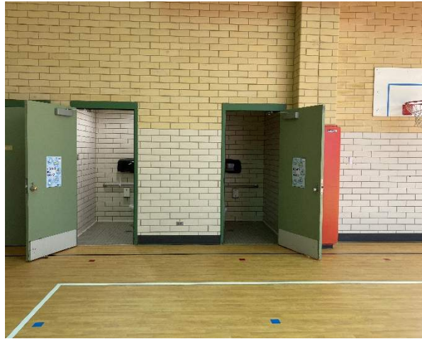
The gym floor appears to have been recently replaced, but additional renovations are needed. The ceiling is low with poor lighting, and restrooms are both undersized and open directly onto the athletic floor. No faculty toilet is present.