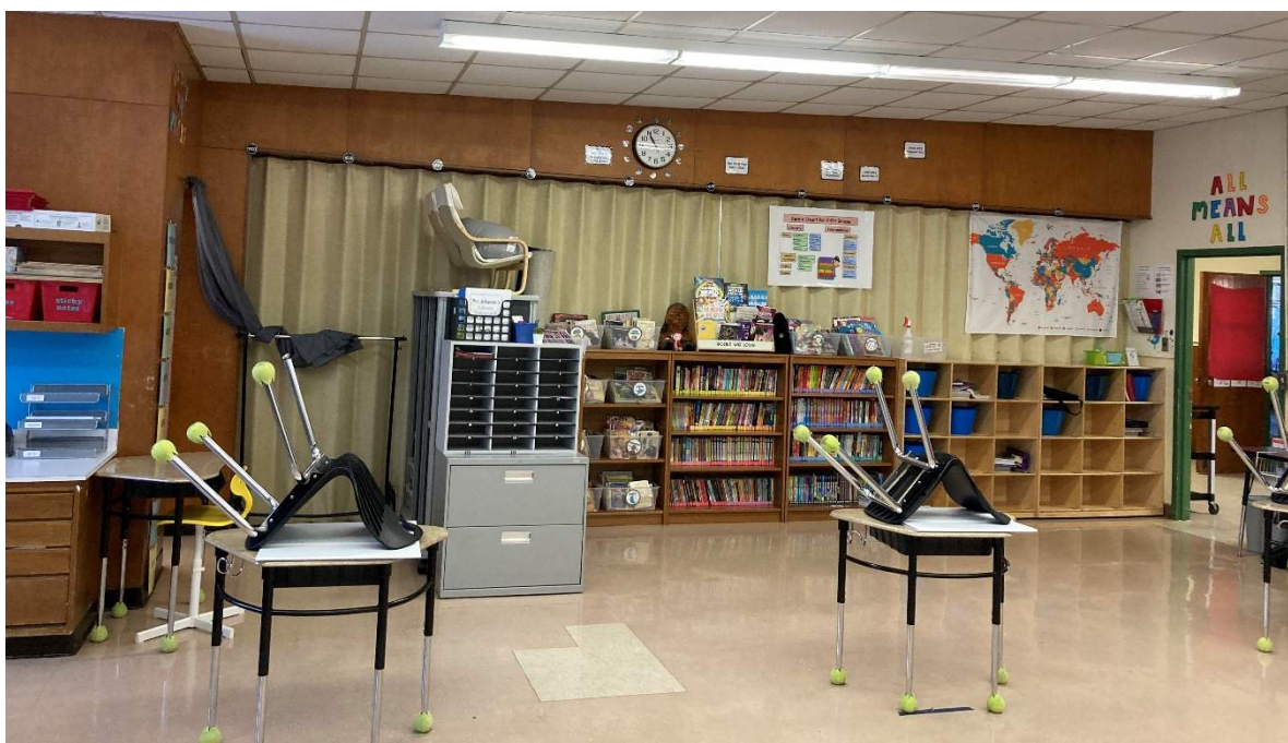
Accordion wall only exist in some studios but are outdated and not utilized.