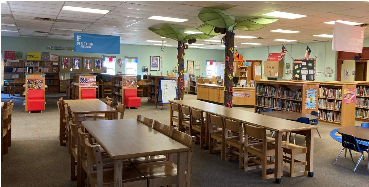
The media center is well-sized but needs technology upgrades and flexible furniture to fully support group work in various sizes.