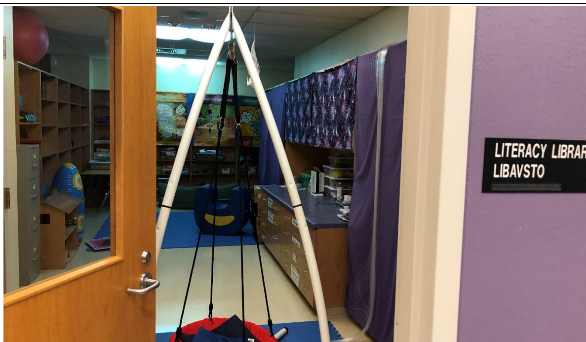
Literacy Library and A/V storage converted into mindfulness room. Library lacks storage.