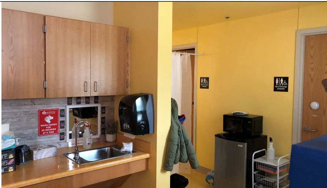
Studios connected with bathroom corridor and outfitted with curtain to limit distraction from adjacent room.