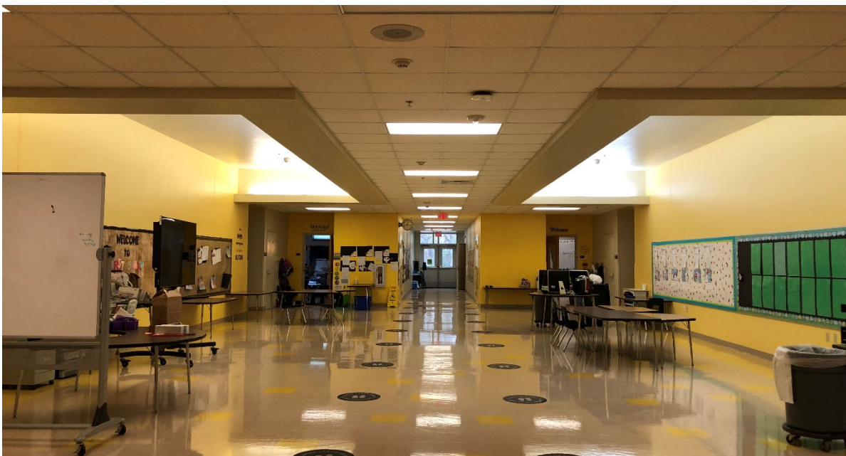
One of the collaboration spaces on campus within one of the learning neighborhoods. Functions well for larger groups. No small group spaces are provided.