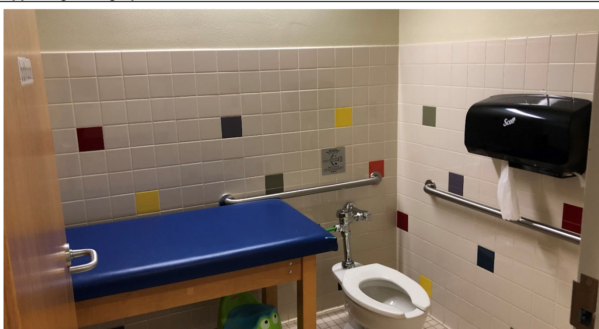
Bathroom for special education with limited space to accommodate changing table.