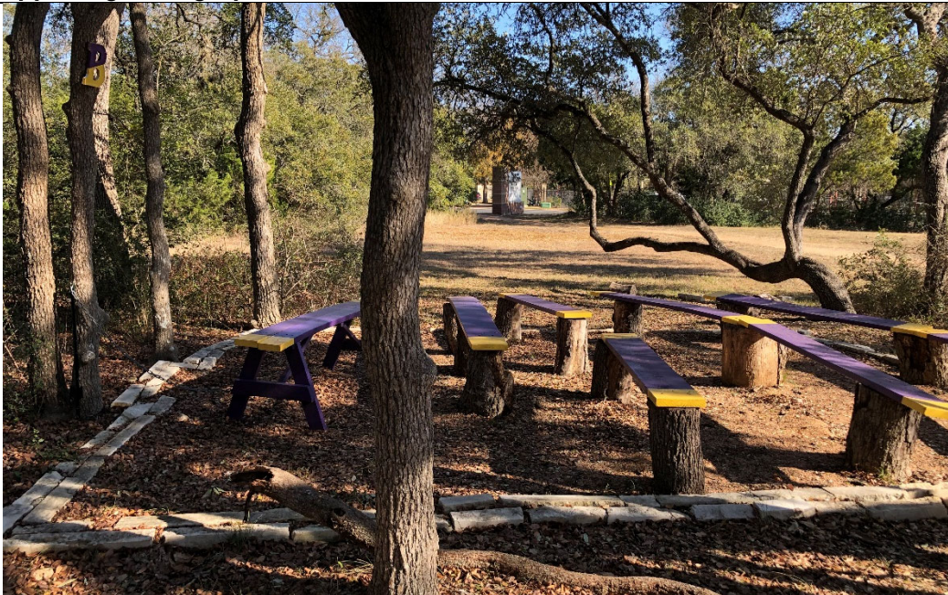
Outdoor learning spaces need further development to function well.