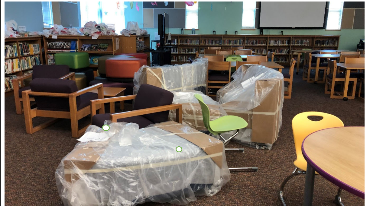
Variety of furniture seating options in library. Library is in the process of receiving updated furniture.