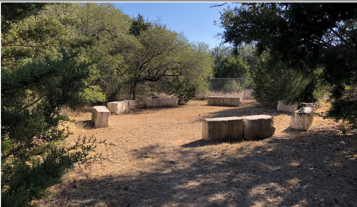
Outdoor learning space needs shade and updates to function well.