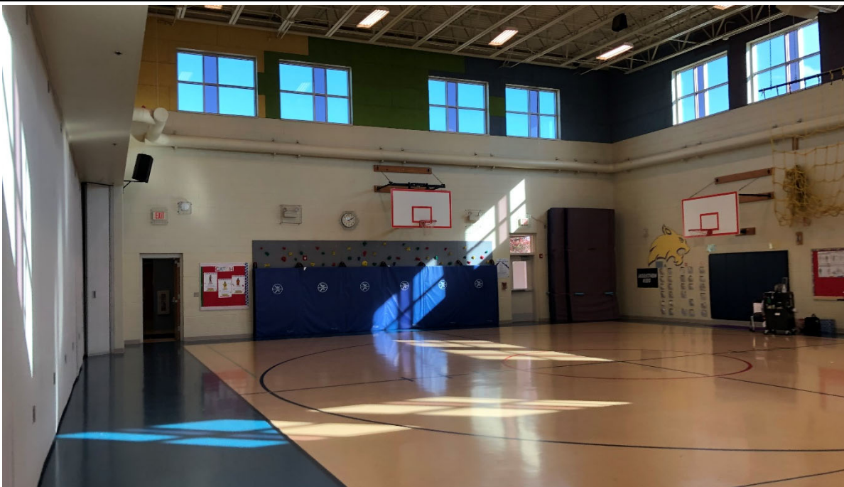
Gym appropriately configured with operable partition opening to the cafeteria.