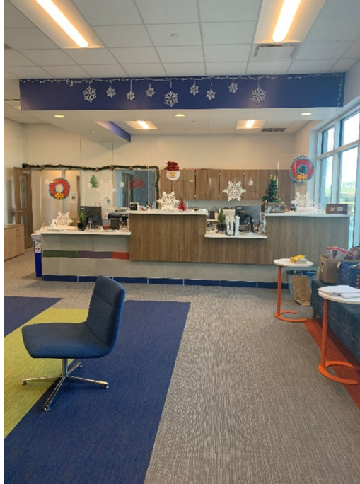
Media Center (Intermediate, left): Transparency and flexible seating in the media center. Reception (Intermediate, right): Welcoming reception space in the administrative area.