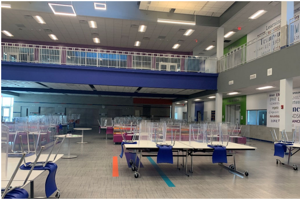
Cafeteria (Intermediate): Cafeteria has a variety of seating options.