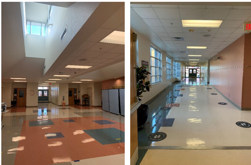
Common Areas (Primary): Learning neighborhoods and wide corridors have natural light.