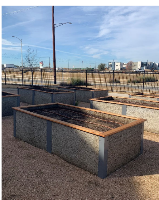
Exterior (Intermediate): Covered walkway at entry; raised community garden beds.