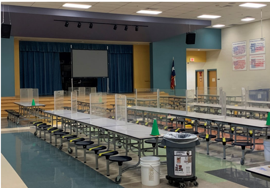
Cafeteria (Primary): Cafeteria has only one type of seating option.