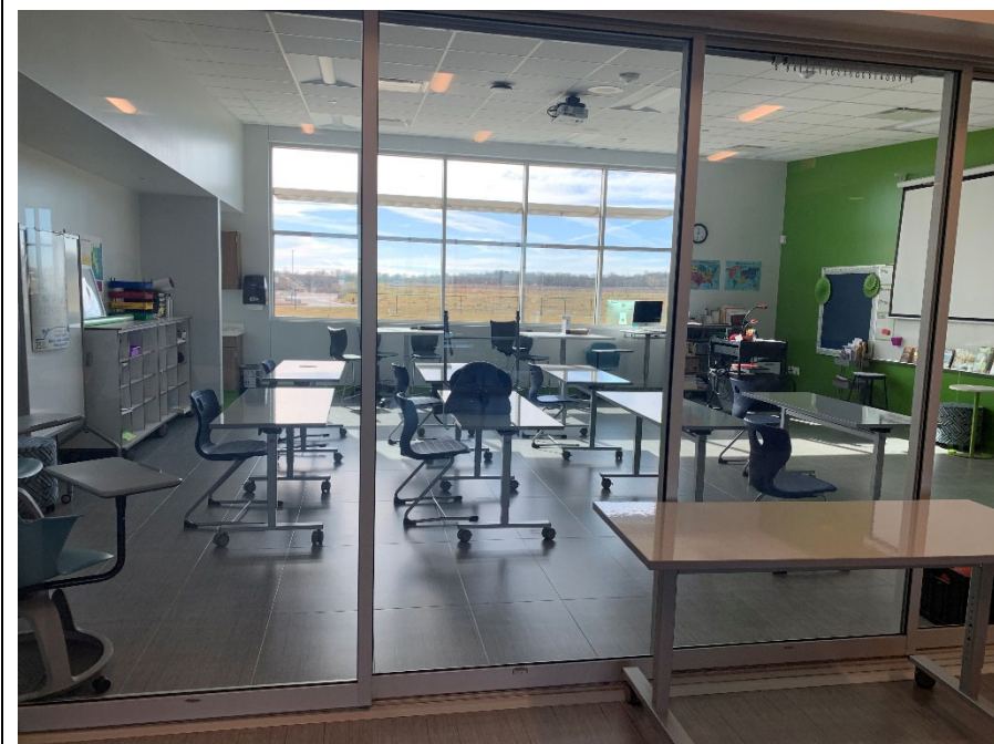
Studio (Intermediate): Studios have a variety of furniture, movable glass walls and plenty of natural light.