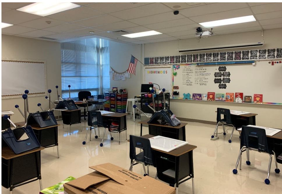
Studios (Primary): Most furniture is not reconfigurable or easily movable.