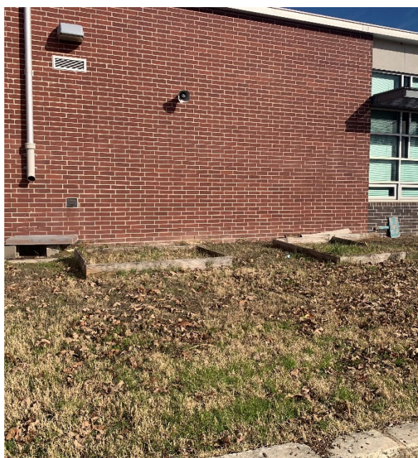
Exterior (Primary): Covered playground; community garden beds are undersized and not maintained well.