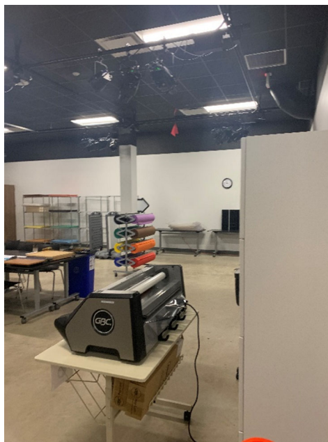
Blackbox (Intermediate): Lack of storage areas. Blackbox currently used as storage/workroom.