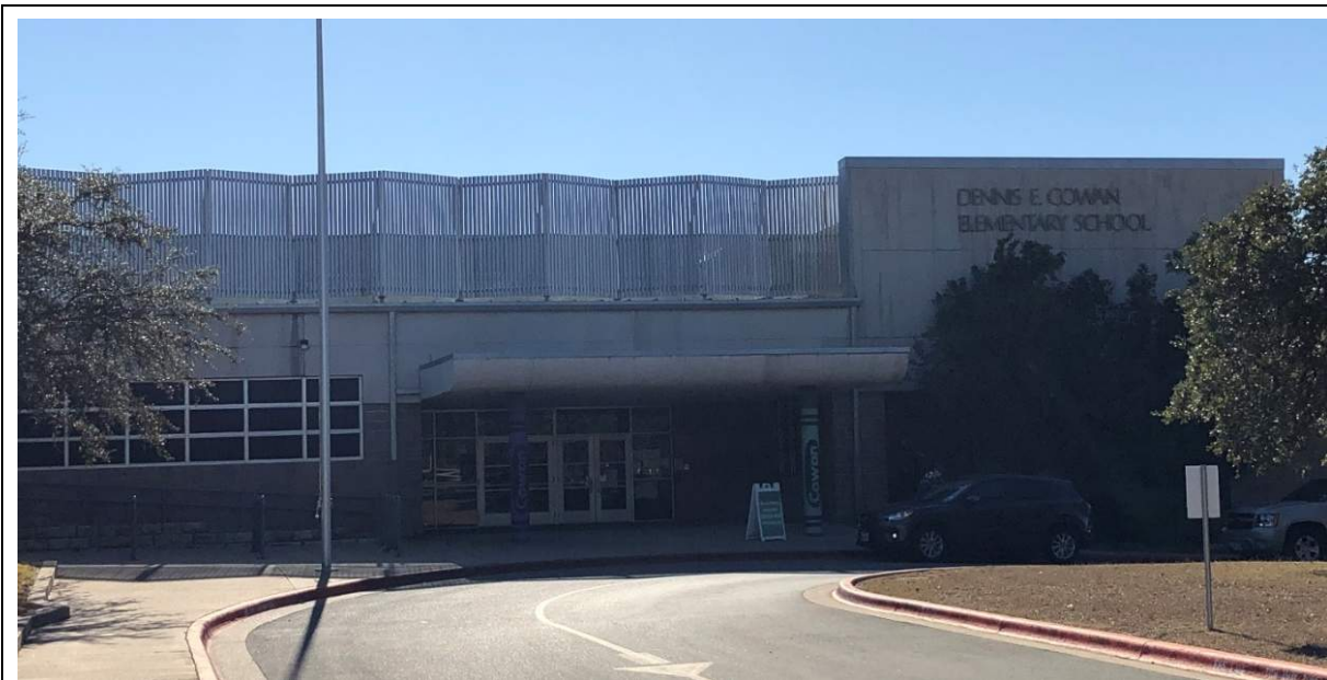
Entry has iconic crayon columns. Bus and car drop-off and pickup are separate and away from parking. Canopy does not sufficiently protect children from rain.