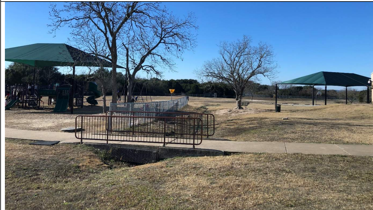
Play areas are fully covered by shade structures.