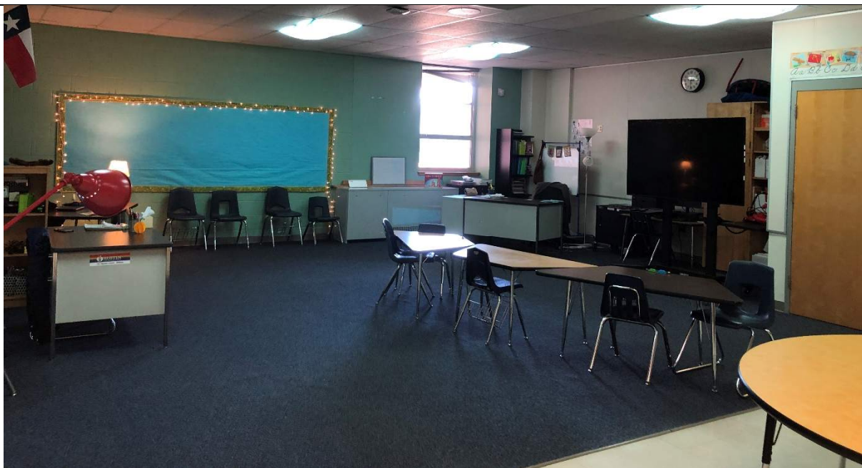
Typical studios have minimal natural light and access to outdoor views.