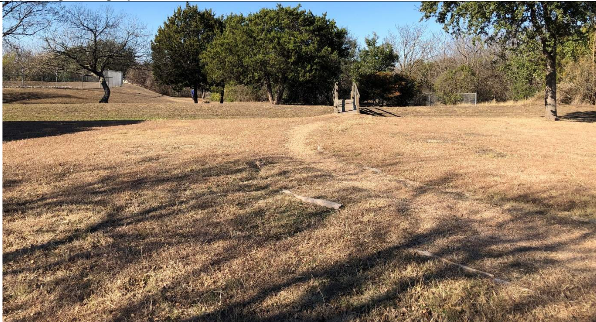
Neighborhood walking path connects Westgate to campus [REDACTED]