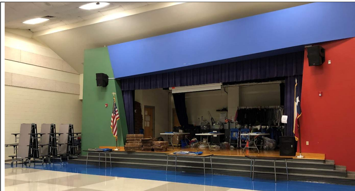
Music and performance spaces are in good condition but currently being used to accommodate additional storage during COVID-19 protocols. Capacity to assemble all students at once is a concern for staff.