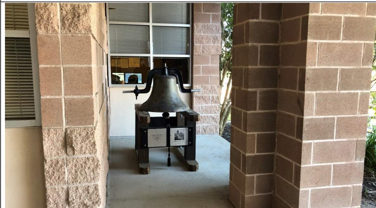
Historical relics are on display where visitors and students can view them.