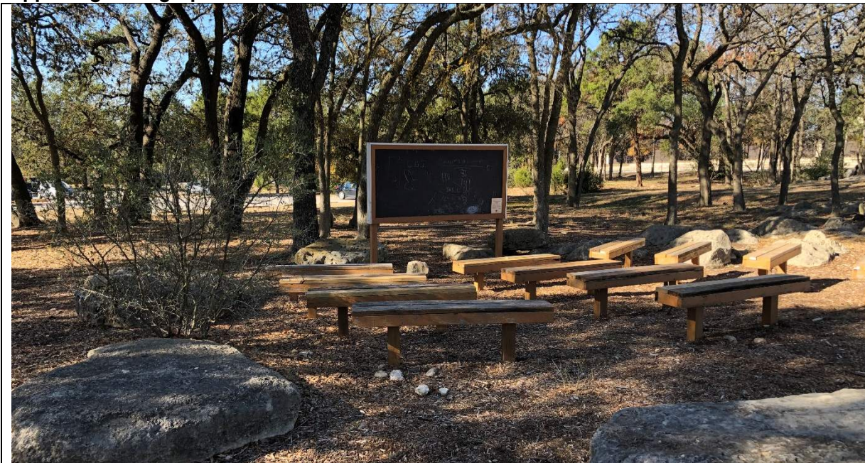
Outdoor learning space has bench seating and chalkboard display. Shade provided only from trees.