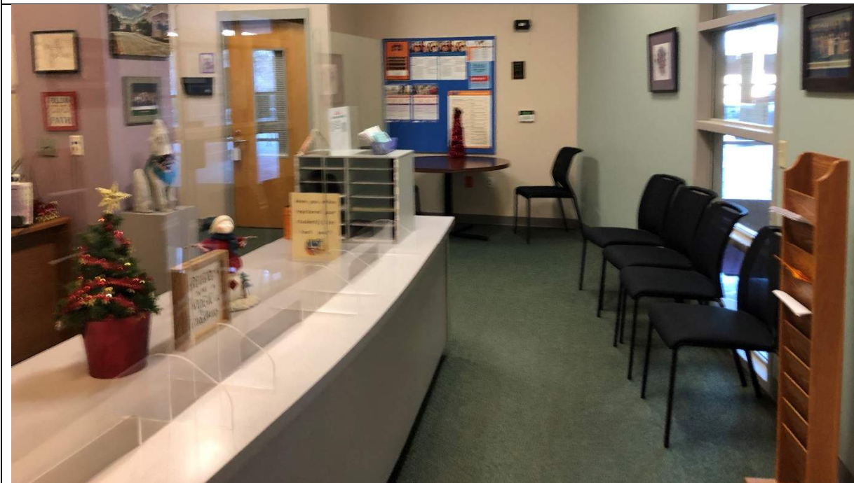
Administration space is small with limited seating.