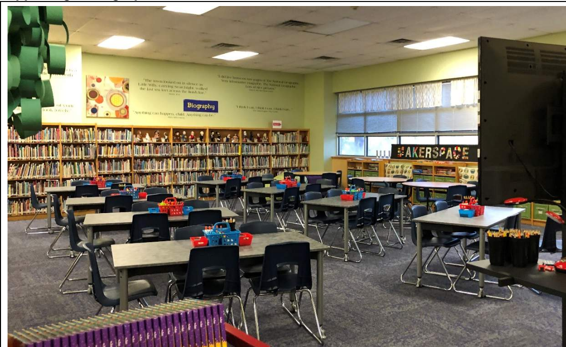
Media Center: There are reconfigurable tables and chairs for various group sizes.