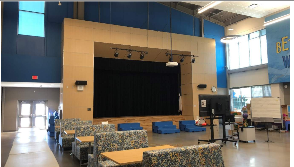
Cafetorium has movable partition between gym and cafeteria. All program elements are appropriately sized per Ed Spec. Stage A/V is new and satisfactory.