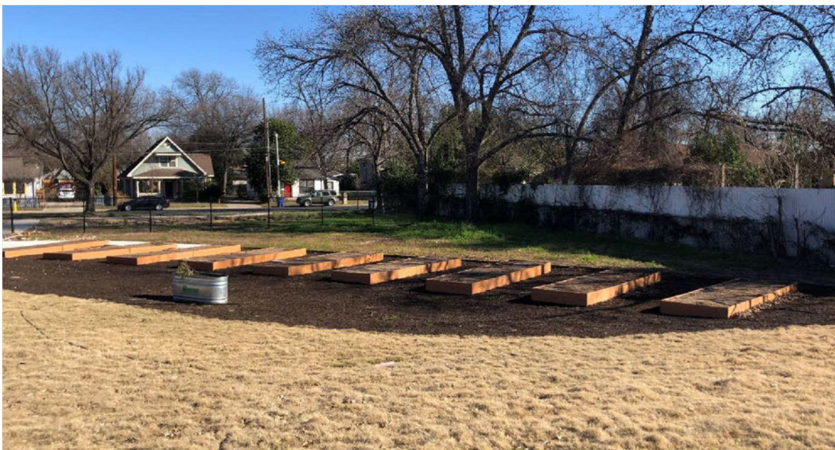
Outdoor gardens with an additional outdoor classroom space adjacent. This space is far removed from studios.