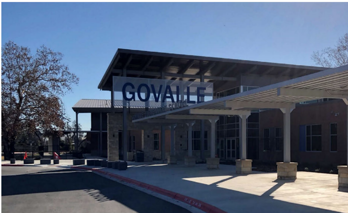
Entry has generous overhang and lower canopy for weather protection at pickup and drop-off.