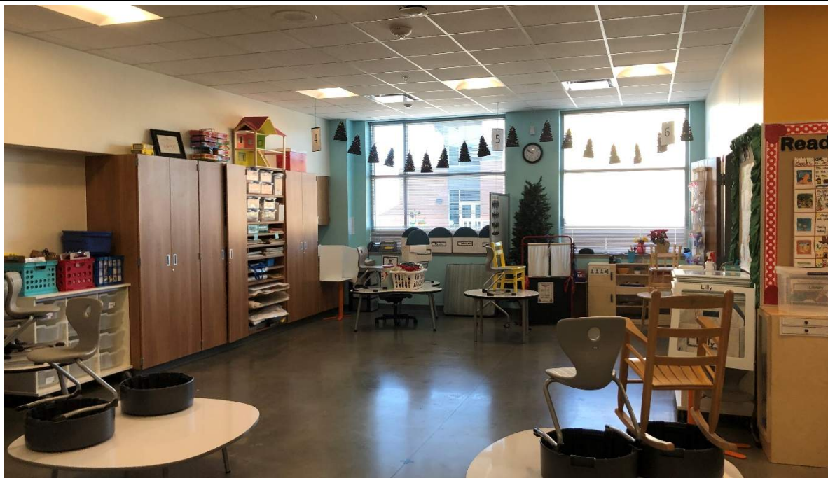
Typical studio has flexible furniture, casework storage and excellent daylight/views.