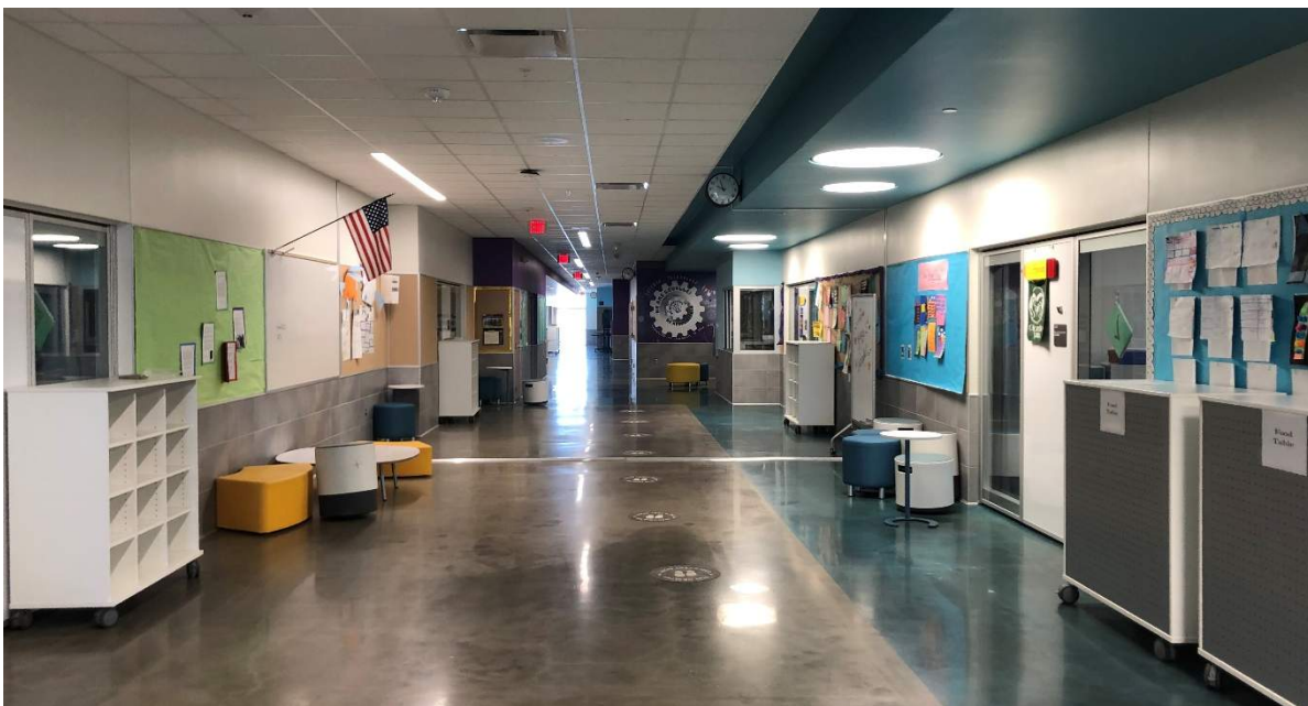
Hallway in learning neighborhoods is wide enough with flexible furniture to allow small groups to meet. Glass in the studios to the hallway allows for passive supervision of students.