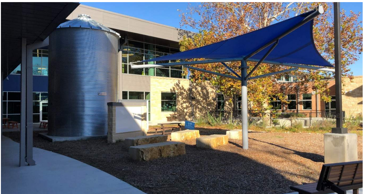
Outdoor teaching space adjacent to collaboration space has some shade and a whiteboard.