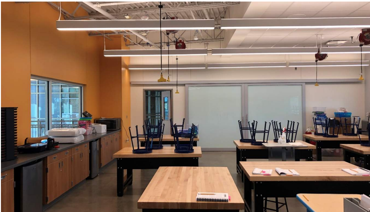
Maker space on second floor provides power for a variety of activities. Large sliding doors open the room to a large commons area.