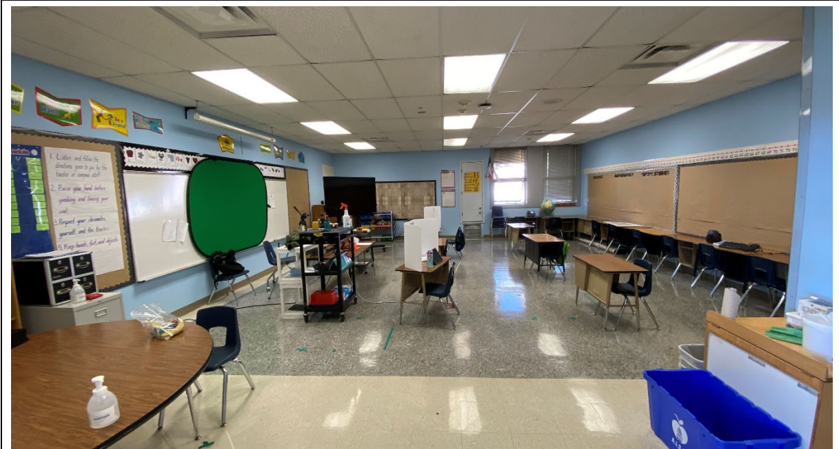
Studios in the newer annex buildings are larger than original building, and all have access to natural light. There is limited storage available.