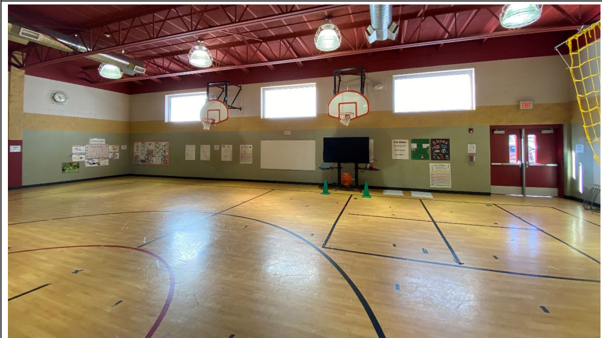
Gym has updated flooring and access to natural light. No projector screen, but there is a portable screen and a projector on a cart.