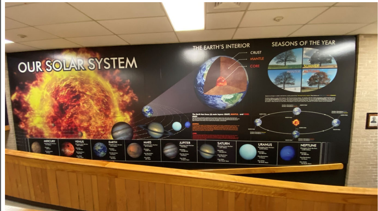
Unique wall graphics are educational and act as wayfinding for the main building.