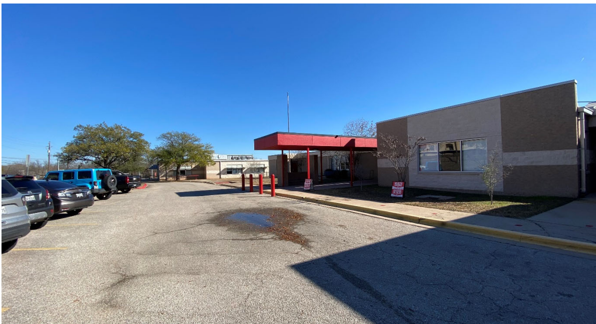
Bus drop-off at main entry has a proper overhang for waiting students. School exterior is in good condition, but appearance is aged by weather-faded colors.