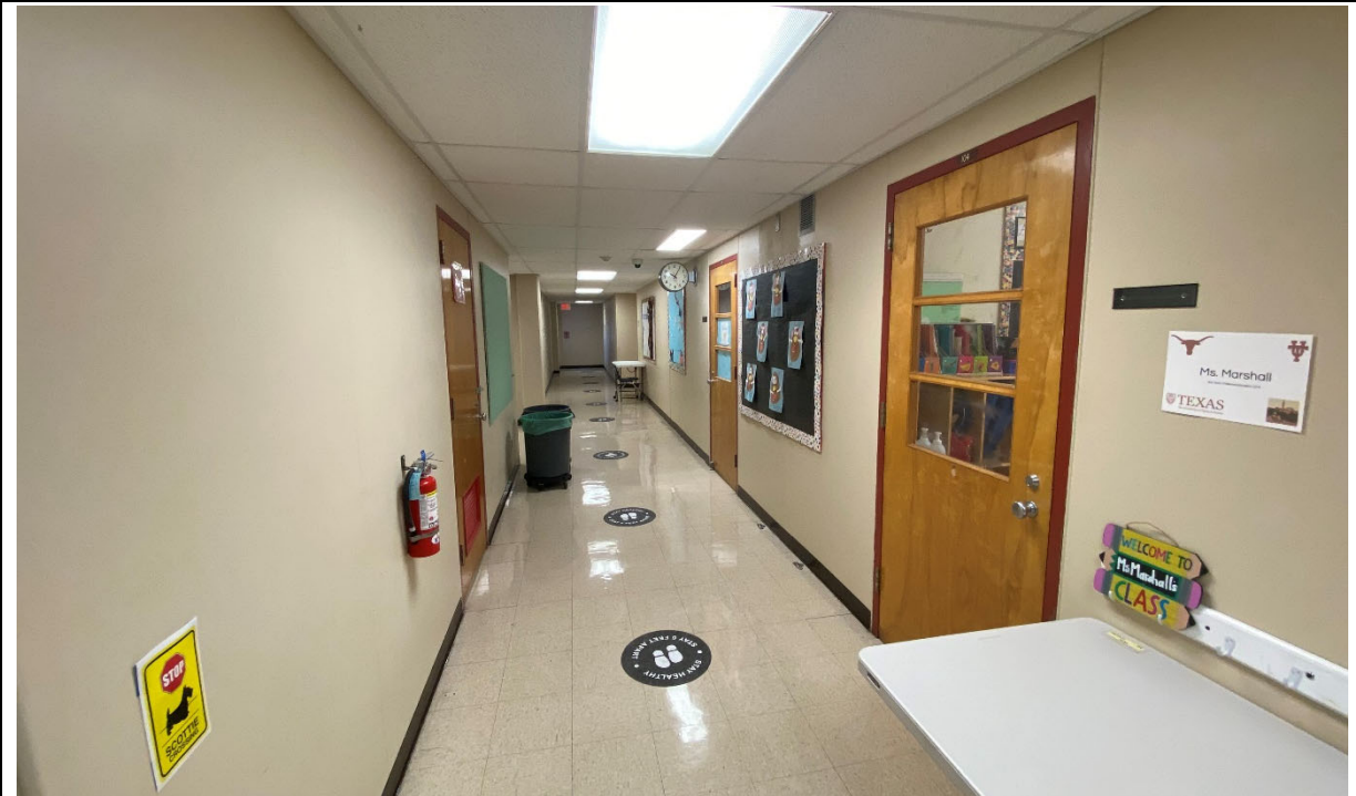
Original building corridors are small and lack natural daylight. Transparency between studios and corridors is inadequate.