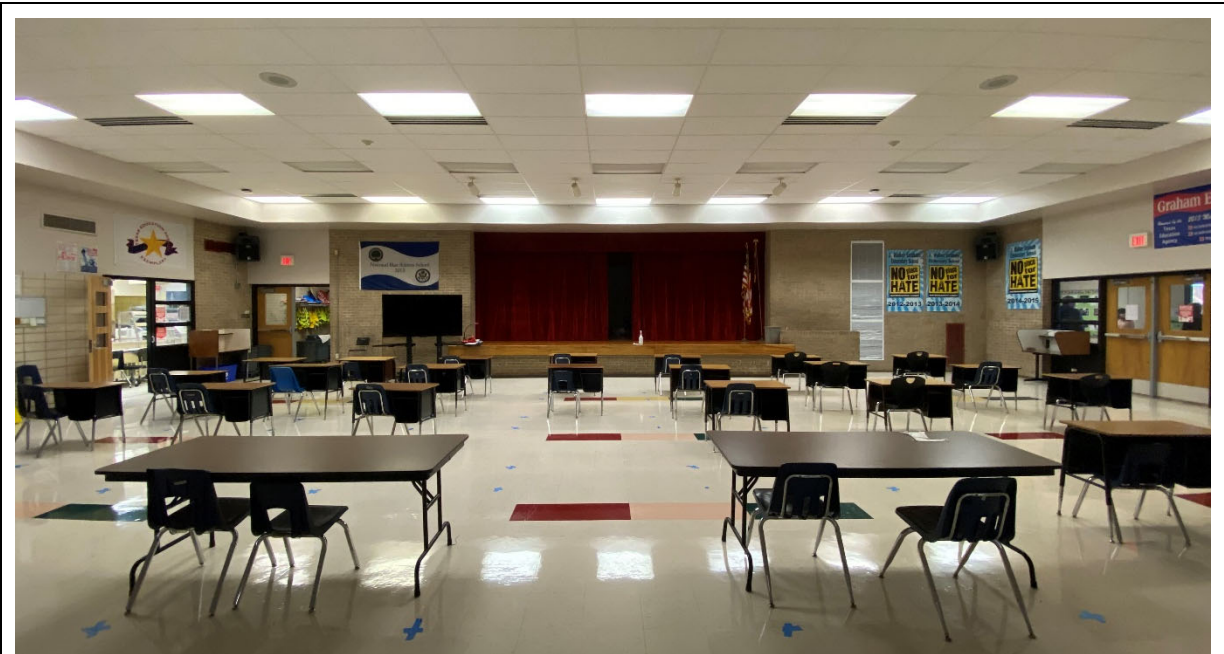
Cafeteria lacks natural lighting and access to outdoor seating. Dining commons and stage size is adequate, but the stage lacks storage. (Due to COVID restrictions, the cafeteria is not in its typical arrangement in this photo.)