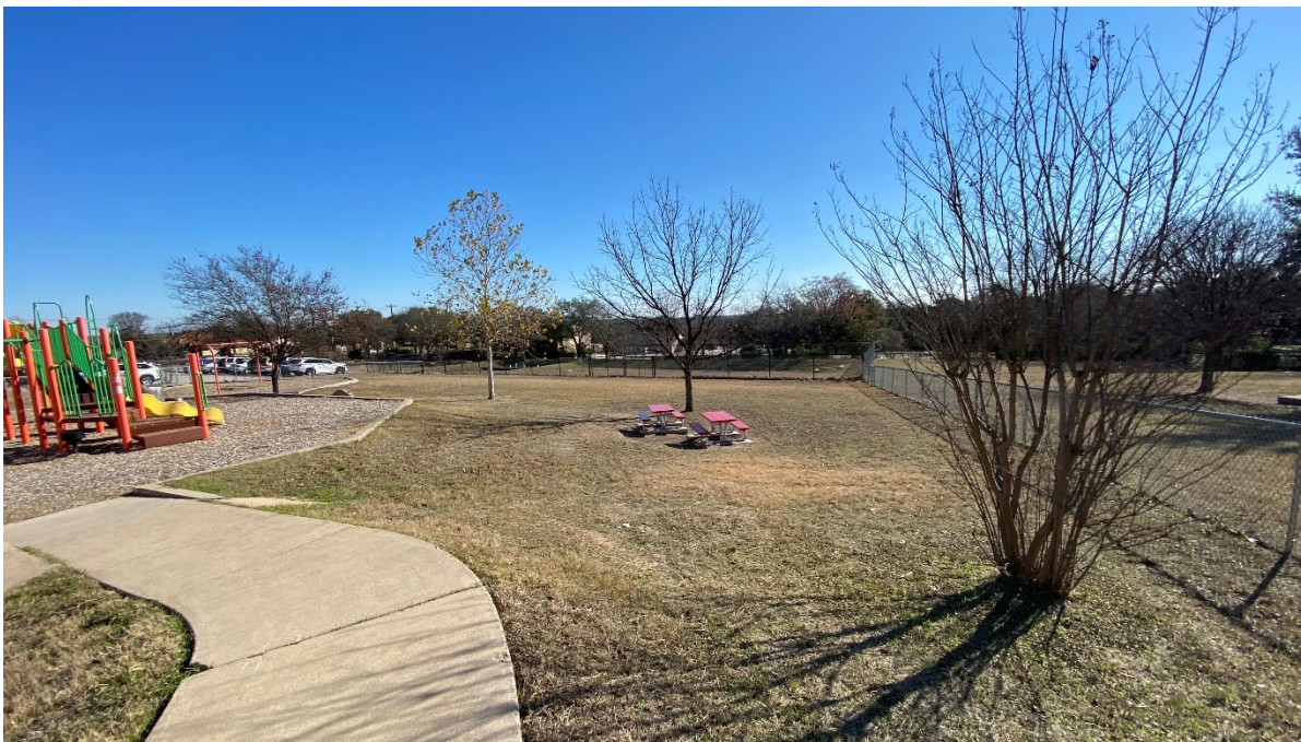
Playscapes are in good condition but not shaded. There are a few picnic tables, but they are not dedicated outdoor learning studios.