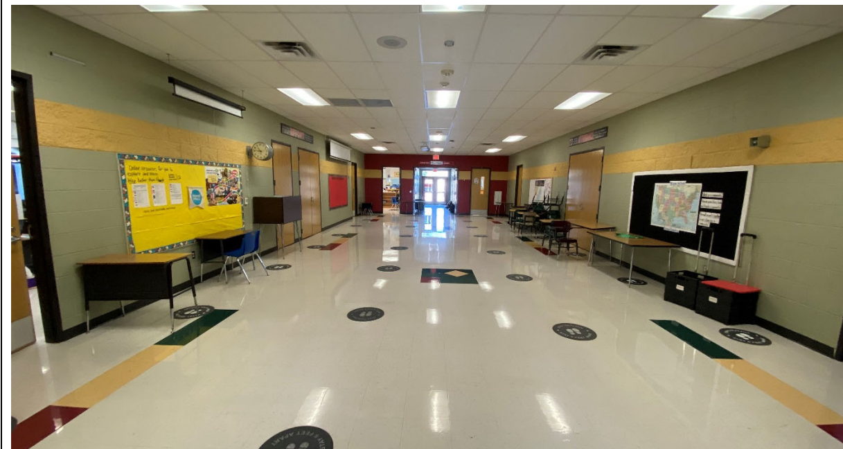
The newest annex building has a central collaboration space for the surrounding studios. This space also functions as the main circulation for the building. There is limited transparency into the studios.