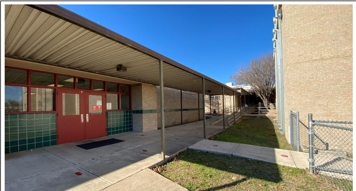
Exterior covered path to annex studio buildings.