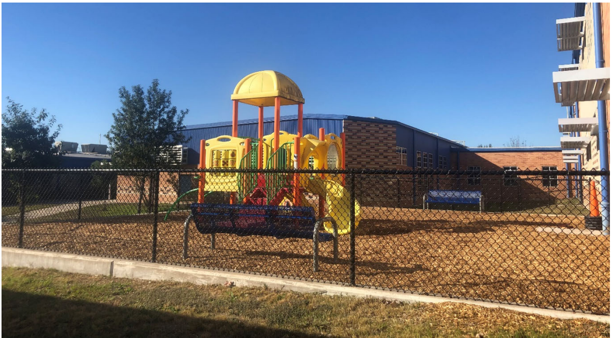
Outdoor Learning and Activity: Both playgrounds on campus do not have shade. This smaller structure is well-connected to the studio wings for lower grade level students.