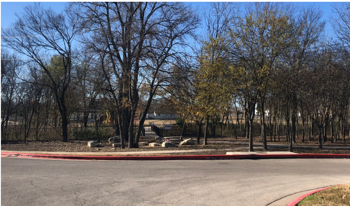
The grass play field, walking loop and larger playground are disconnected from the main campus.