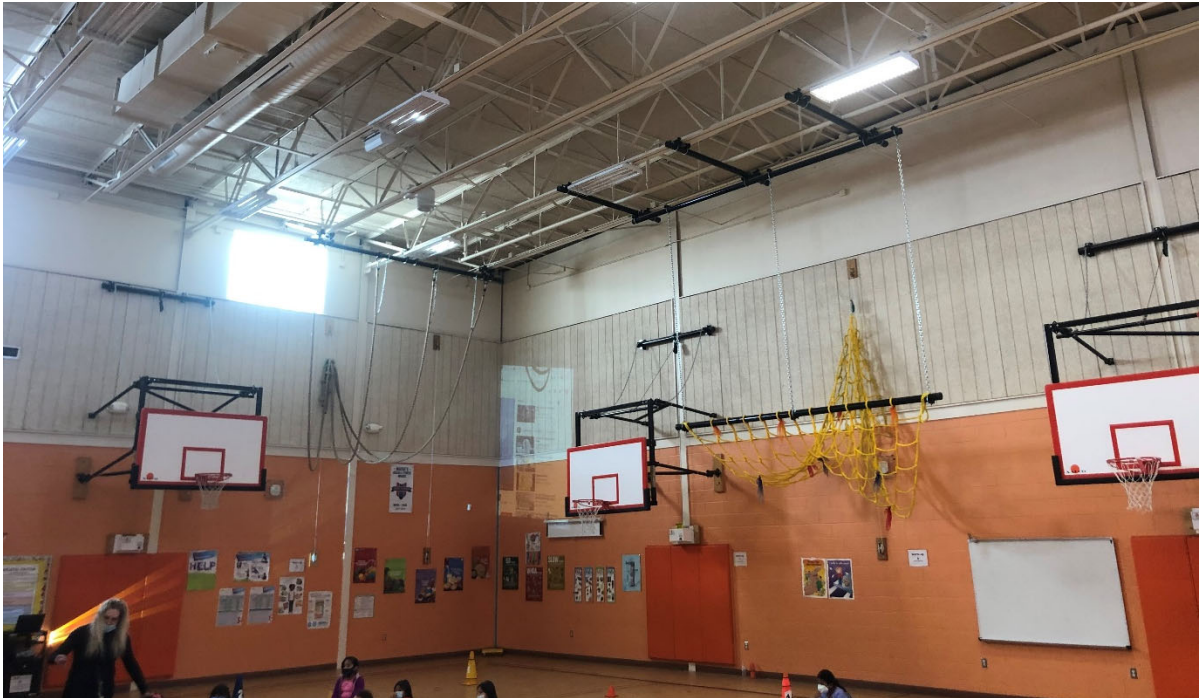
PE and Wellness: The gym is adequately sized with appropriate storage. The projection screen is undersized for the space but is supplemented by whiteboards.