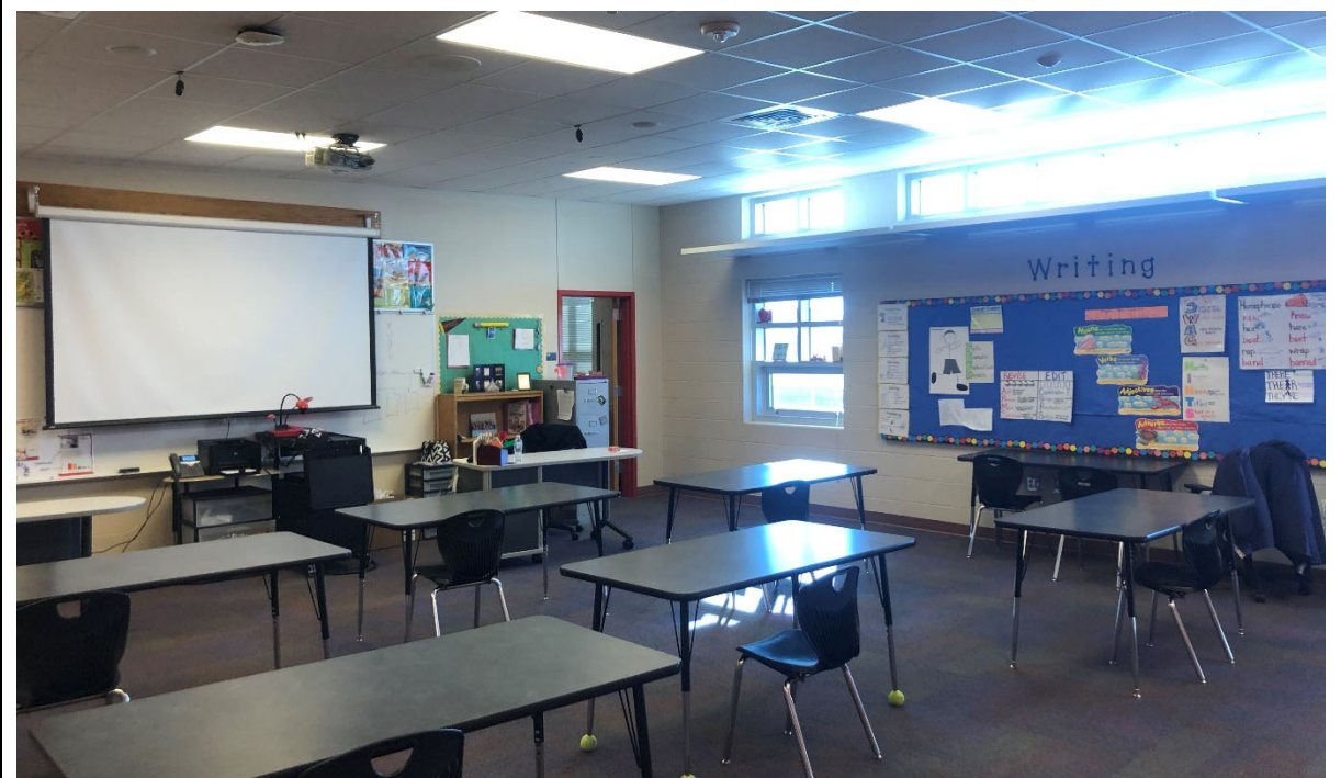
Academics and Learning: All studios have ample access to natural light and views. Furniture is a mix of old and new. More mobile pieces would allow for greater flexibility.