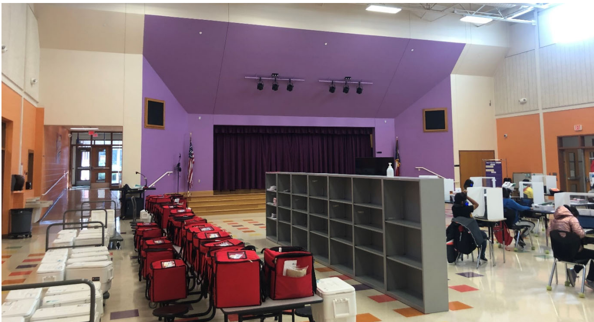
Food Services: The cafeteria is adequately sized (currently set up for COVID-19 protocols) with appropriate support spaces and is connected to the gym with an operable wall.