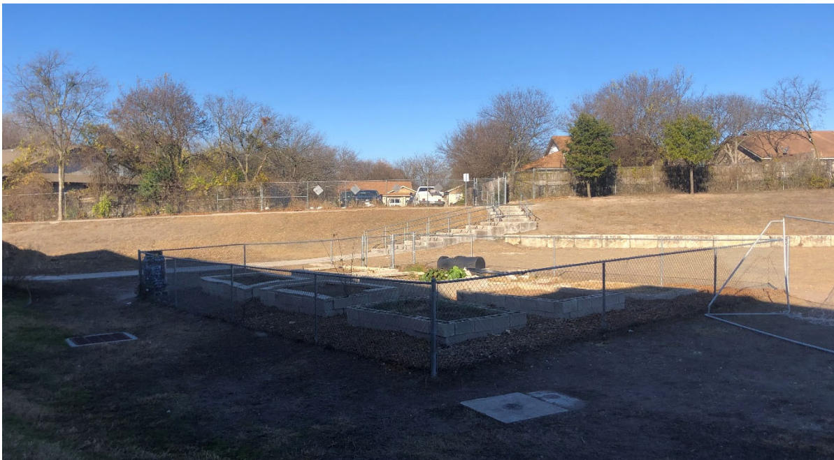
Gardens are undersized for the campus and disconnected from teaching spaces.