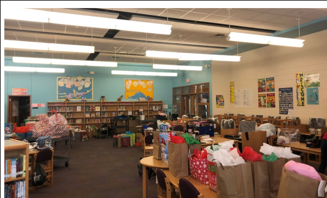
Media Resources: The library is generously sized and centrally located on the campus. Furniture is old and cumbersome to move, but there is plenty of space to accommodate larger groups. Currently the library is not being utilized due to COVID-19 protocols.