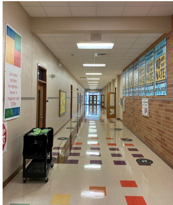
General Building: Most corridors are approximately 12 feet on average.