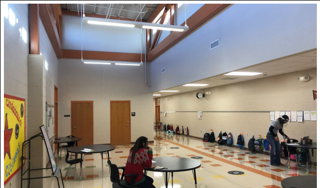
Academics and Learning: Two of the studio wings have a shared flex space in the corridor between studios, providing an area for collaboration for varying group sizes.