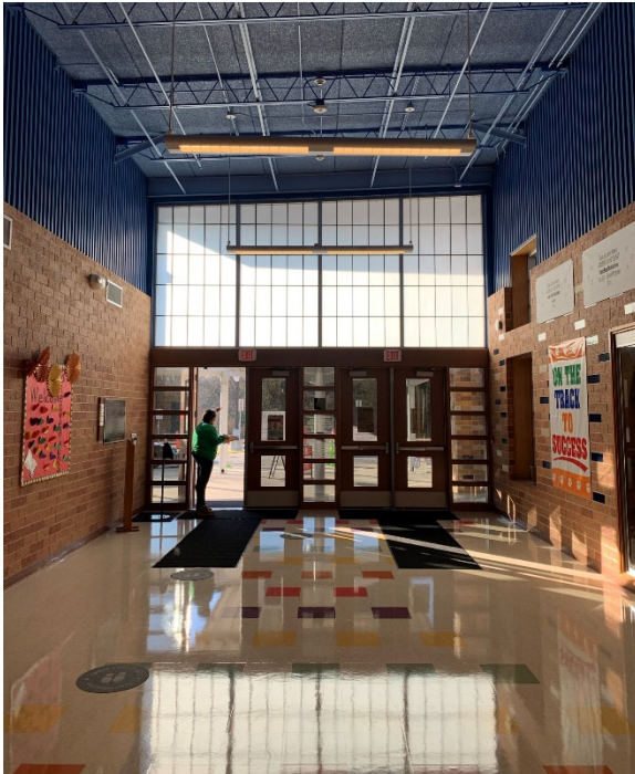
Entry has a secure vestibule and adequate visibility to the reception area.