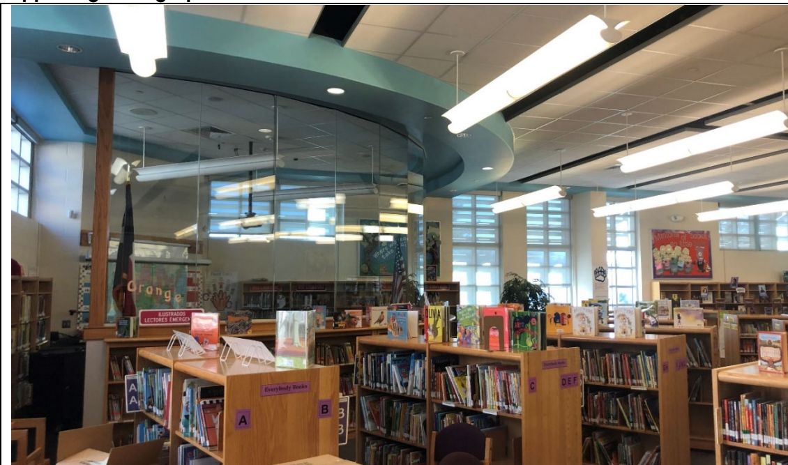
Media Resources: Large windows bring ample natural light into the library and a glass partition at the kiva provides some acoustical control when multiple groups are occupying the space.