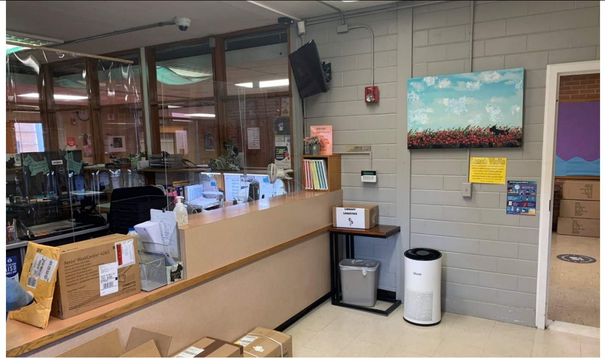
Administration: Reception area acts as a secure vestibule but is small and unwelcoming.