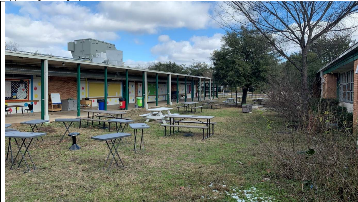
The campus has multiple courtyards for outdoor learning, but they lack shade or protection from weather.