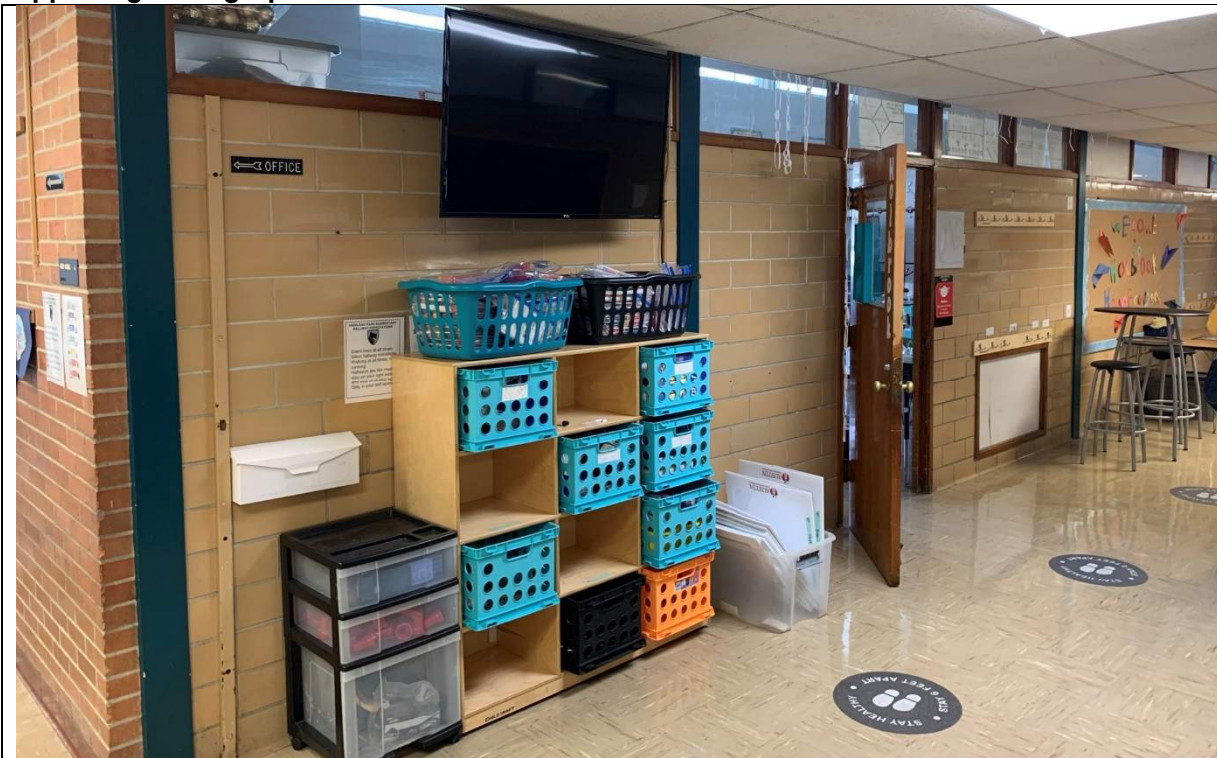
Due to a shortage of storage space, most corridors are lined with cabinets and shelving to accommodate teachers' supplies and equipment.