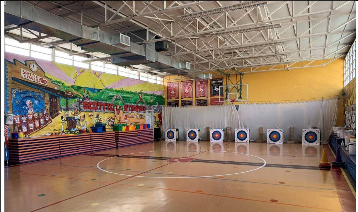
Gym is undersized and lacks storage. Most equipment is stored along the walls.