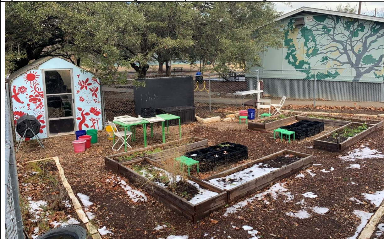
Gardens are located away from other learning courtyards.