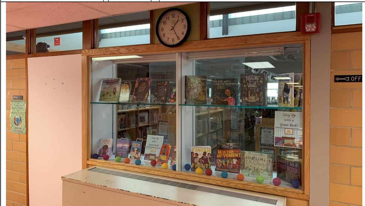
Display of 3D artifacts is very limited. Most corridors have multiple tackboards for 2D display.