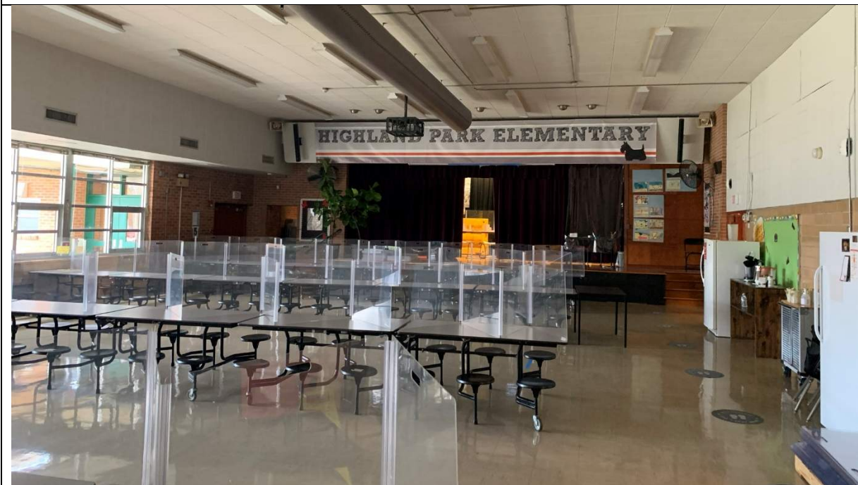
The cafeteria is undersized and unable to accommodate different types of furniture. This space is also used for performances and is unable to house parents and staff during events.