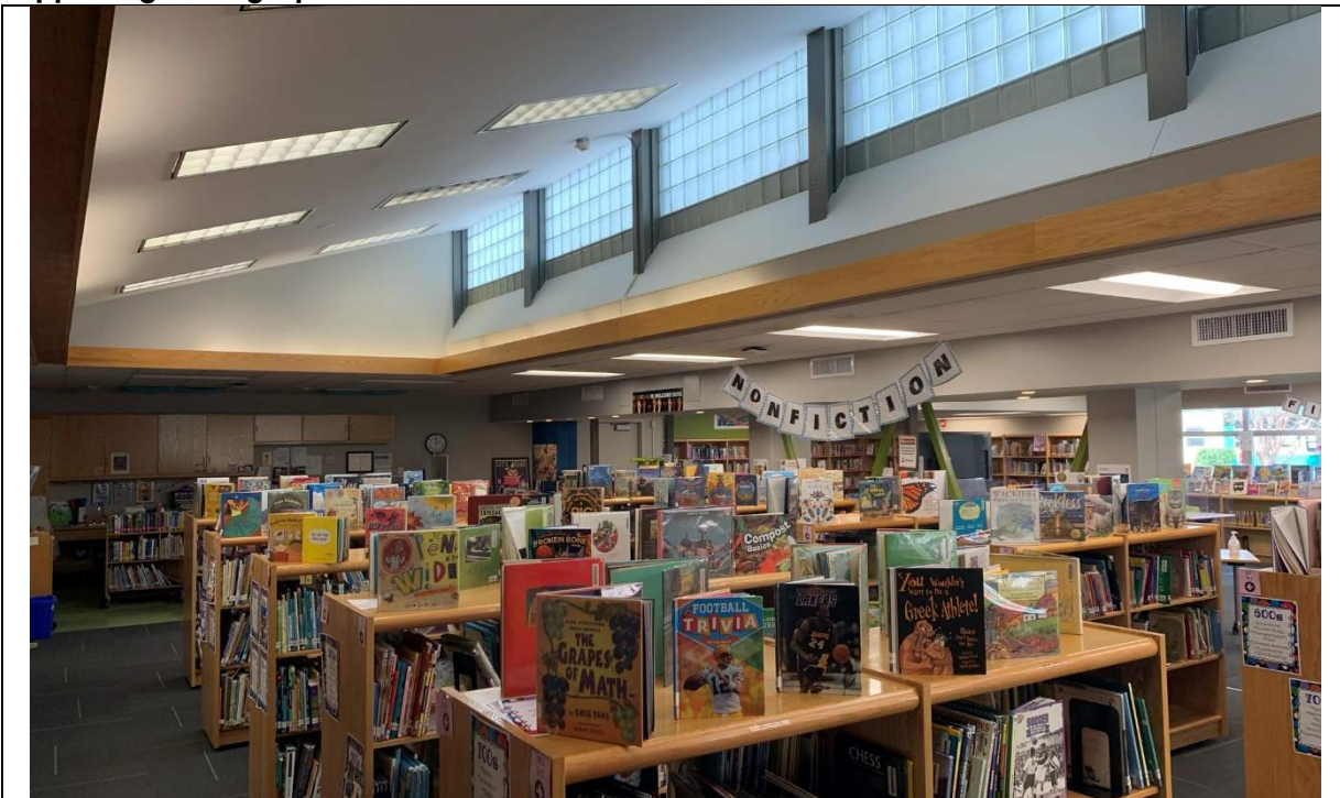
Media Resources: Book stacks occupy much of the library space, limiting the number of students the space can hold at a time.