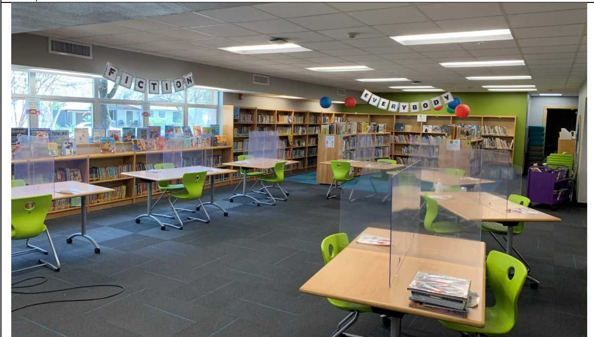
Media Resources: A variety of flexible furniture is provided, but space is limited in terms of separating groups for different zones of activities.