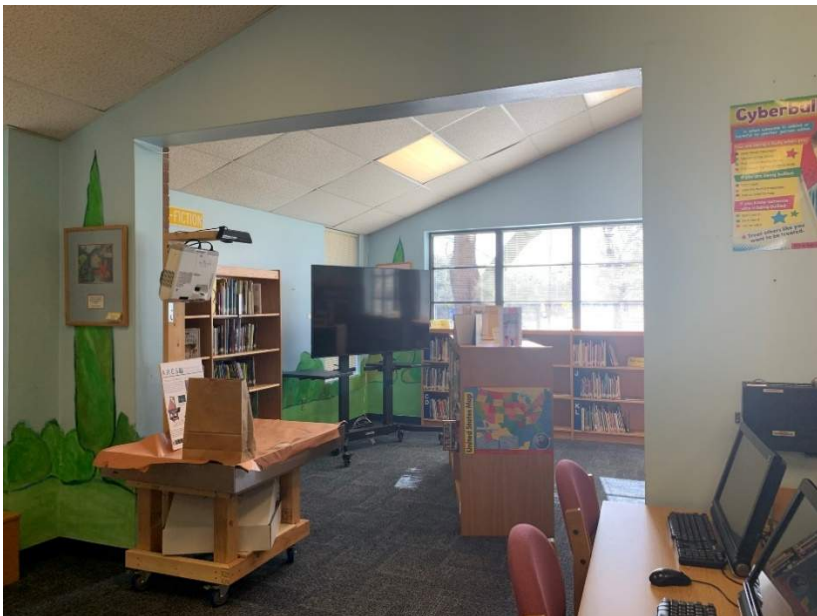
Library can be separately opened for after-hours activities. Library does not support group or individualized study/reading. Most furniture is not easily movable. Technology is adequate.