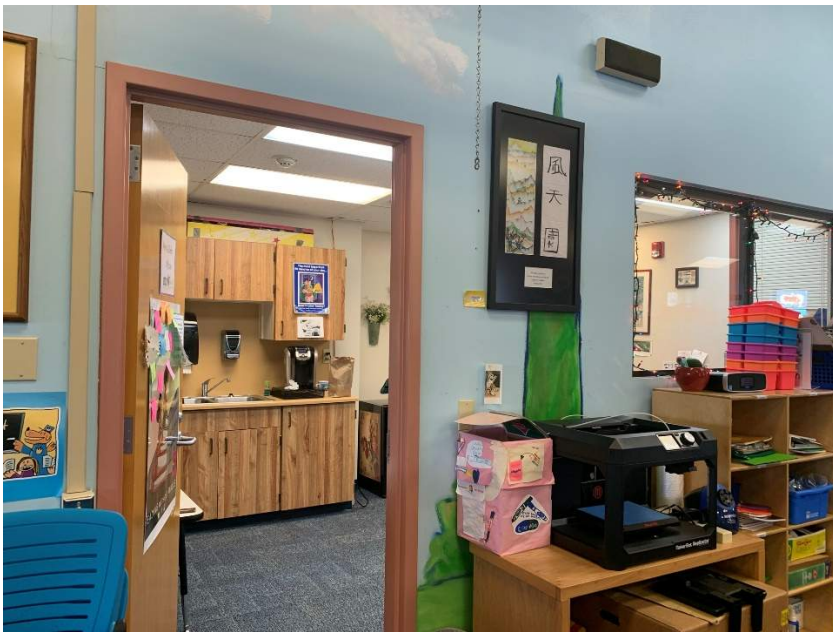
Library has adequate storage and workroom is provided.