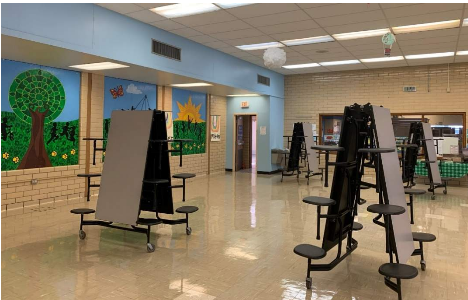
Cafeteria is sized appropriately for student enrollment. Kitchen is very undersized and has only one serving line. Murals throughout the school show school pride.