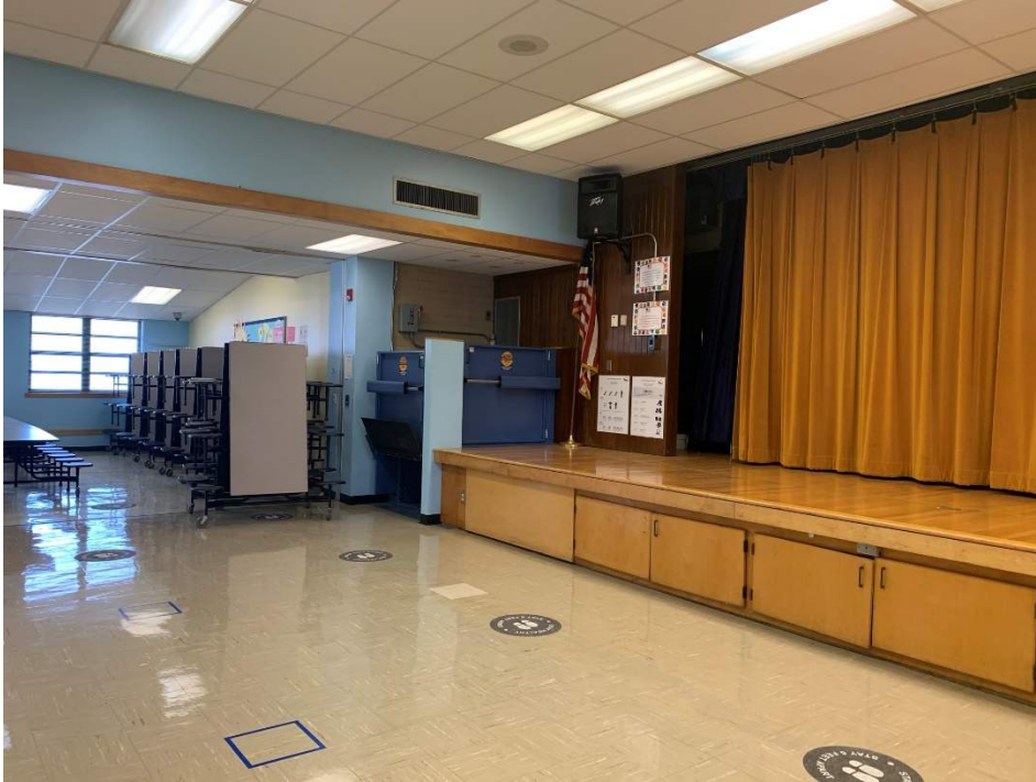
Cafeteria stage is too small and located off to one side of the cafeteria. The current lift works sporadically. After the assessment site visit, there were a series of water leaks from storms that damaged the stage, teacher's lounge, and nurse's office.