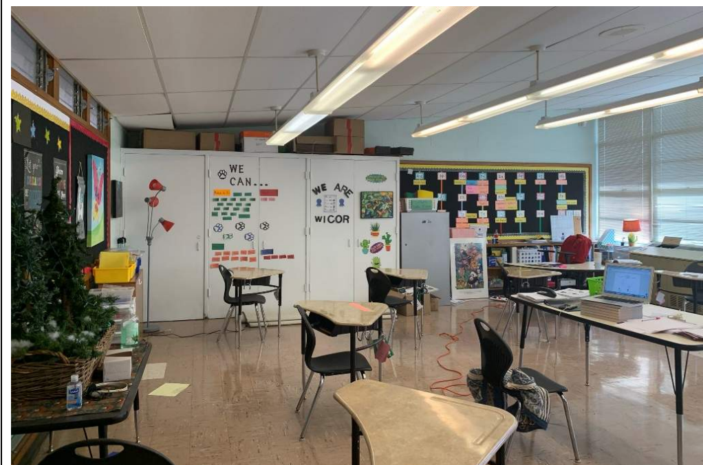
Typical studio has abundant daylight. Storage is not uniform throughout the studios. There is not adequate power in the studios.