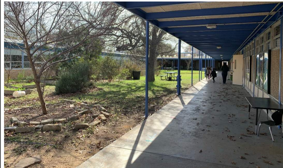
Courtyard is secured within school perimeter but requires upgrades to furniture and landscape to function as an outdoor studio. The plants and landscaping sustained damage from the winter storm (after site visit).