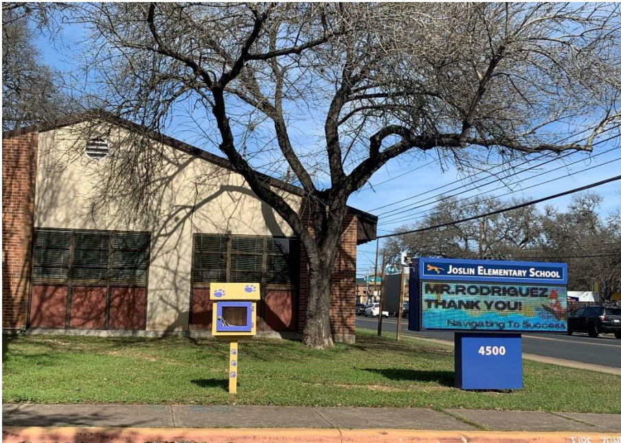
Small digital marquee sign in front of school. Location of staff/visitor parking is not apparent and difficult to access off Menchaca Road. Admin office is located far from main entry gate.