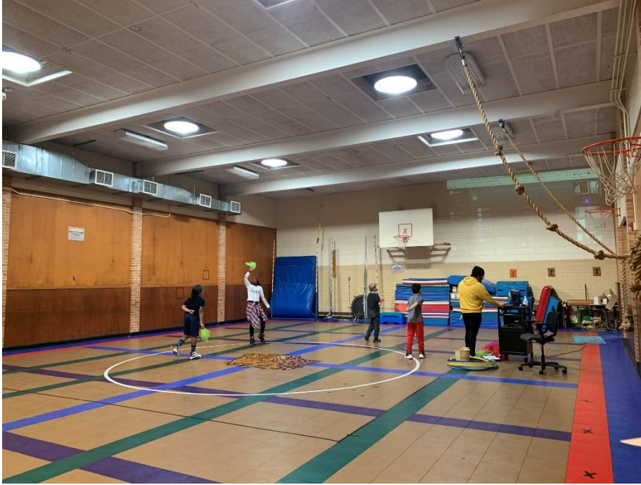
Gym is undersized and finishes need upgrades.