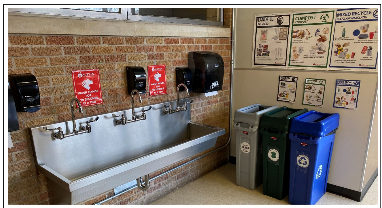
Waste collection is clearly presented and labeled in various areas similar to the one shown.