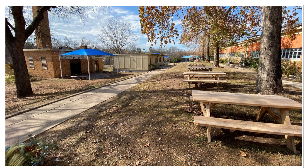
They have converted the old boiler building into the backdrop of the outdoor stage. Outdoor tables and the topography create a lot of seating space.