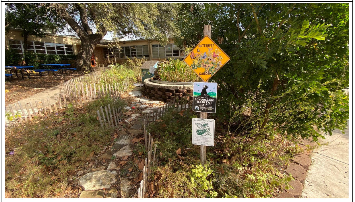
Central outdoor area features a learning pond, butterfly garden and a seating area.