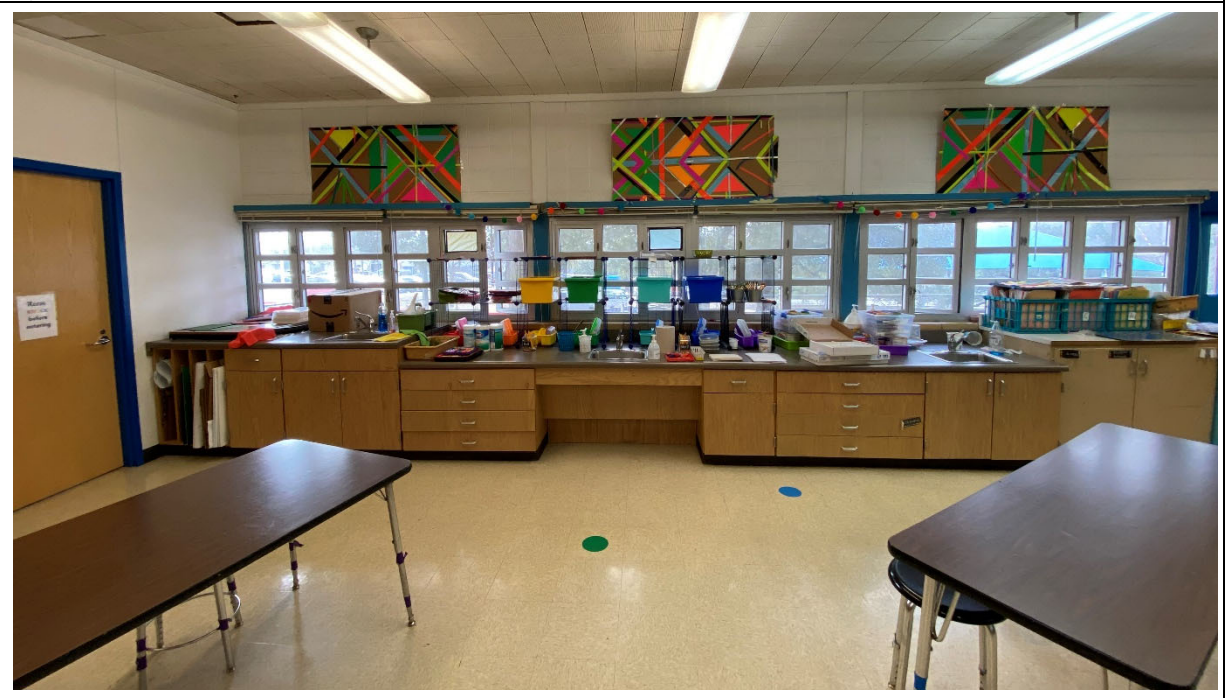
Art studio has plenty of great storage and good natural light. The room appears in newer condition.