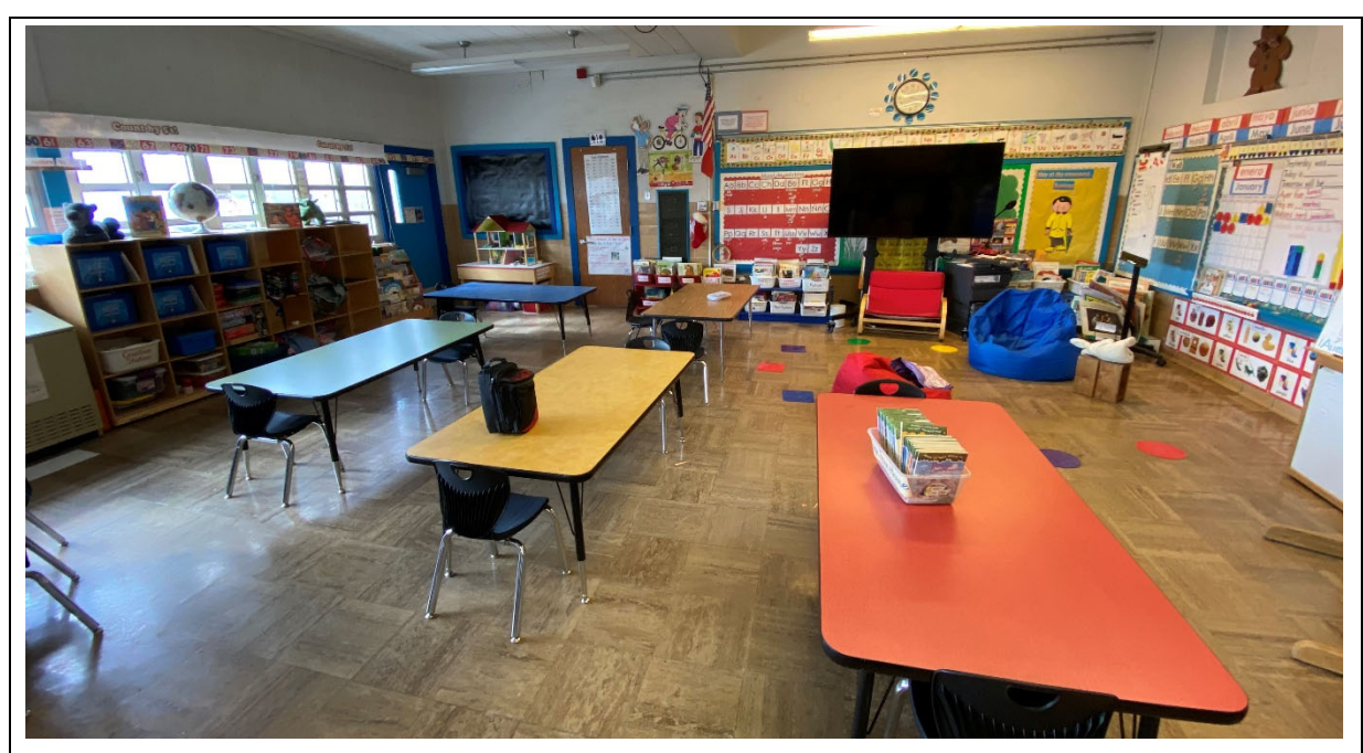
Typical Studio: Space is adequately sized but lacks storage space. Studios receive great natural light.