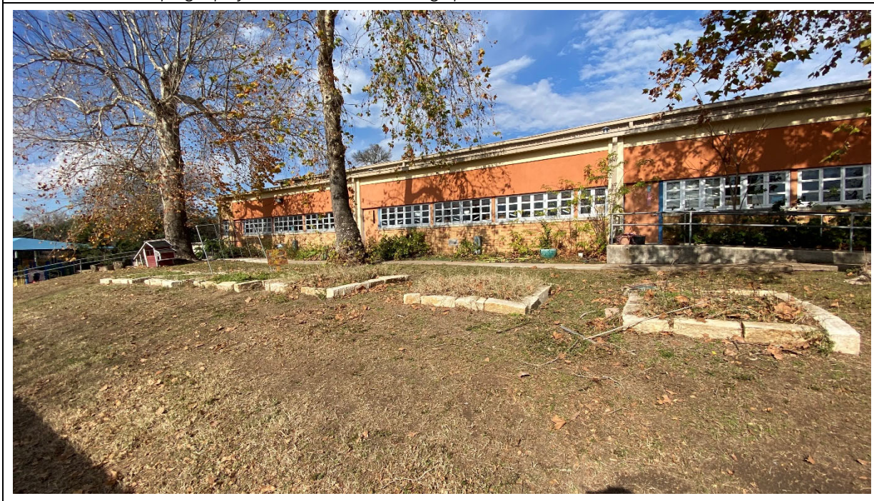
There are many planter beds in similar condition around this central outdoor space. They appear well-used and tended to and are near a water source.