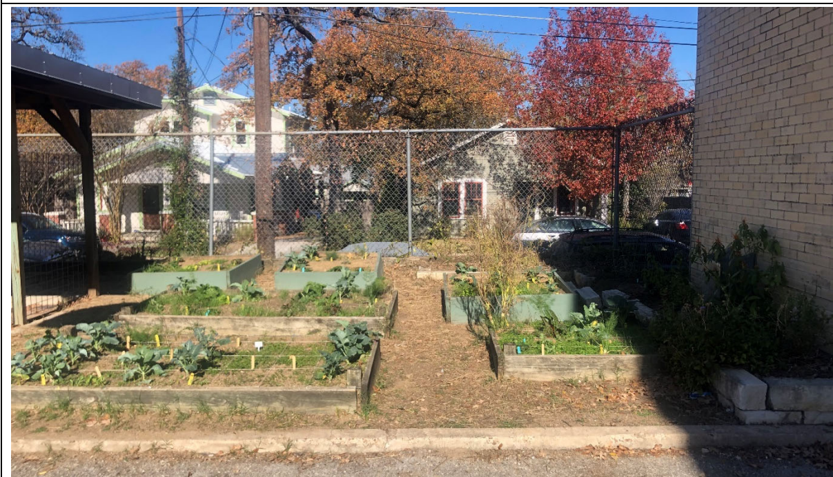
Outdoor edible garden. Series of garden spaces make up the outdoor learning spaces.