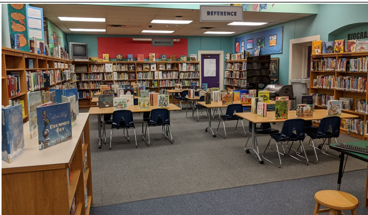
Library/media space. Furniture allows for different size groups.