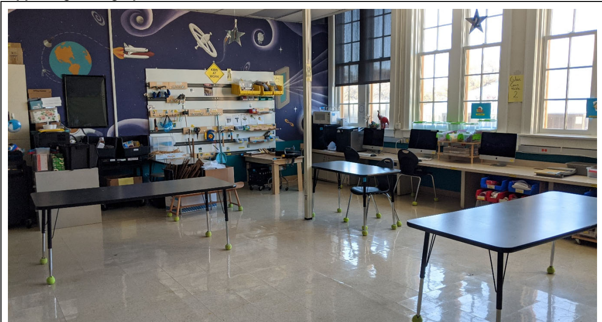
Maker space on the second floor. Ample room and equipment. All studios have abundant daylight and access to views.