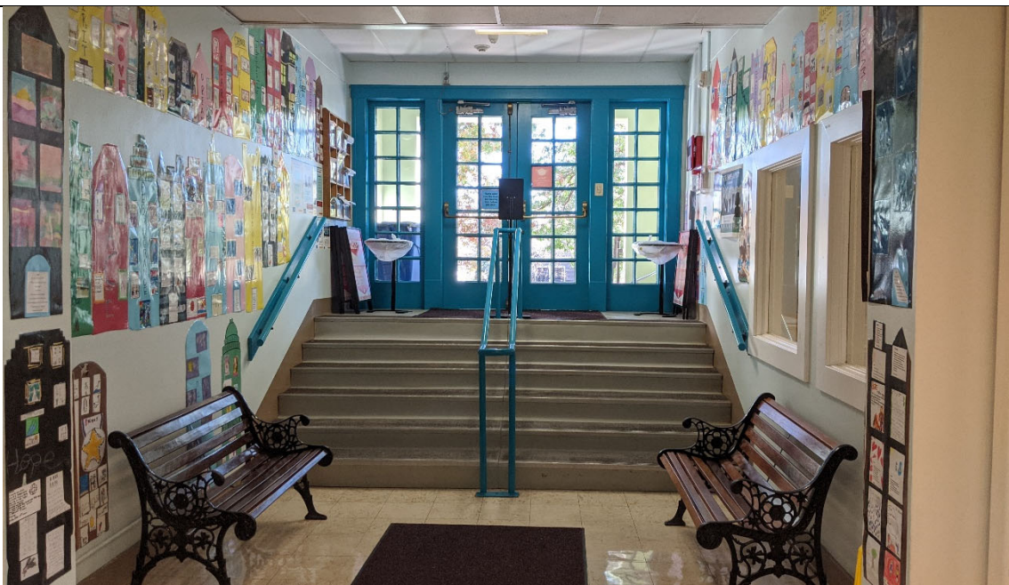
Main entrance into building. Administration space is to the left. No ADA ramp or lift provided.