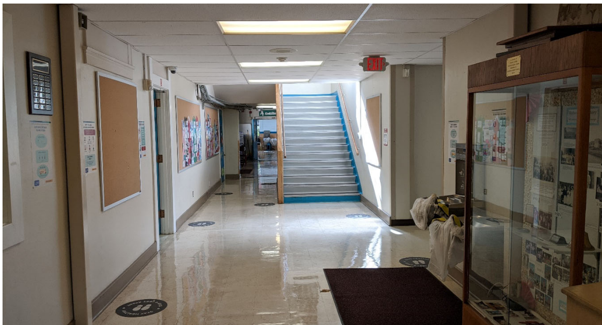
Hallway space and display area.