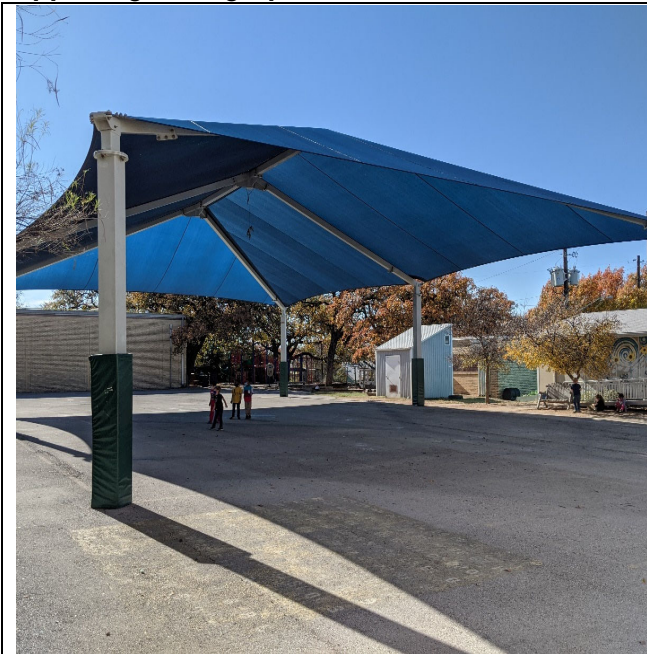
Outdoor playground area. Concrete area takes large portion of playground area.