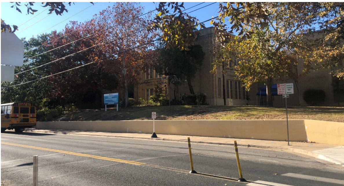
Main entrance. Has dedicated bus lane off West Lynn.