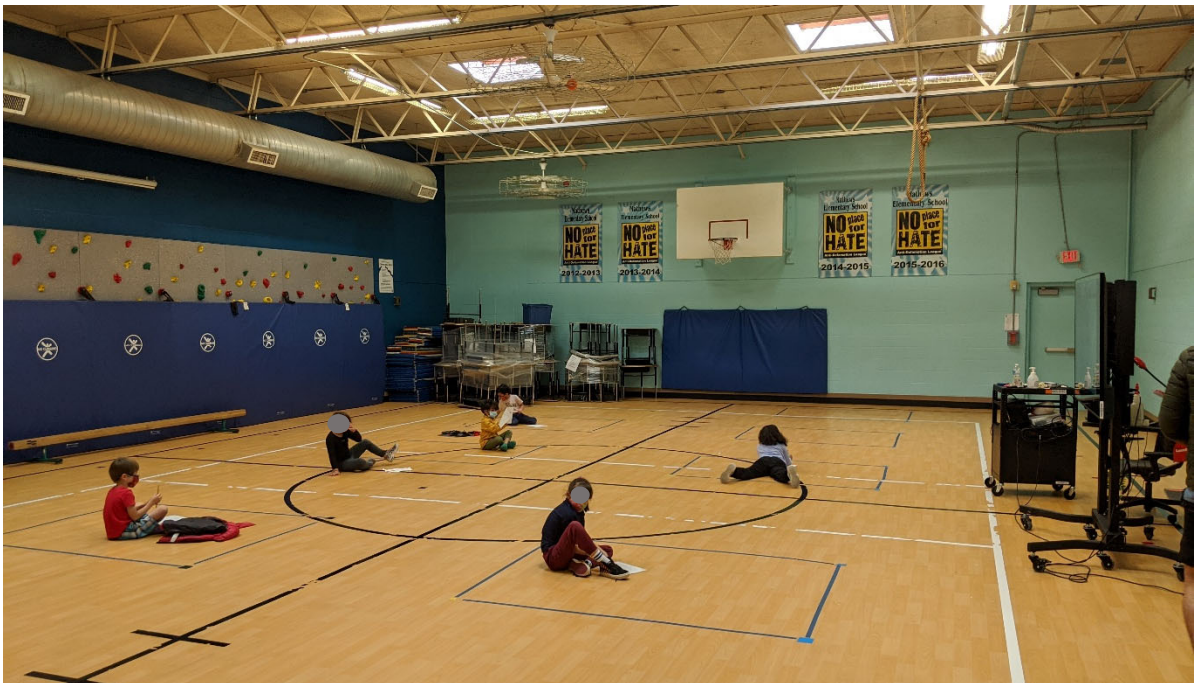
Gymnasium area has limited storage and is undersized.