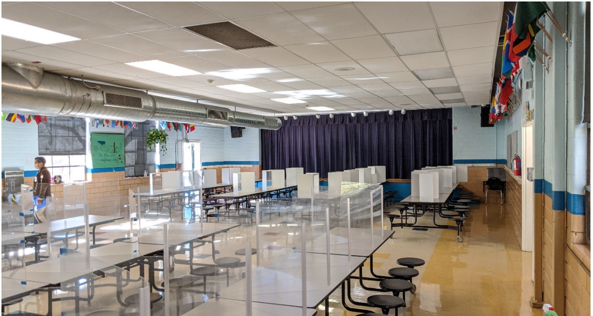
Cafeteria and stage area are undersized and do not meet Ed Spec. Furniture does not allow for flexibility. The stage is not accessible.