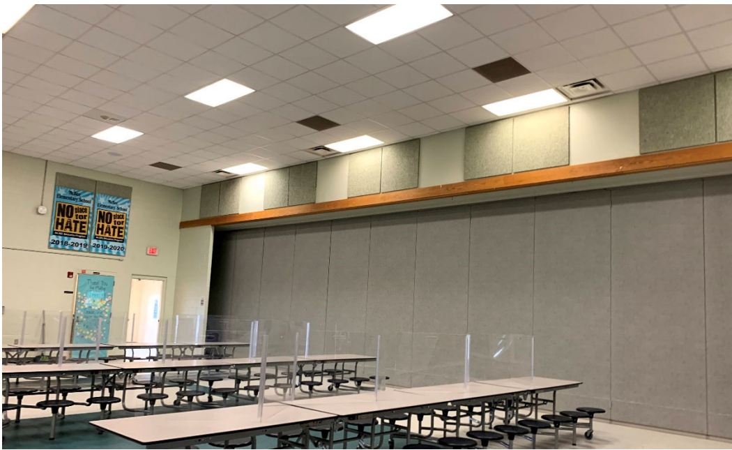
The cafeteria is adequately sized and has a movable partition separating it from the gymnasium. This provides for flexibility but compromises acoustics.