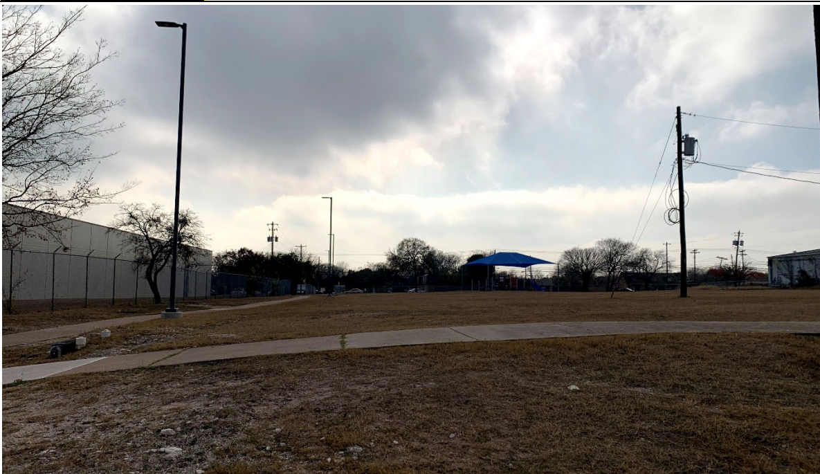
The detached field across the back drive serves as a recreation space.