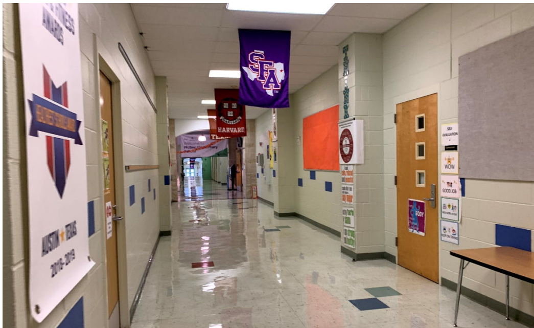
Typical Hallway: The display of art, aspirational college flags and school pride is abundant, although signage and wayfinding could be improved. There is limited visibility from the studios.