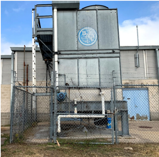
Exterior – South Facade: