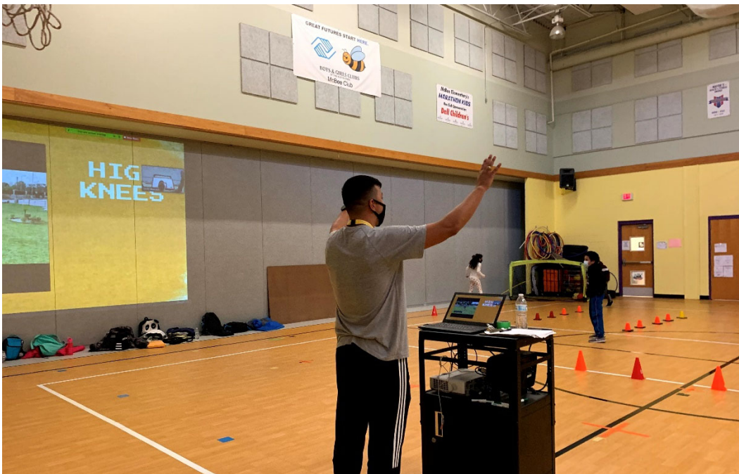
The gym is in great condition and serves its purpose well. It cannot be accessed independently from the exterior for school-related or other events.