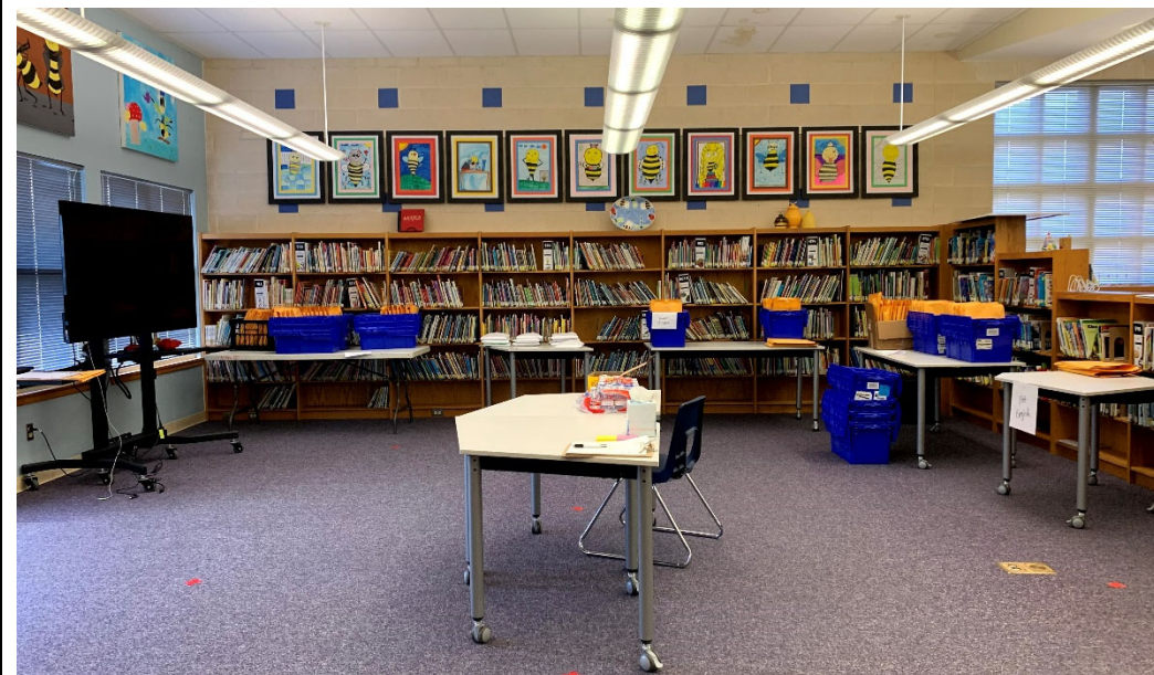
Media Center: There is a good mix of furniture types; however, the chairs are all one size. There could be additional space for accessible seating in the reading area.