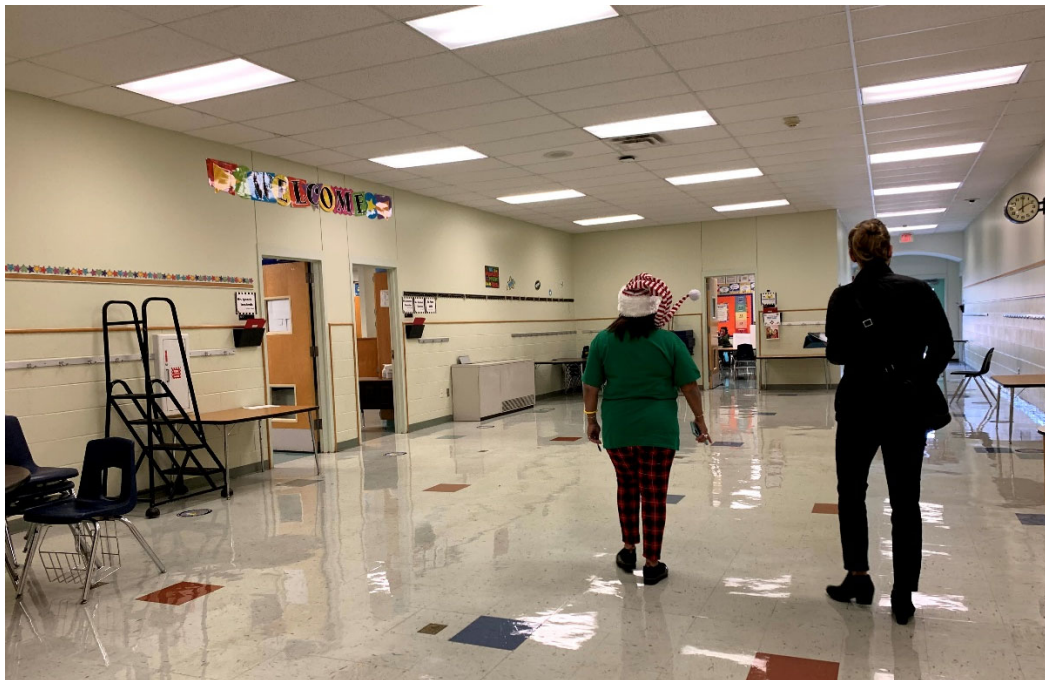
Collaboration Space: One of two in the school, this space is used every day by students and extracurricular groups. The school could use more spaces like this.