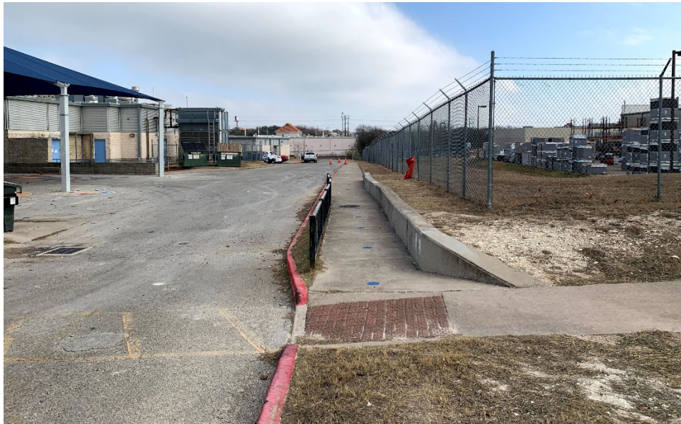
South Driveway: The school must use the south driveway for drop-off and pickup since the main drive is located off Braker Lane. It works, but it is not ideal.