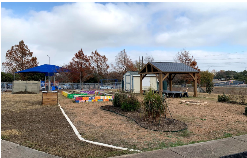
The school built its own outdoor learning space/shelter and maintains the gardens. They take great pride in this area.