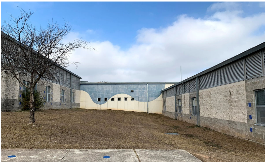
Exterior – South Façade: The studio wings create an exterior area that is not utilized currently for outdoor learning.