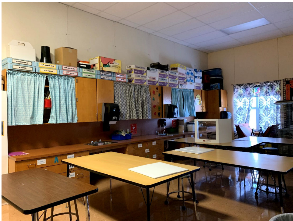
Art Studio: Storage is dated but adequate. Sinks are provided.