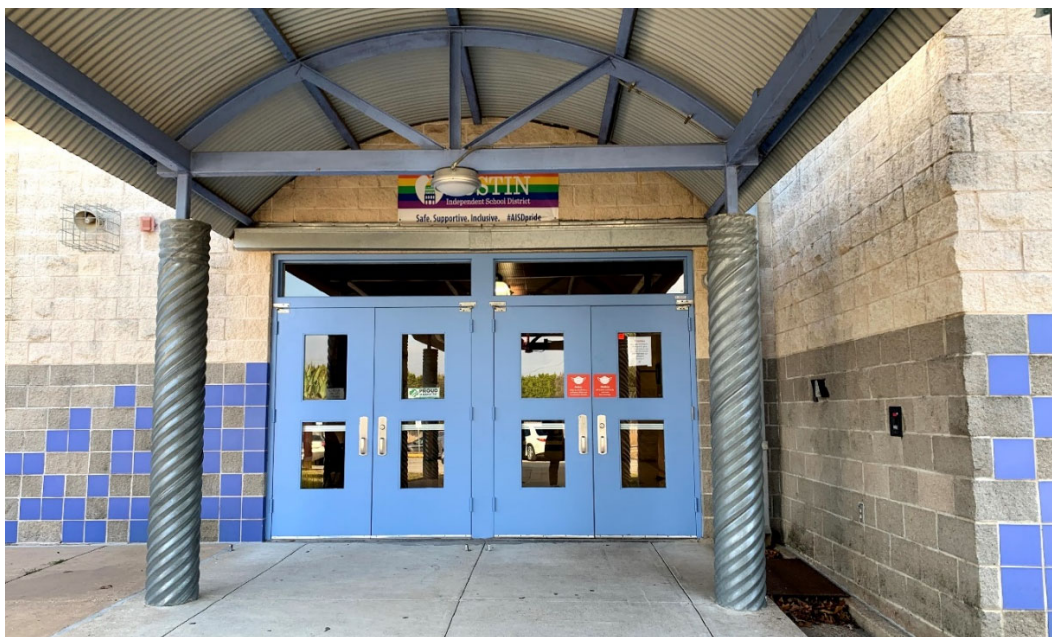
Main entrance covered by canopy from driveway.