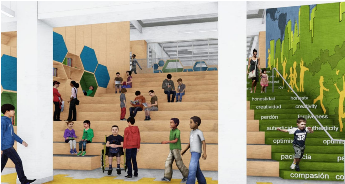
Learning stairs for large group learning. The cafeteria has a retractable partition that can open to this staircase. At the top of the stairs is the library.