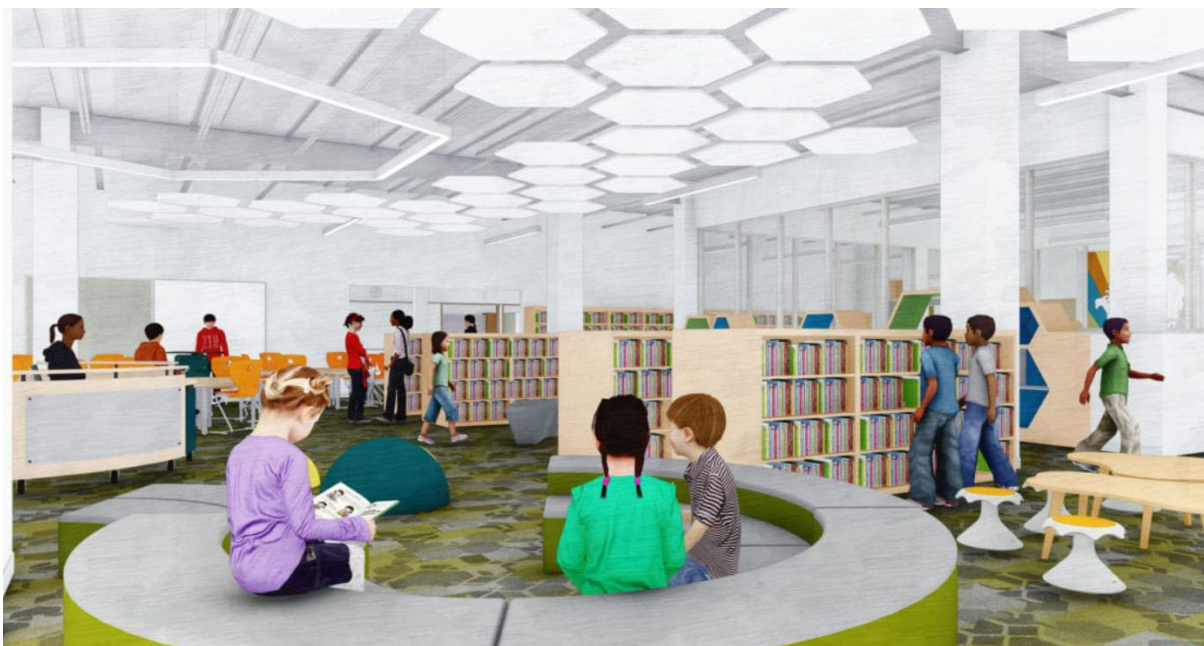
Media Center will have a variety of seating options.