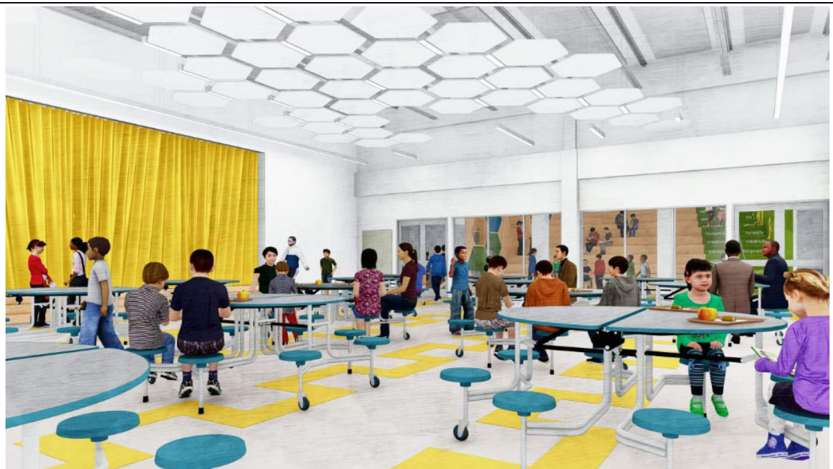
Dining Commons: Flexible furniture and transparency to learning stairs beyond.