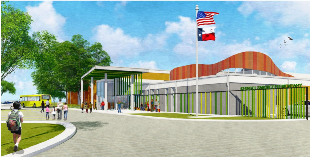
New entry with additional glass and openness provided on the exterior walls. A canopy is provided at both east and west entries.