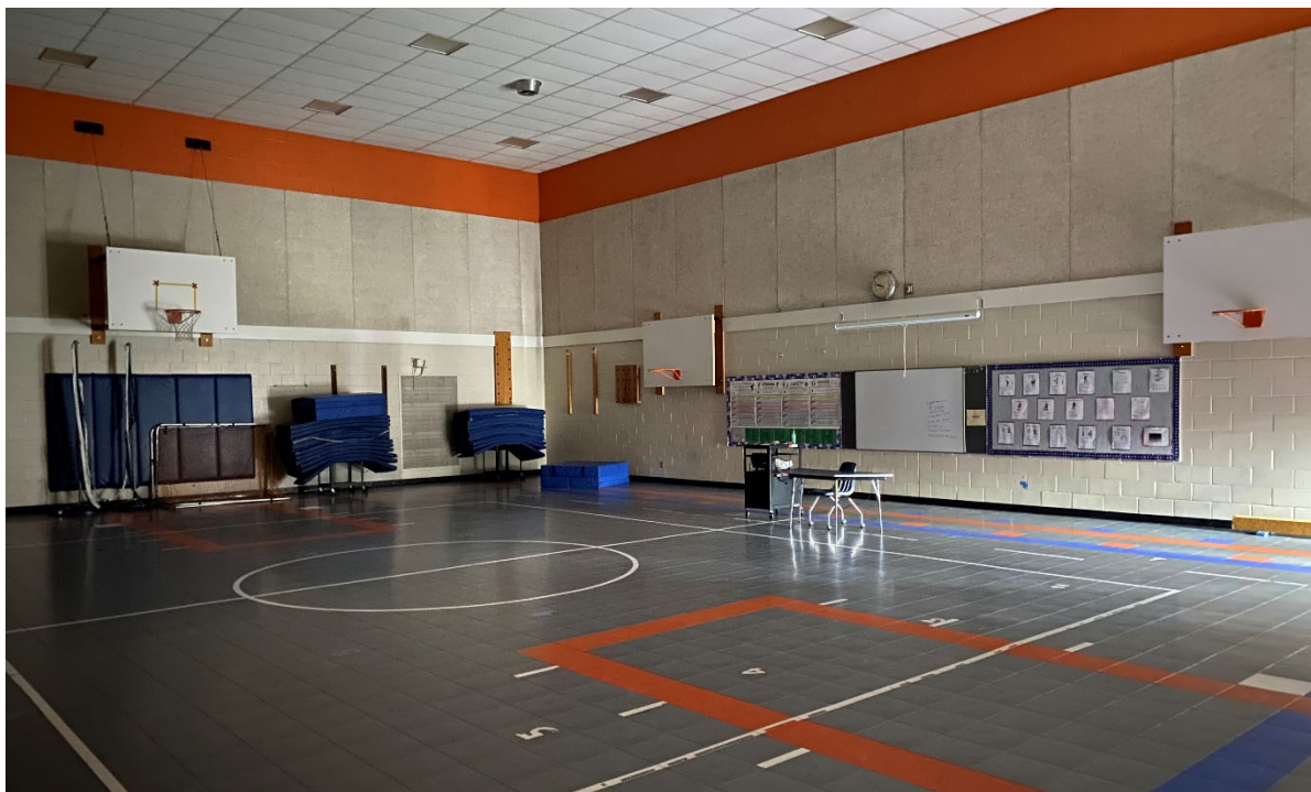
The gym is appropriately sized and equipped with a projection screen, as well as other teaching instruments such as markerboards and tackboards.