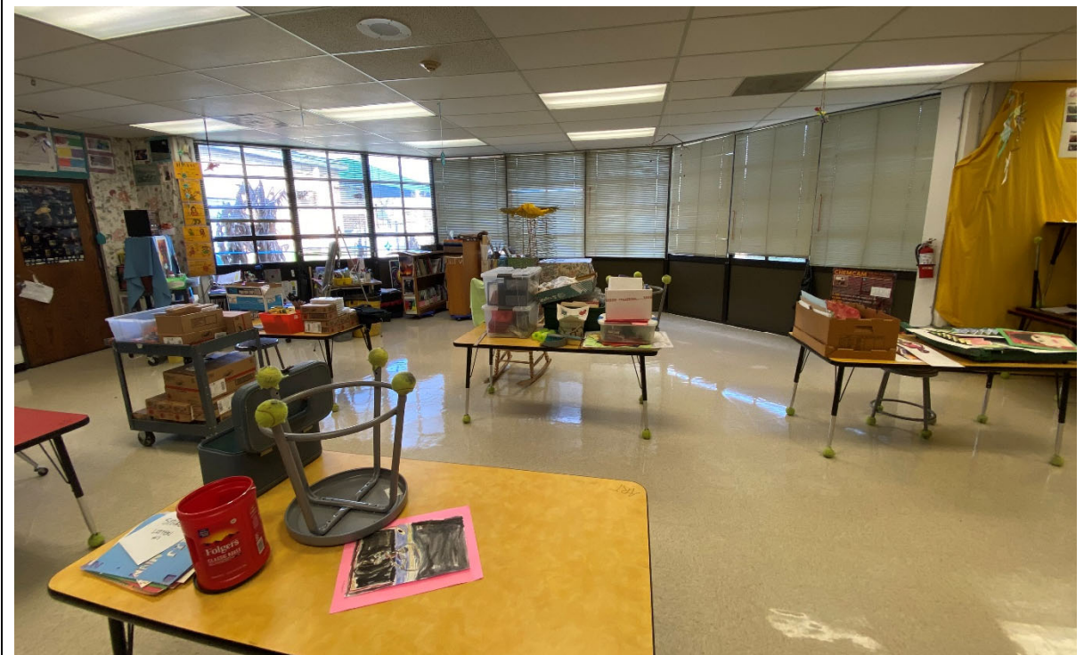
Large art studio has adequate storage closet space as well as a kiln and three sinks.