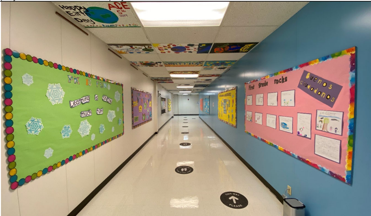
Corridors are an adequate width, and there are many opportunities to display student work on walls throughout the campus.