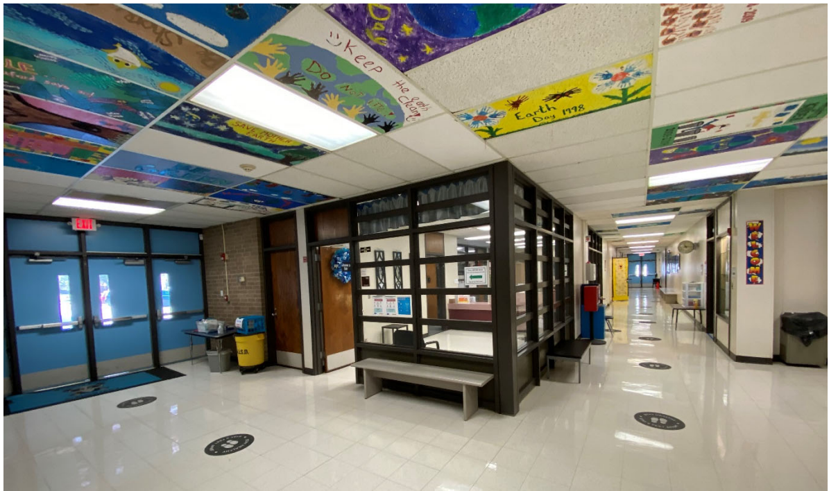
The main entry is bright and colorful with painted ceiling tiles.