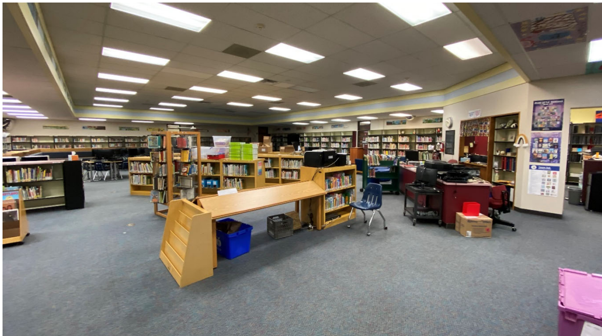
Media Resources: The library is generously sized but lacks flexible furniture and book stacks for easy reconfiguration.