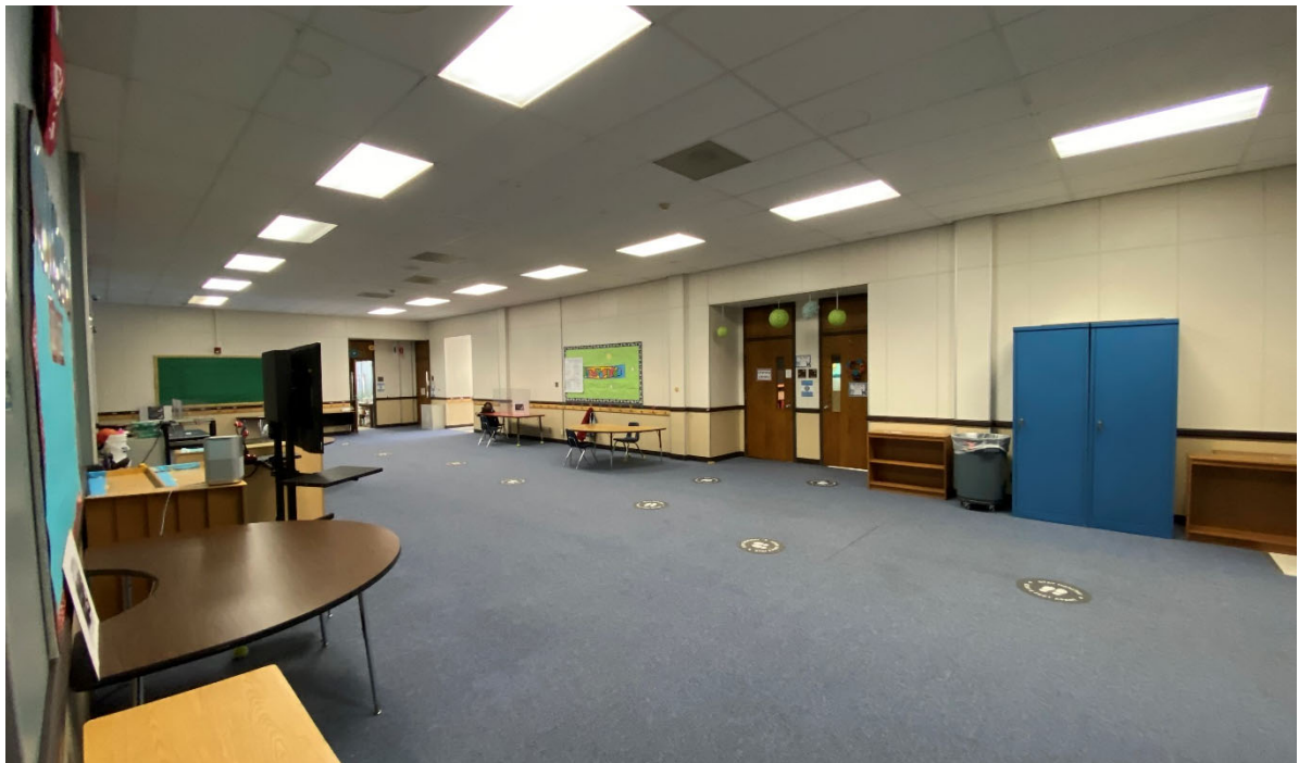
The studio wings of the original building have a large, shared flex space in the corridor for each grade level to gather.