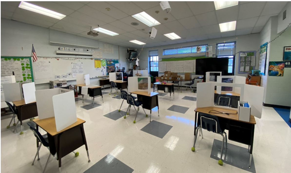
All studios have windows with access to natural light and views of nature and are equipped with projection and mobile TV displays.