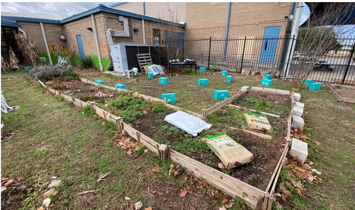
Outdoor Learning and Activity: A large, fenced garden area has stools for outdoor learning and close access to water.