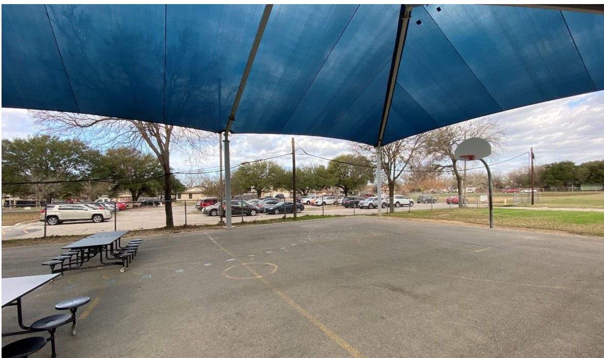
Outdoor Learning and Activity: Large outdoor courts with a canopy cover are located directly off the gym with easy access to other outdoor activity areas.