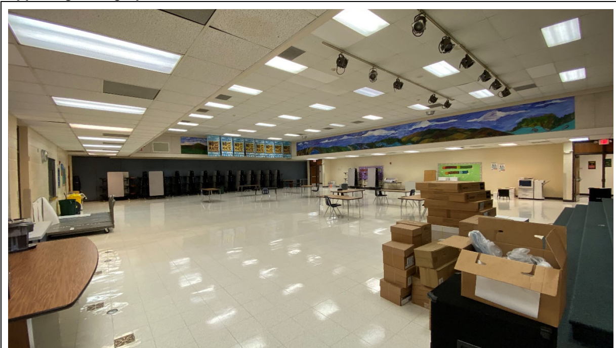
The cafeteria is appropriately sized and connects to the gym with an operable wall. There is only one seating type available and no access to natural light.