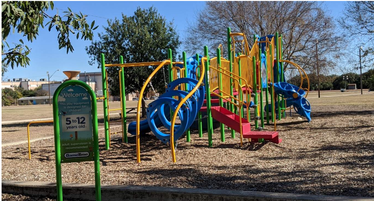
Playground in good condition but uncovered.