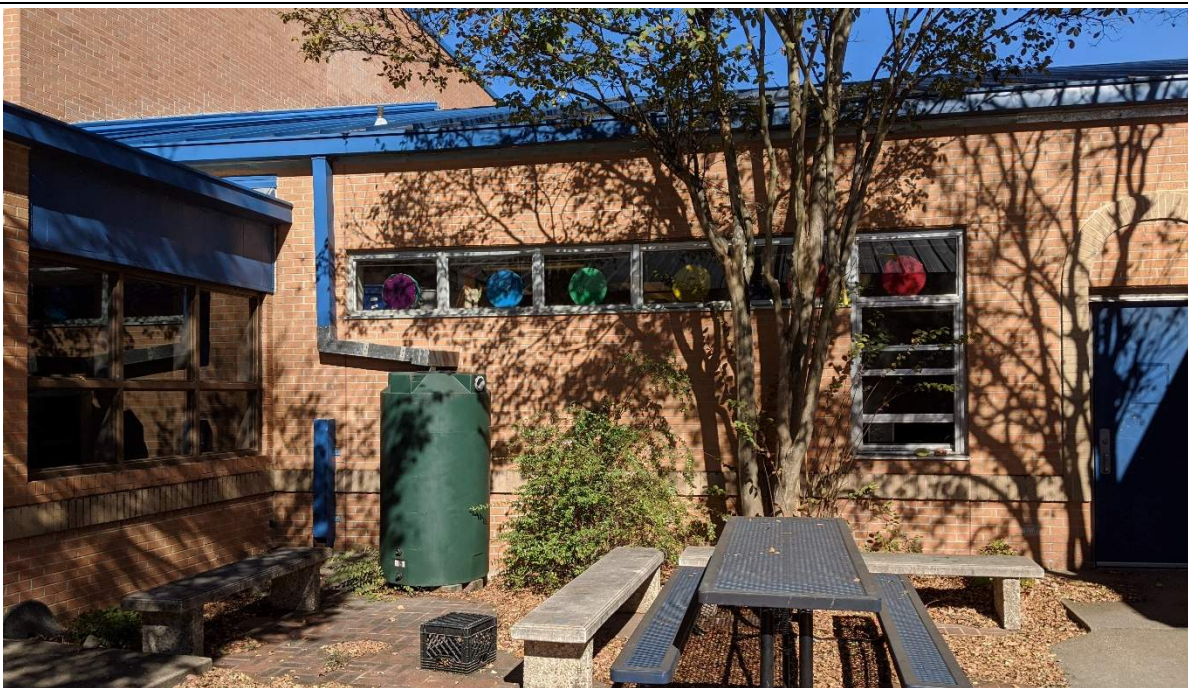
Outdoor courtyard with rain collection cistern.