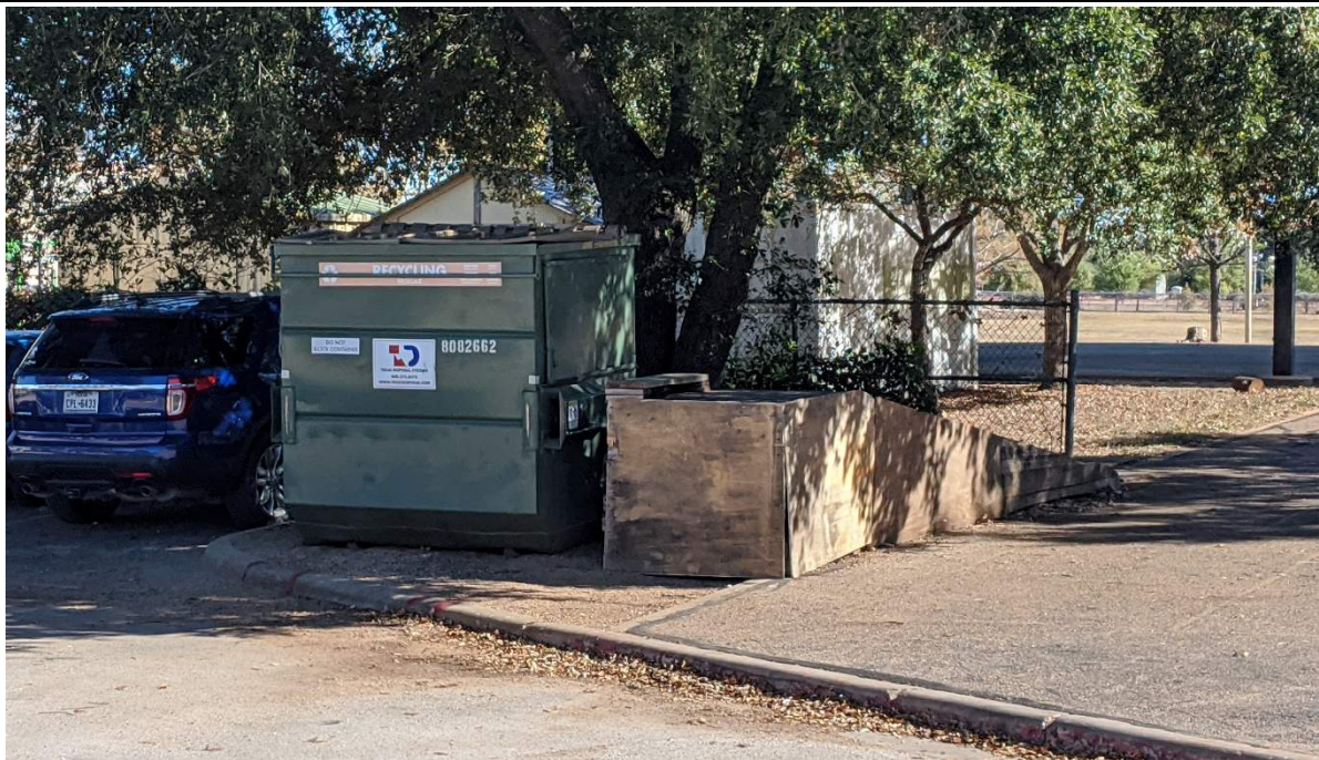
Waste bins are not accessible and makeshift ramp is required.