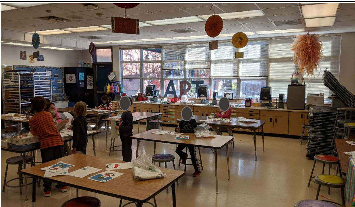
Environmental Quality: Art studio has ample windows and natural light.