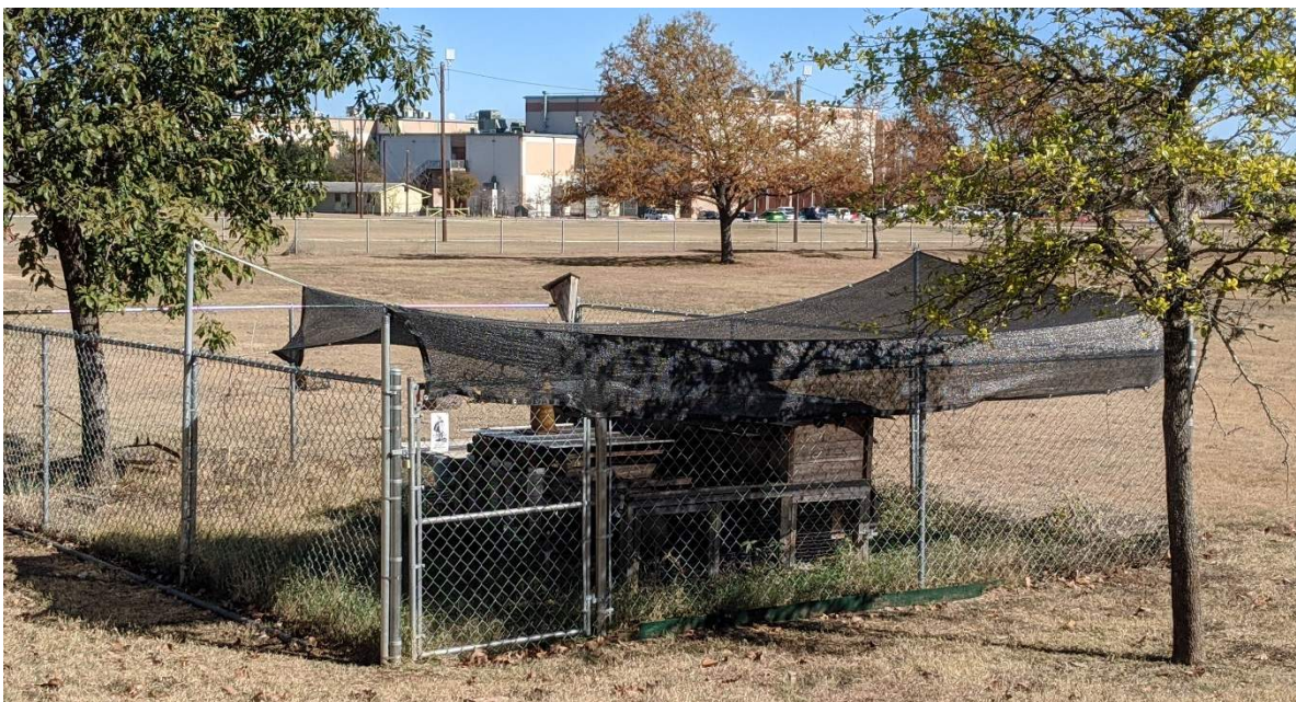
Chicken coop on campus.