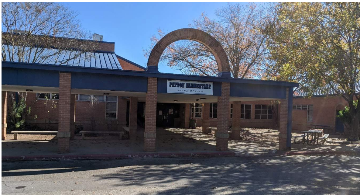
Main entry has good building identification.