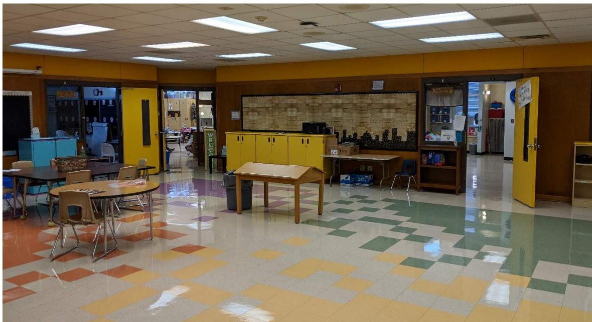
Shared commons area between cluster of studios.