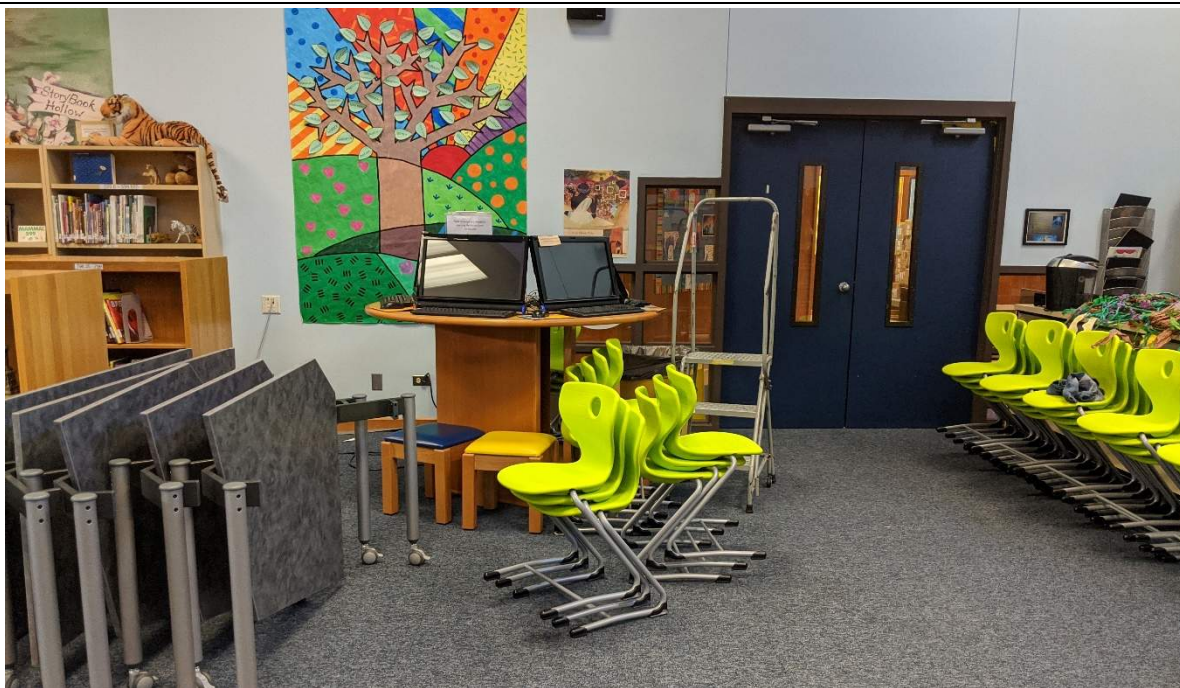
Media Resources: Flexible furniture in library.