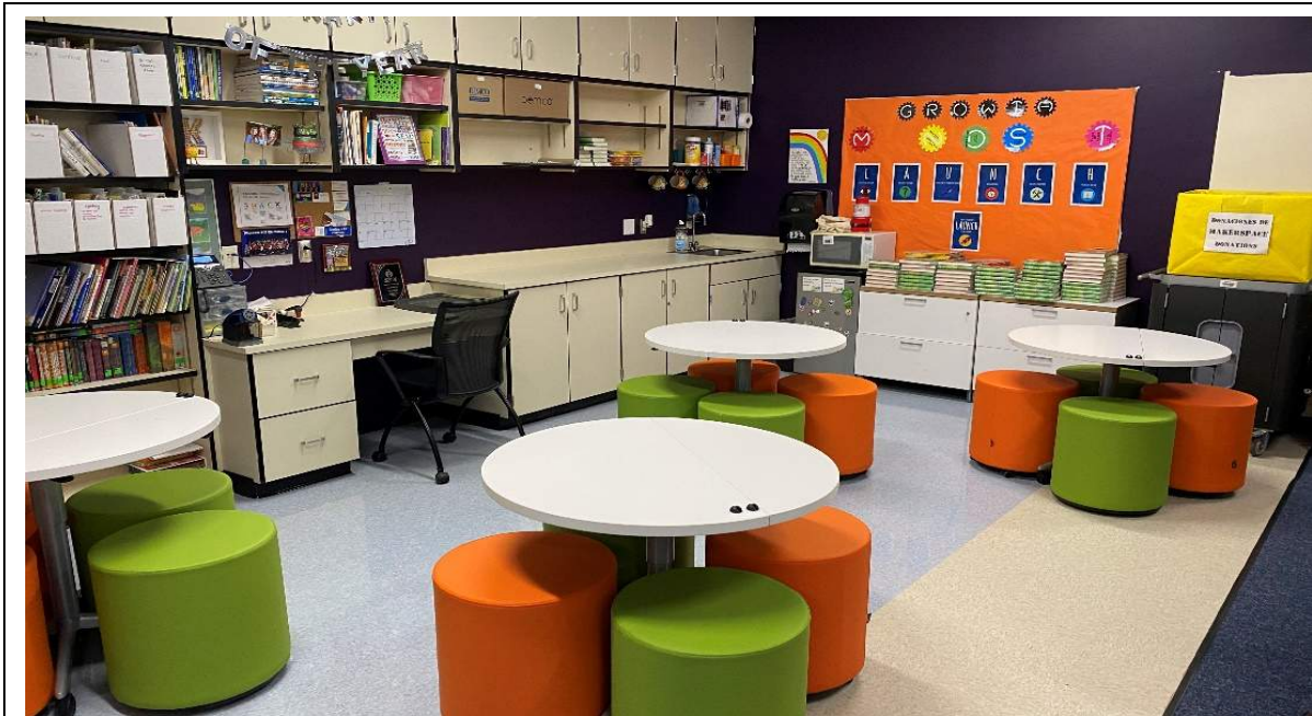
Space used as maker space in library with flexible furnishings and organized supplies.