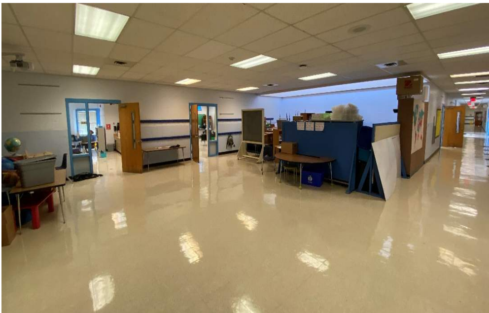
Studios wings are organized around "pods," open spaces equipped with projectors where grade levels and larger groups can gather. Skylights bring in natural light to this space. It is being used for storage, but this is due to COVID protocols.