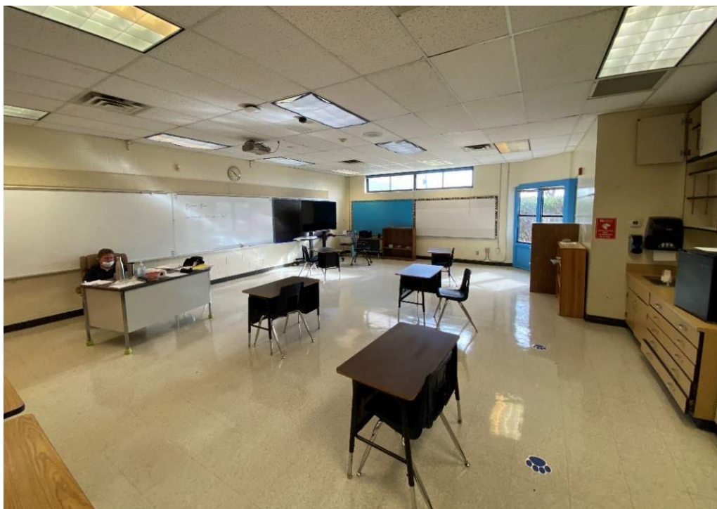
Academics and Learning: Studio storage space and furniture are dated.