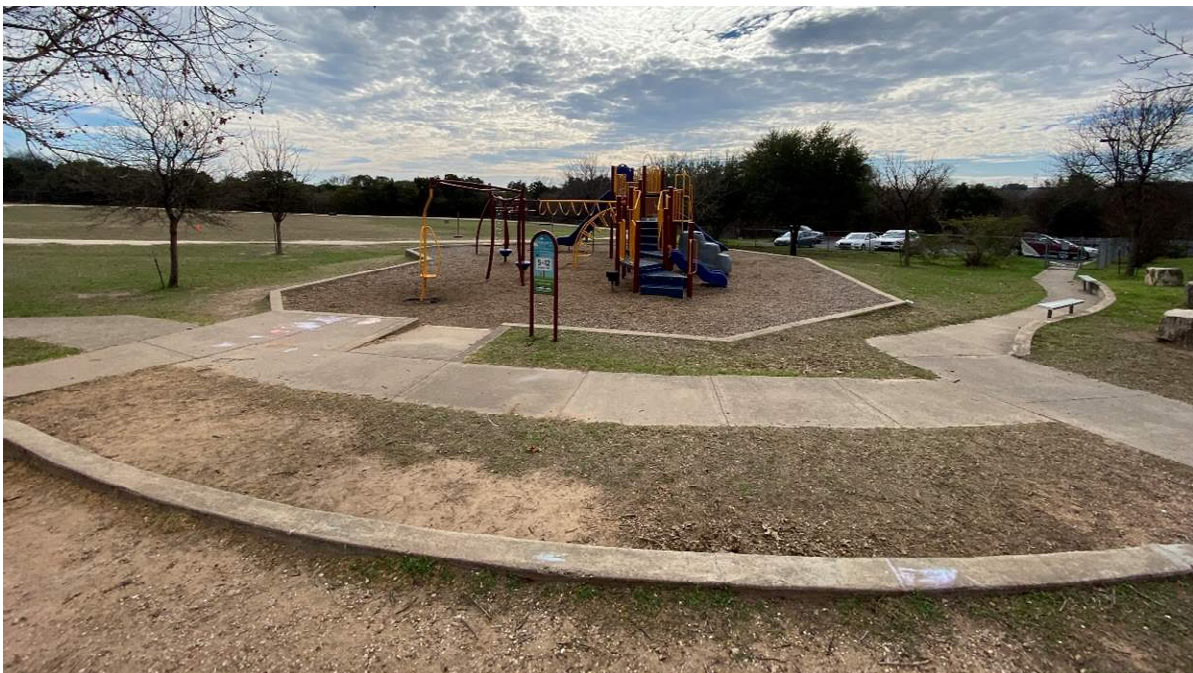
Playground space with no shade. Sidewalks are broken in some places and need upgrades to be ADA accessible. Picnic tables are in poor condition.