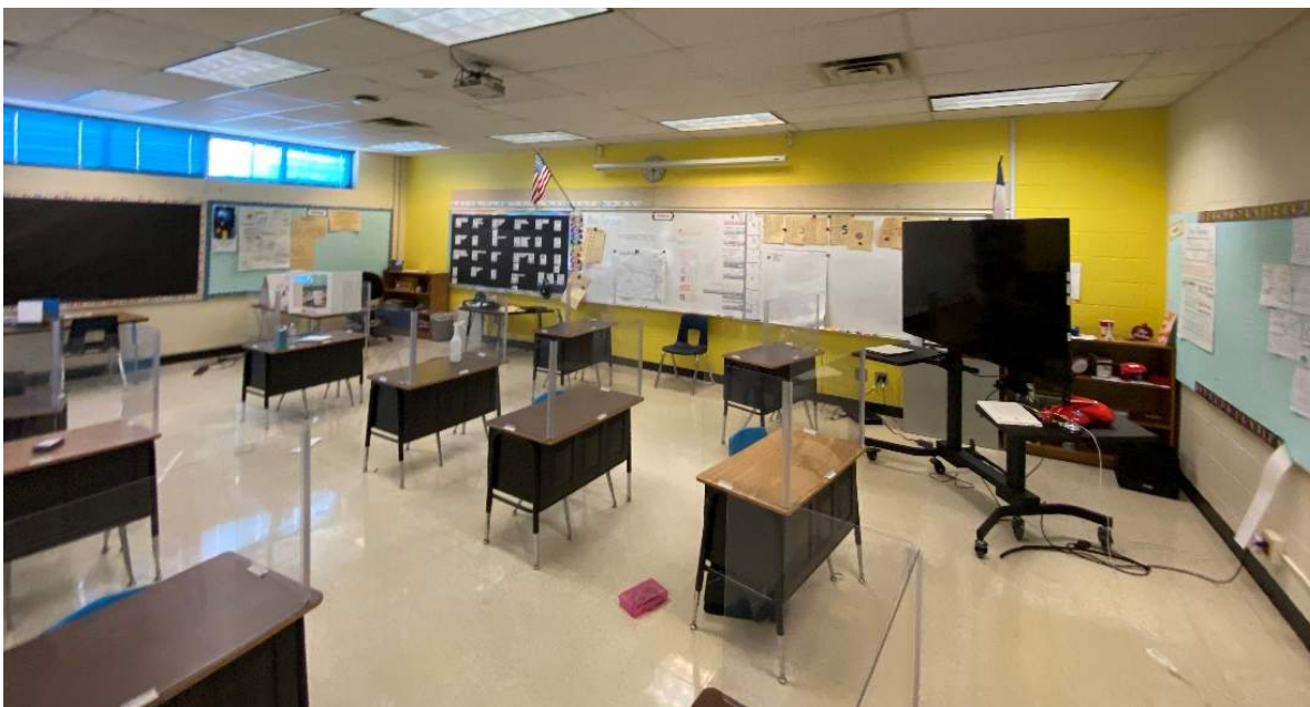
Most studios are equipped with edu-boards and/or projectors, but furniture and other technology need updating.