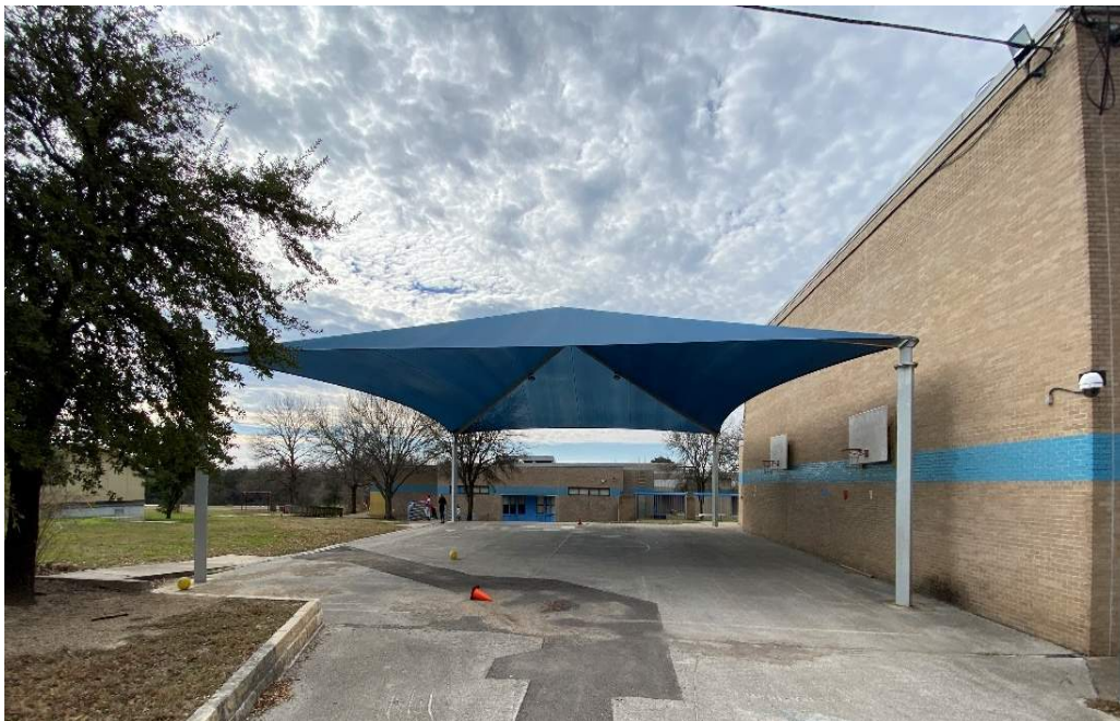
Covered outdoor playing surface provides shade for gym and after-school activities.