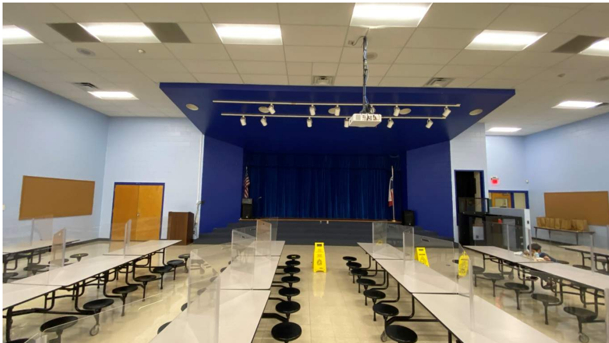
Cafeteria is adequately sized for the capacity but does not meet the needs for the school currently. The finishes need updating and acoustic control is also needed.