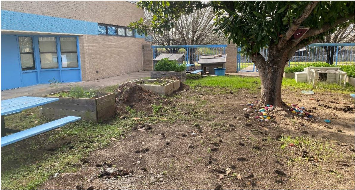
Outdoor garden is a valued learning space and has one medium-sized tree to provide some shade.