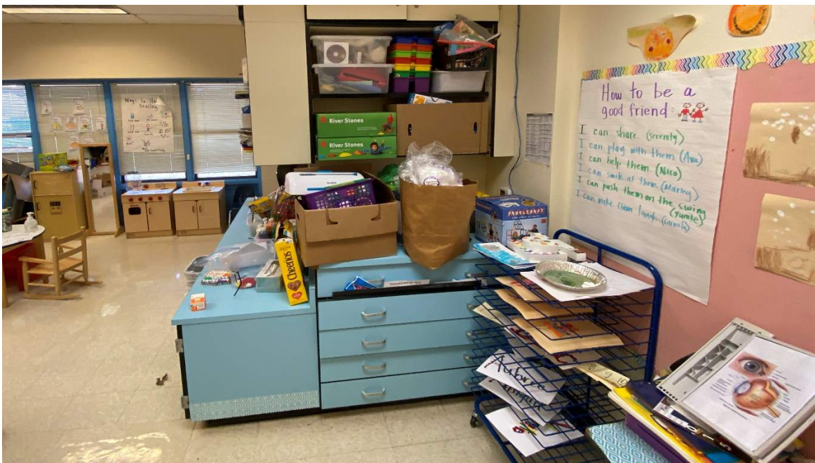
Storage space in most studios is inadequate and dated.