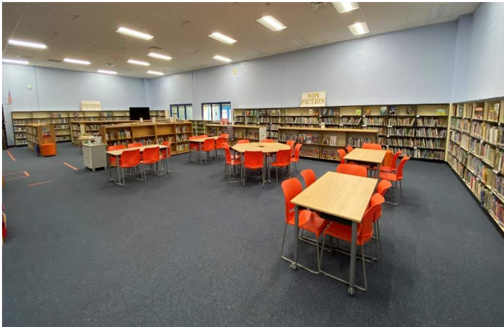
Furniture in library is new, flexible and easy to reconfigure for different sized groups.