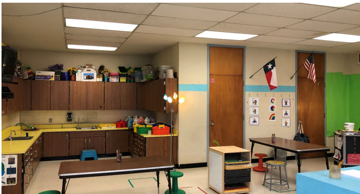
Visual and Performing Arts: Art studio is undersized but includes kiln room and storage.