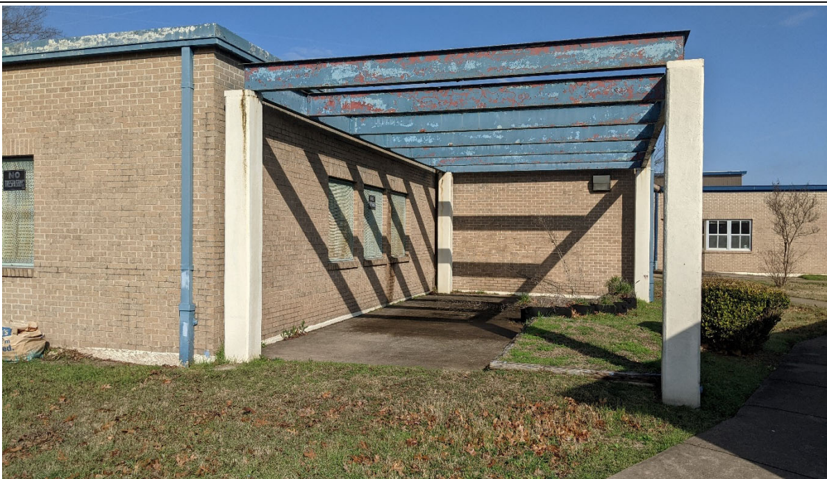
Outdoor Learning and Activity: Trellised areas in corners of school could be modified to be functional outdoor studios.