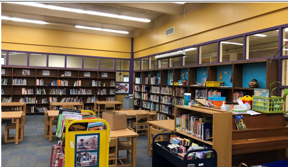
Media Resources: Heavy furniture in library limits flexibility.