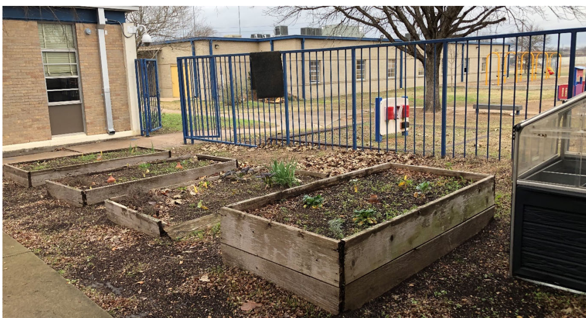
Outdoor Learning and Activity: Learning garden planters need repairs.