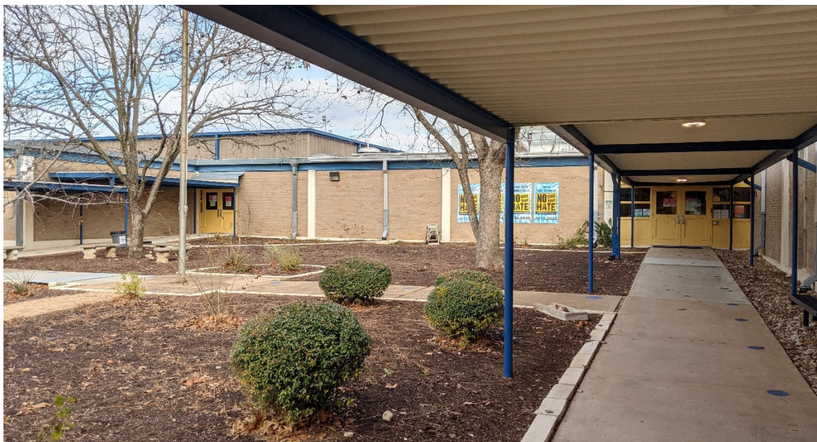
Exterior: Drop-off canopy at main building entry.