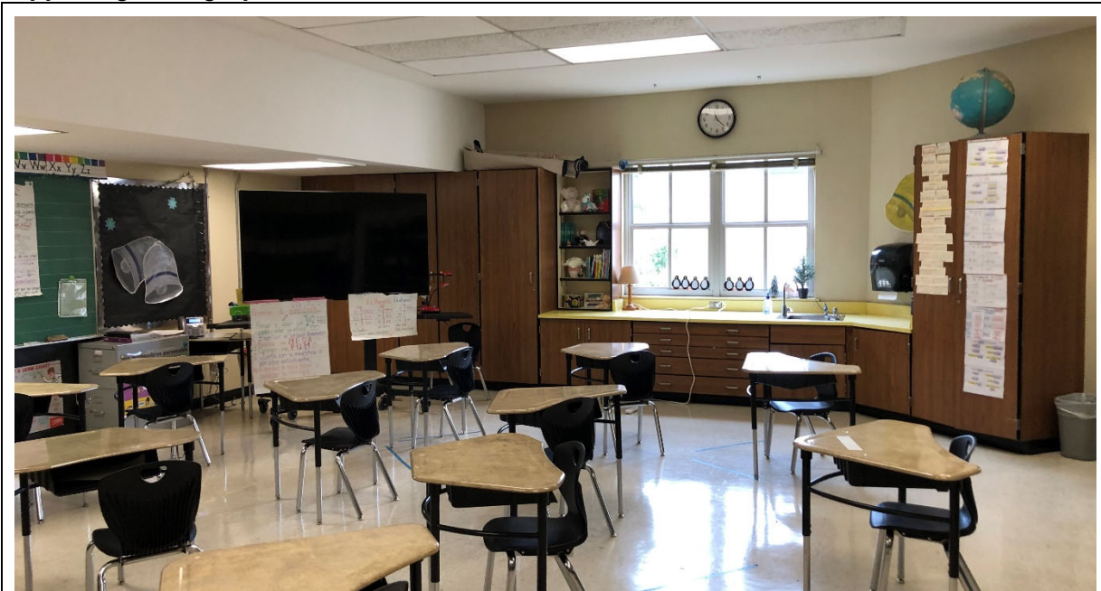
Academics and Learning: Typical studio with mobile furniture and access to natural light.