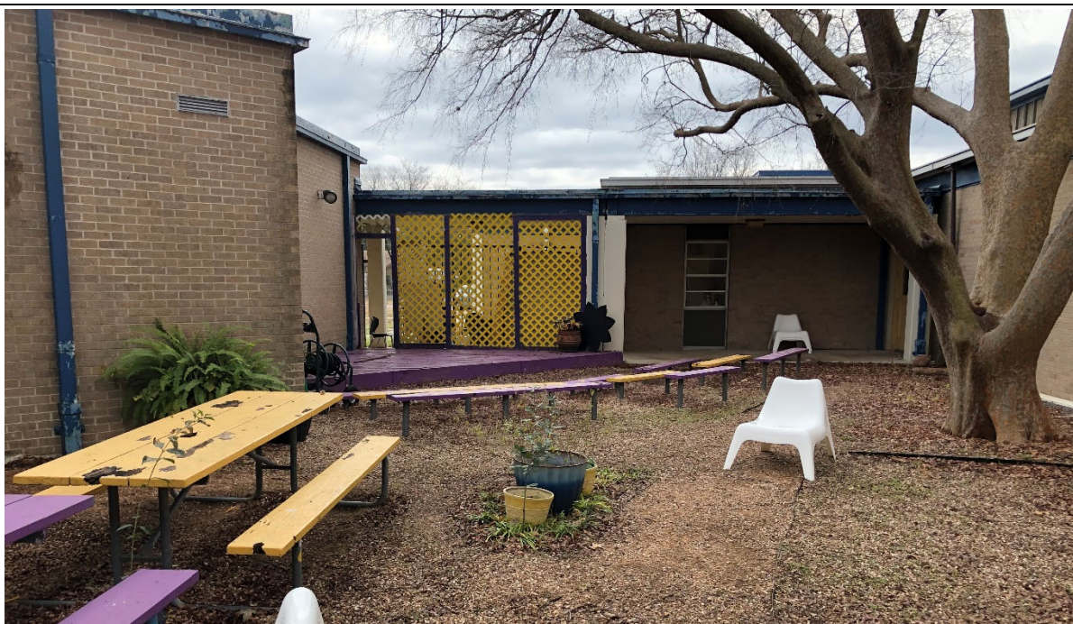
Outdoor Learning and Activity: Courtyard space is accessible from studios.