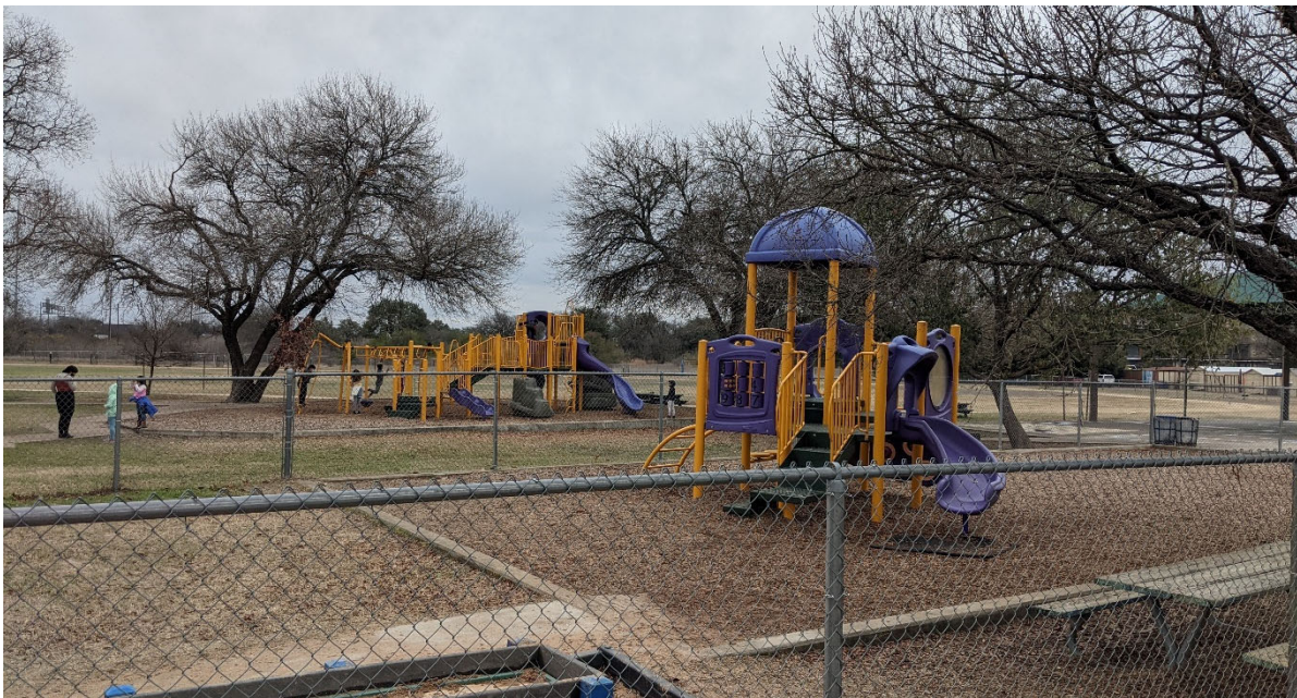
Outdoor Learning and Activity: Playscapes are in good condition but do not have shade.