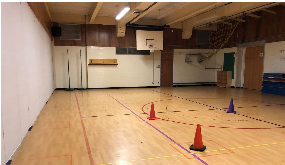
PE and Wellness: Gym floor is new, but rest of gym is very dated.