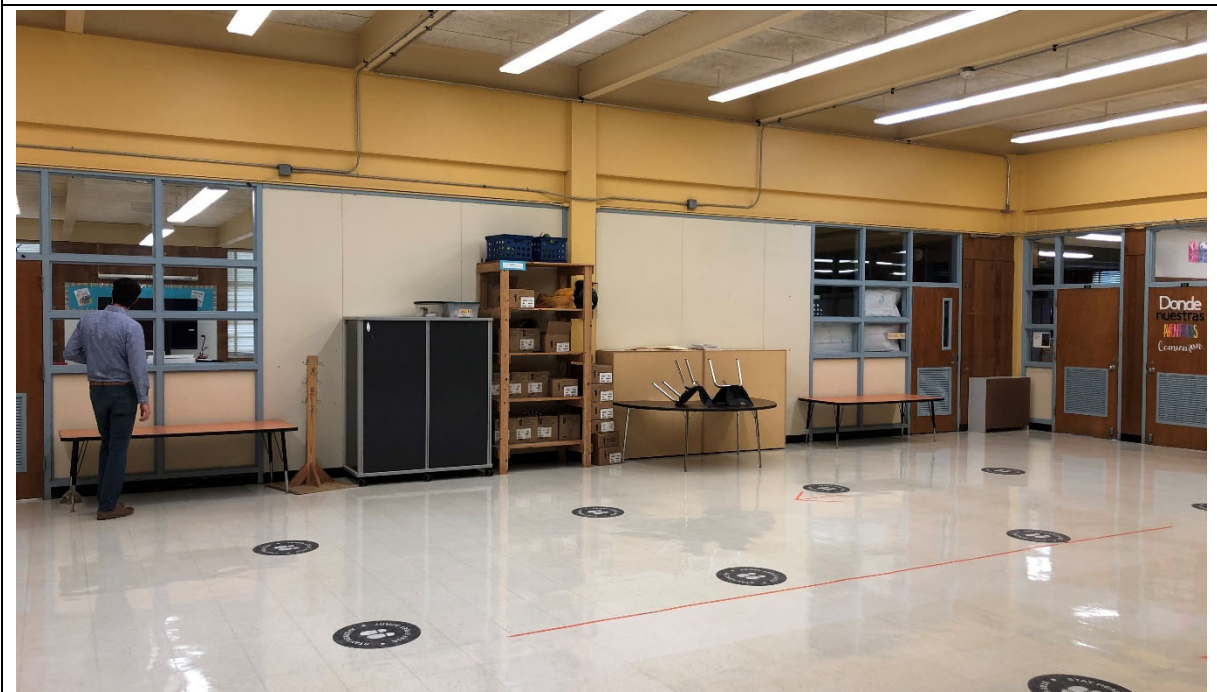
Academics and Learning: Typical common space between studios.