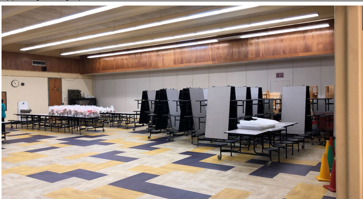
Food Services: Cafeteria with updated floor and original walls and ceiling.